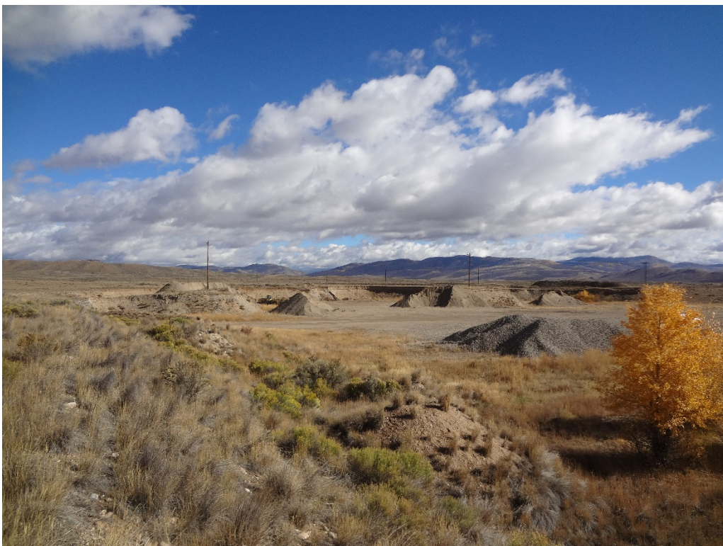
View of north mine area from the south end of the main topsoil stockpile looking northeast