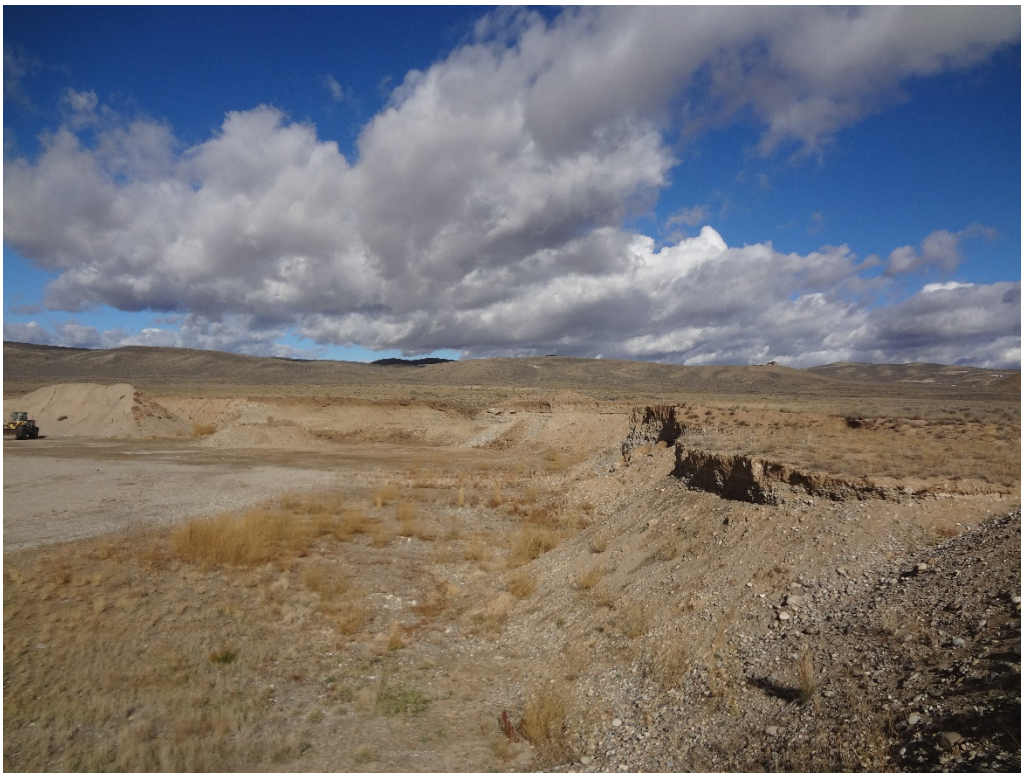
View of the eastern portion of the north highwall from the east end of the highwall