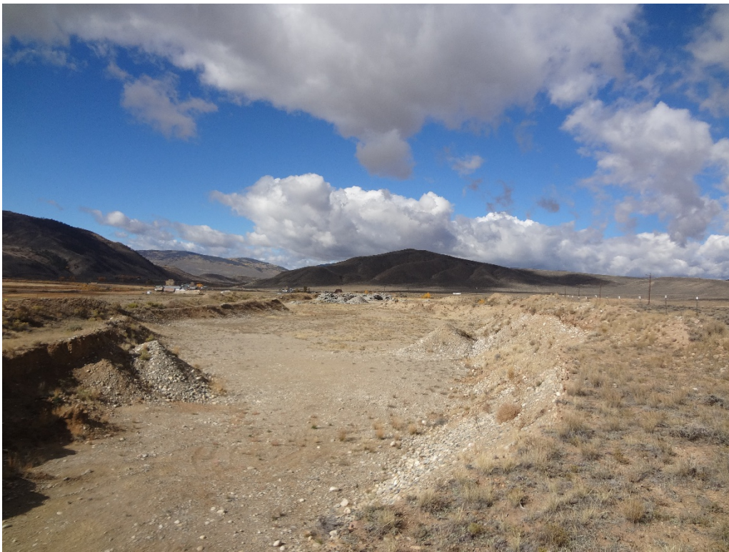
View of south mine area from the east end of the site looking west