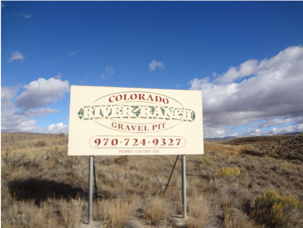
Colorado River Ranch mine sign