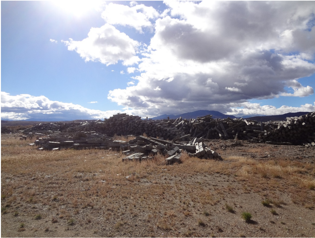
View of imported concrete railroad ties stockpile