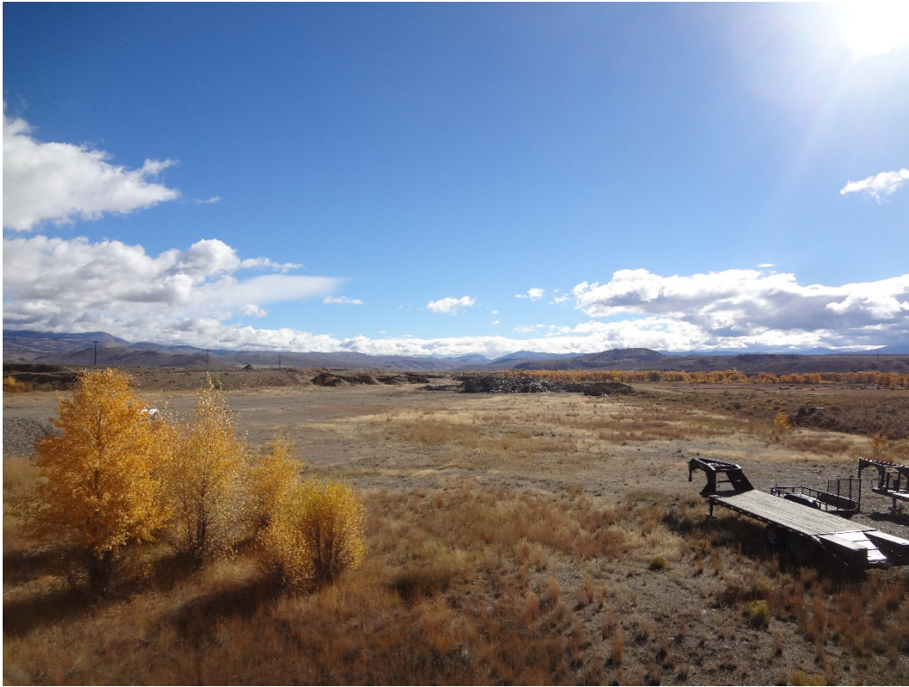
View of south mine area from the south end of the main topsoil stockpile looking east