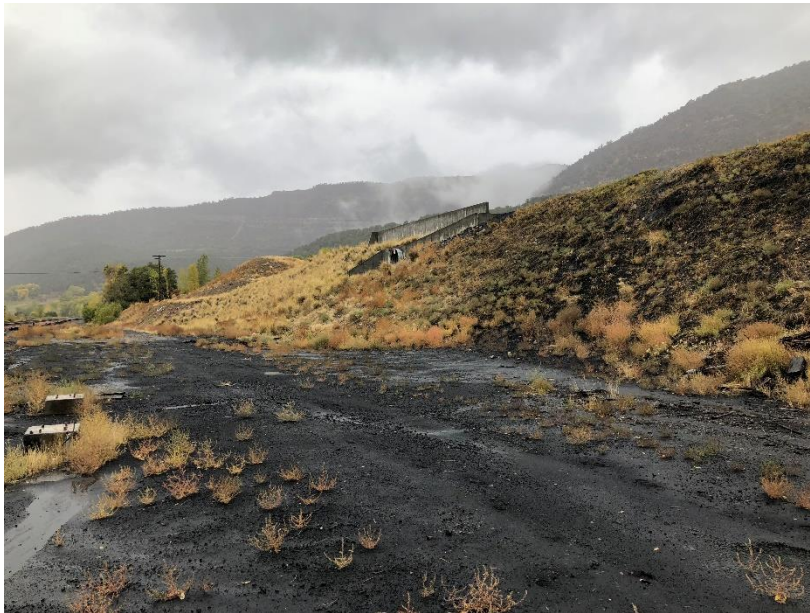
Area 9 and hill below former coal storage area, looking west

Number of Partial Inspection this Fiscal Year: 2