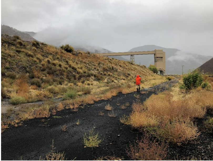
Area 9 and hill below former coal storage area, looking east