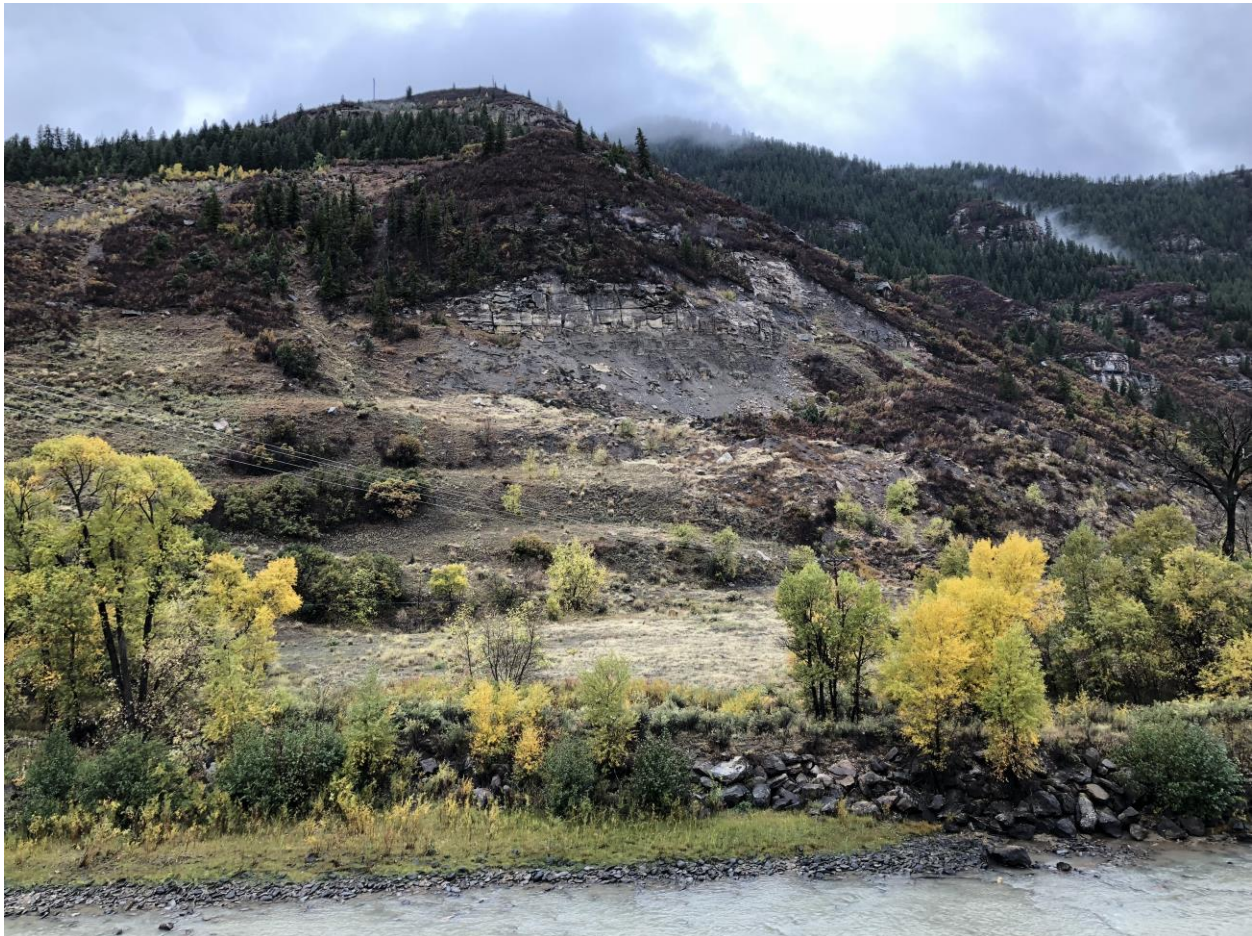
The Bear Mine from the highway

Number of Partial Inspection this Fiscal Year: 3