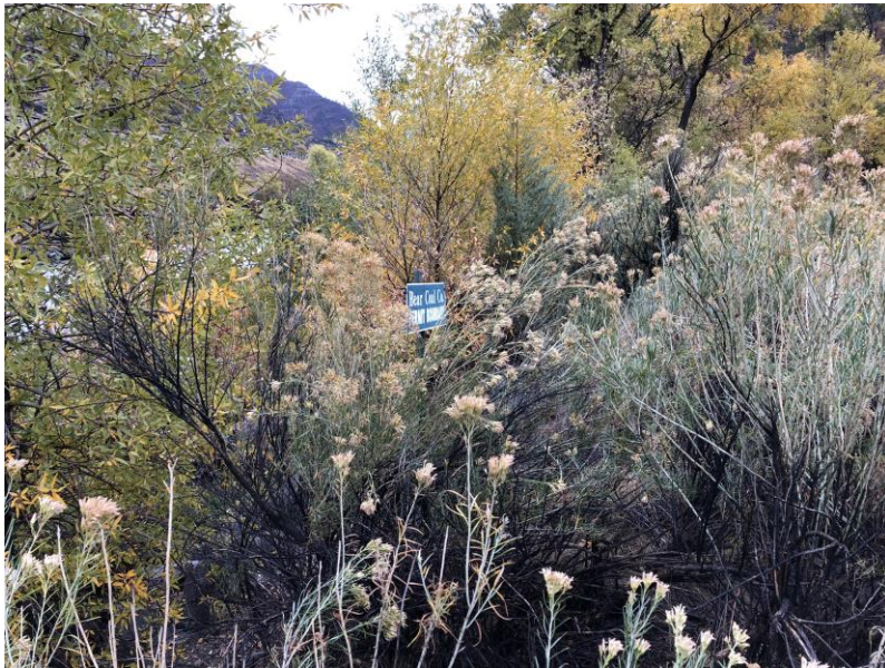
Permit Boundary sign at east end of site

Number of Partial Inspection this Fiscal Year: 3