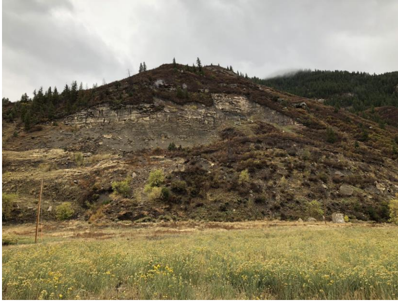
Smoke from coal fire was seen above the scarp