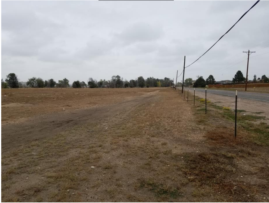
Figure 1. From the southeast corner of the AR01 area looking north.