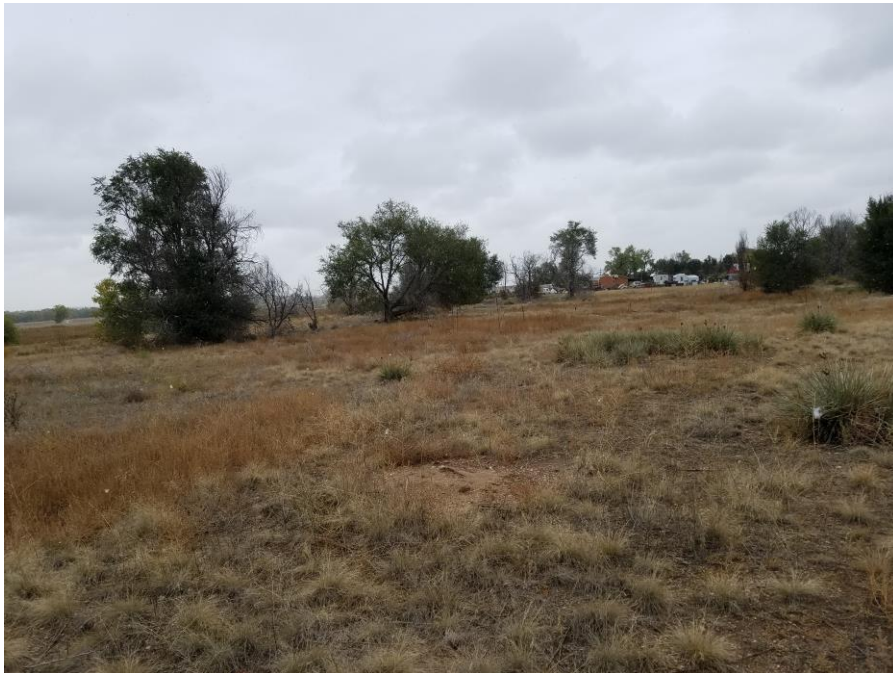
Figure 2. From the center of the AR01 bond release area looking northwest.