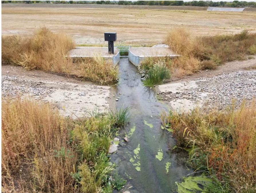
Figure 5. Orr Drain discharging into the pit.