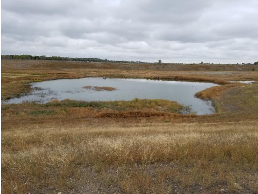
Figure 7. Water pooled from Orr Drain discharge at the north east portion of the pit.