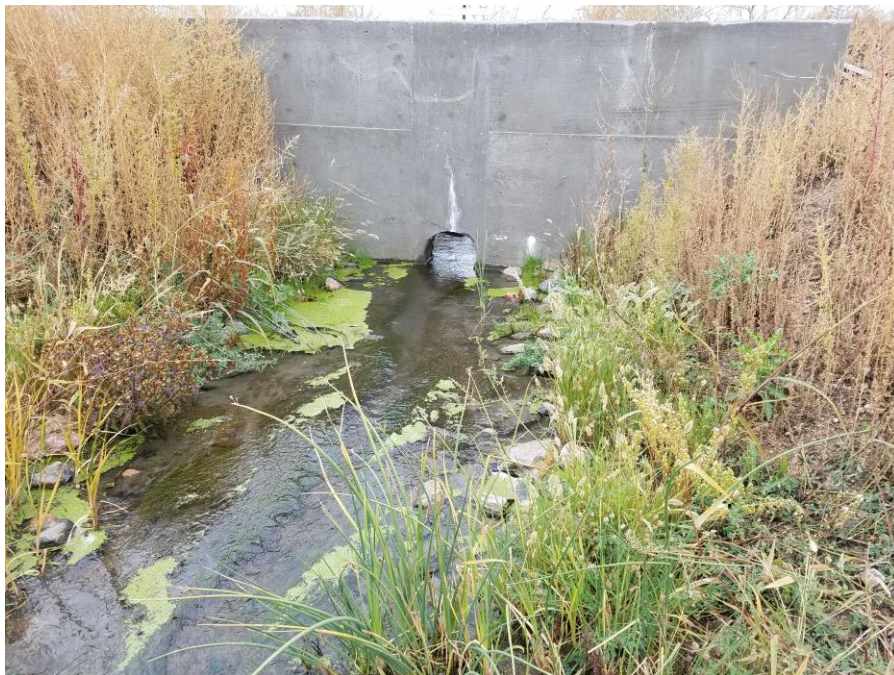
Figure 6. Orr Drain outlet.