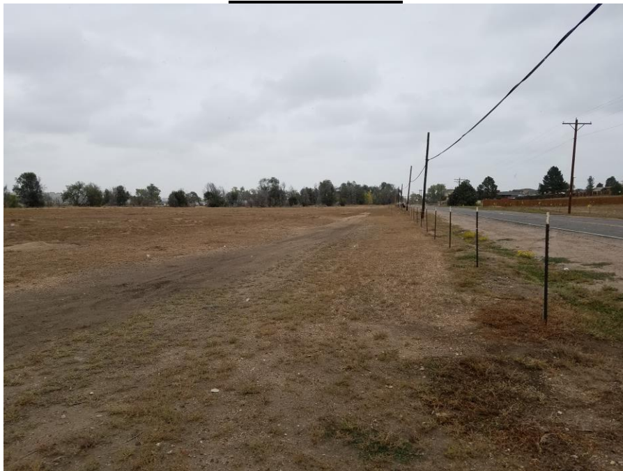
Figure 1. From the southeast corner of the AR01 area looking north.