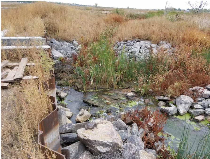
Figure 4. From the south end of the Orr Drain looking north.