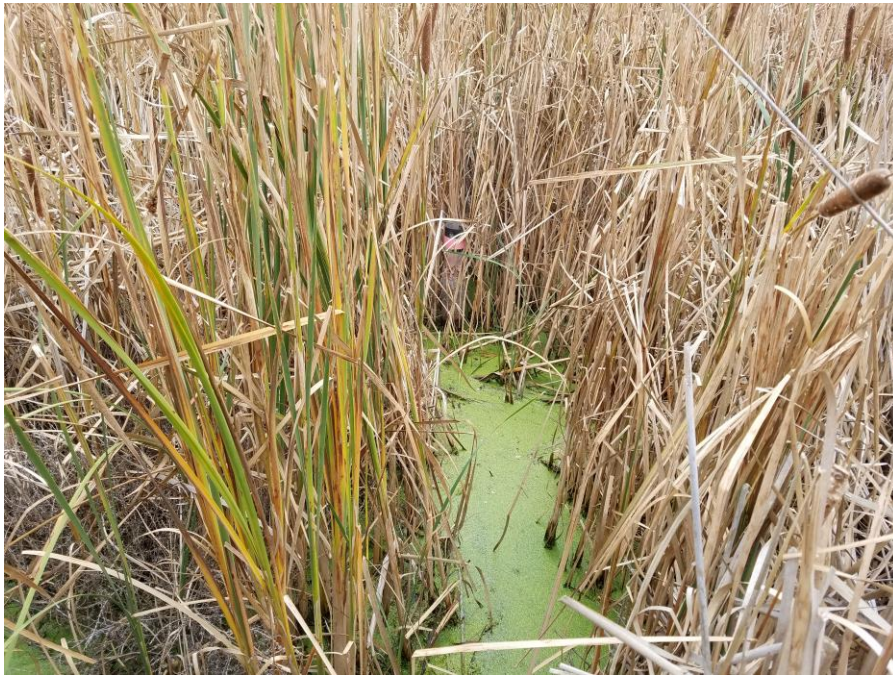
Figure 8. Monitoring Well HZMW-11A.