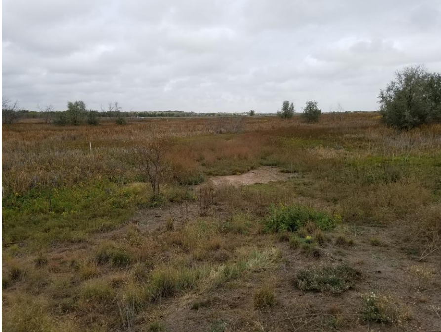
Figure 3. From the southeast side of the Orr Property looking west.