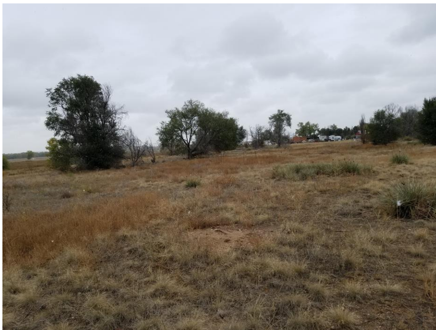
Figure 2. From the center of the AR01 bond release area looking northwest.