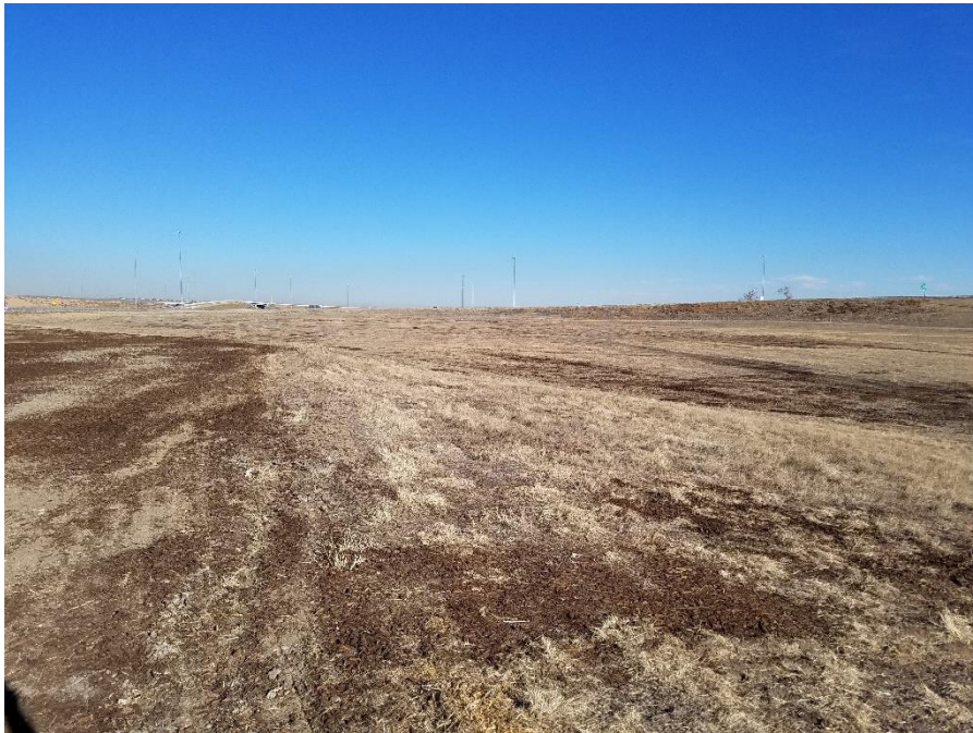
Figure 2. From the entrance of the mine site looking north.