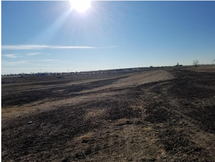
Figure 3. From the entrance of the mine site looking south.