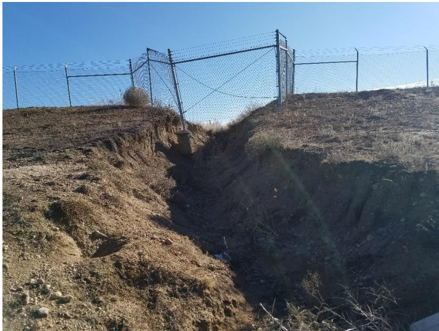
Figure 4. Large erosion gully on the east-central pit slope.