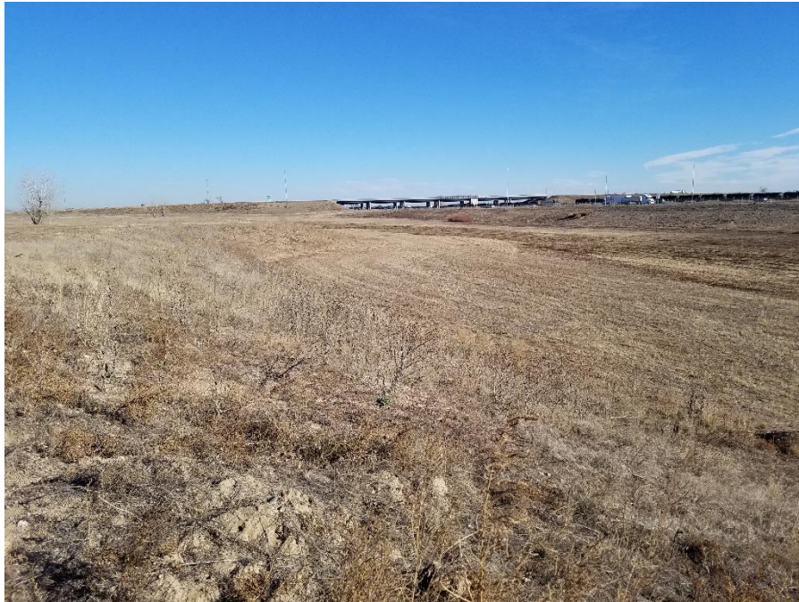
Figure 5. From the south end of the site looking north.

Neil Thompson E-470 Public Highway Authority 22470 E. 6th Parkway Aurora, CO 80018