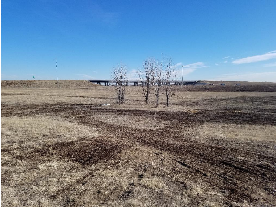
Figure 1. From the entrance of the mine site looking northeast.