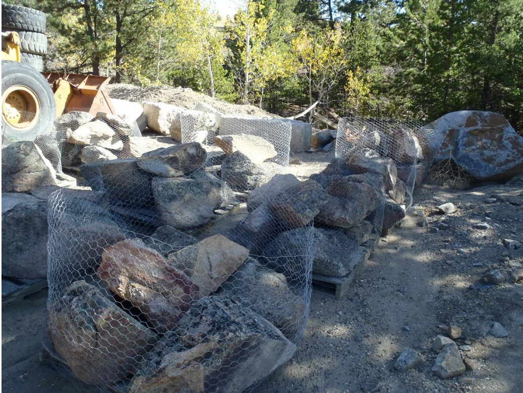
Photo 2. Palletized moss rock on site.