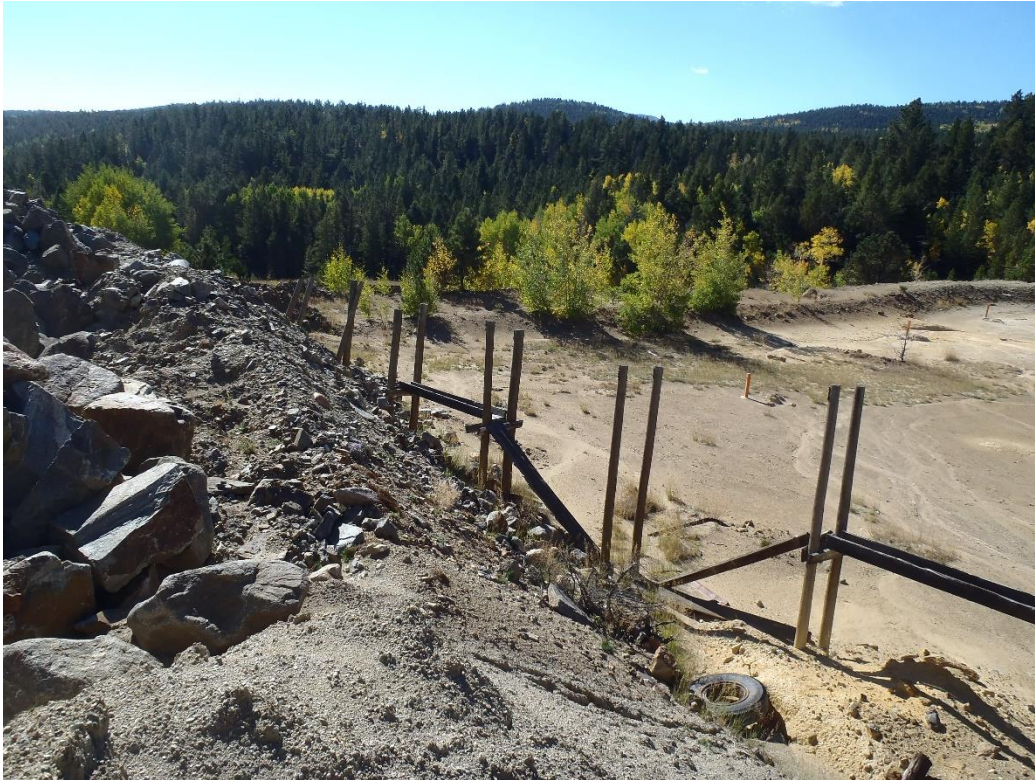
Photo 4. Extent of Rock-X operation (south side, looking SE, Leavenworth Gulch tails on right).