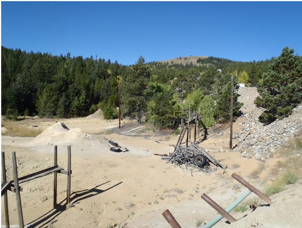
Photo 3. Extent of Rock-X operation (south side, looking NW, Leavenworth Gulch tails on left).