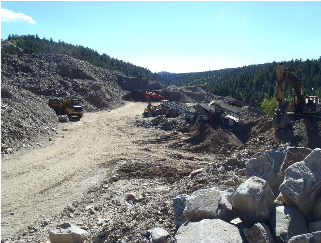
Photo 1. Rock-X operations on Central City Parkway Spoil Pile (looking SE).