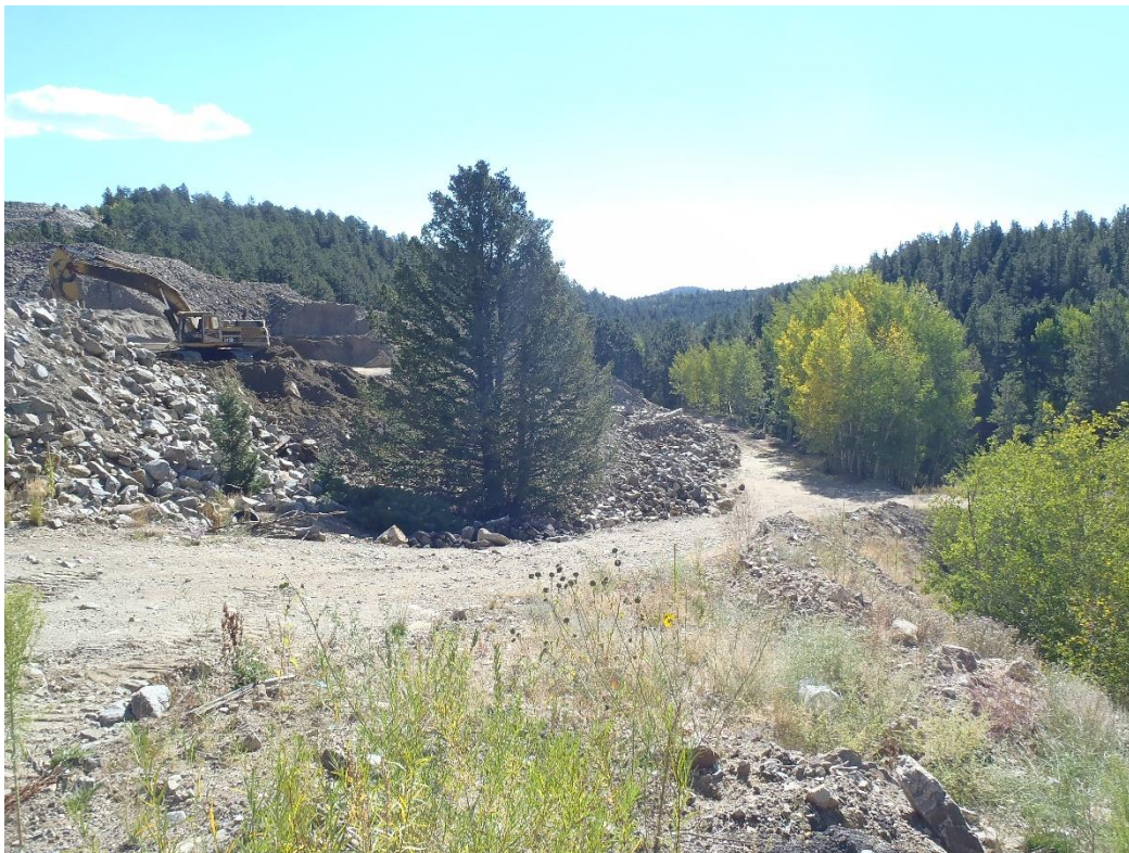
Photo 5. Primitive road along south edge of Central City Parkway spoil pile (looking SE).