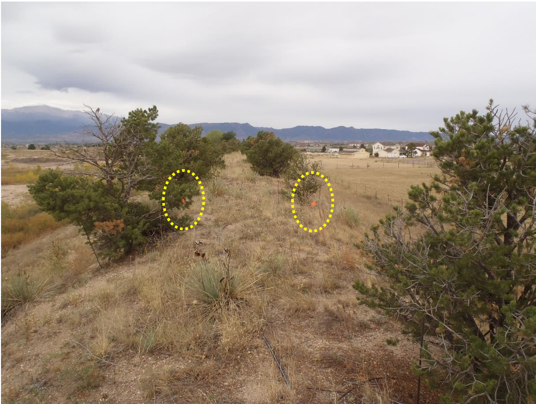
Photo 1. Typical orange flags in between survey lathe (looking west from top of north berm).