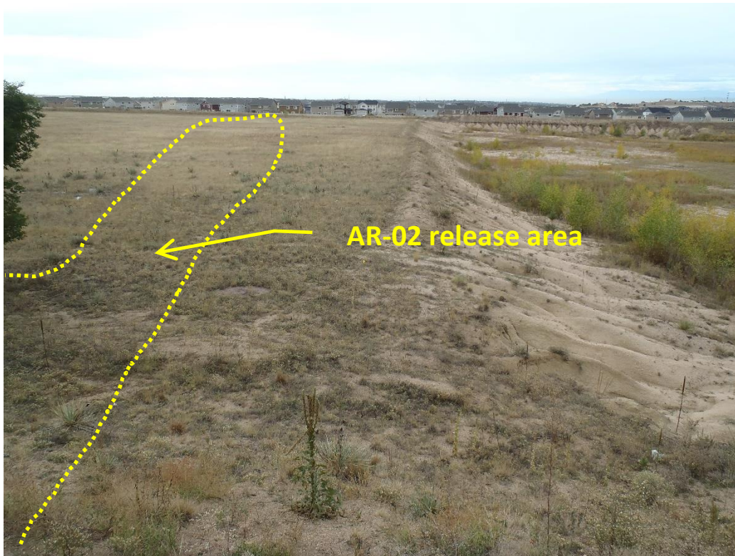
Photo 2. Undisturbed release area (NE corner of pit, looking south).