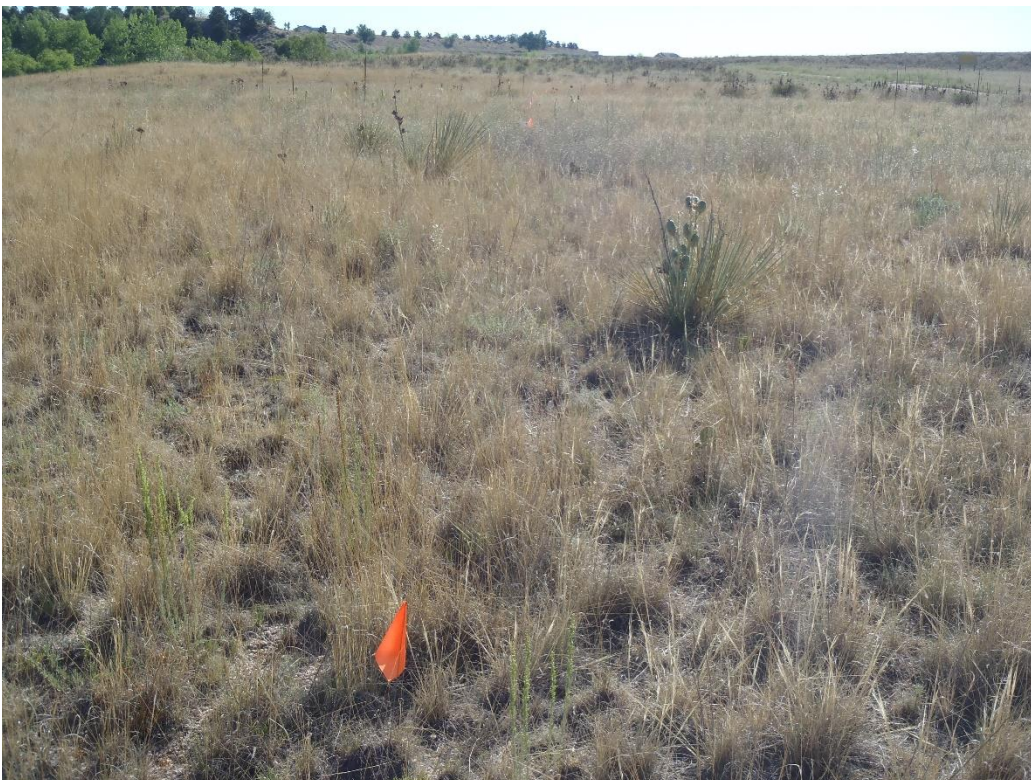
Photo 2. Undisturbed west side release area (NW corner, looking NE).