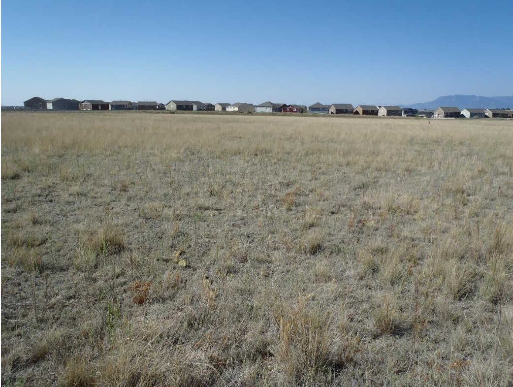
Photo 3. Undisturbed east side release area (NE corner, looking SSW).