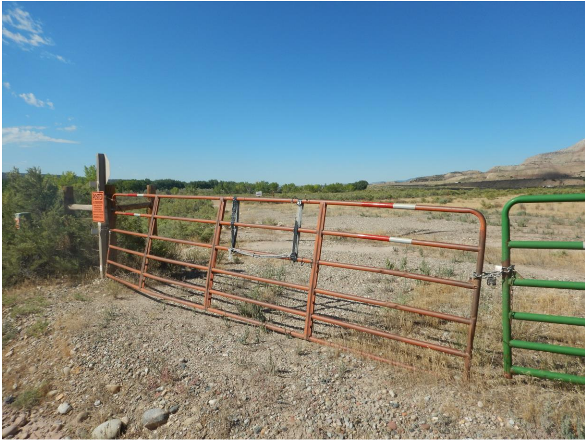
No mine sign present