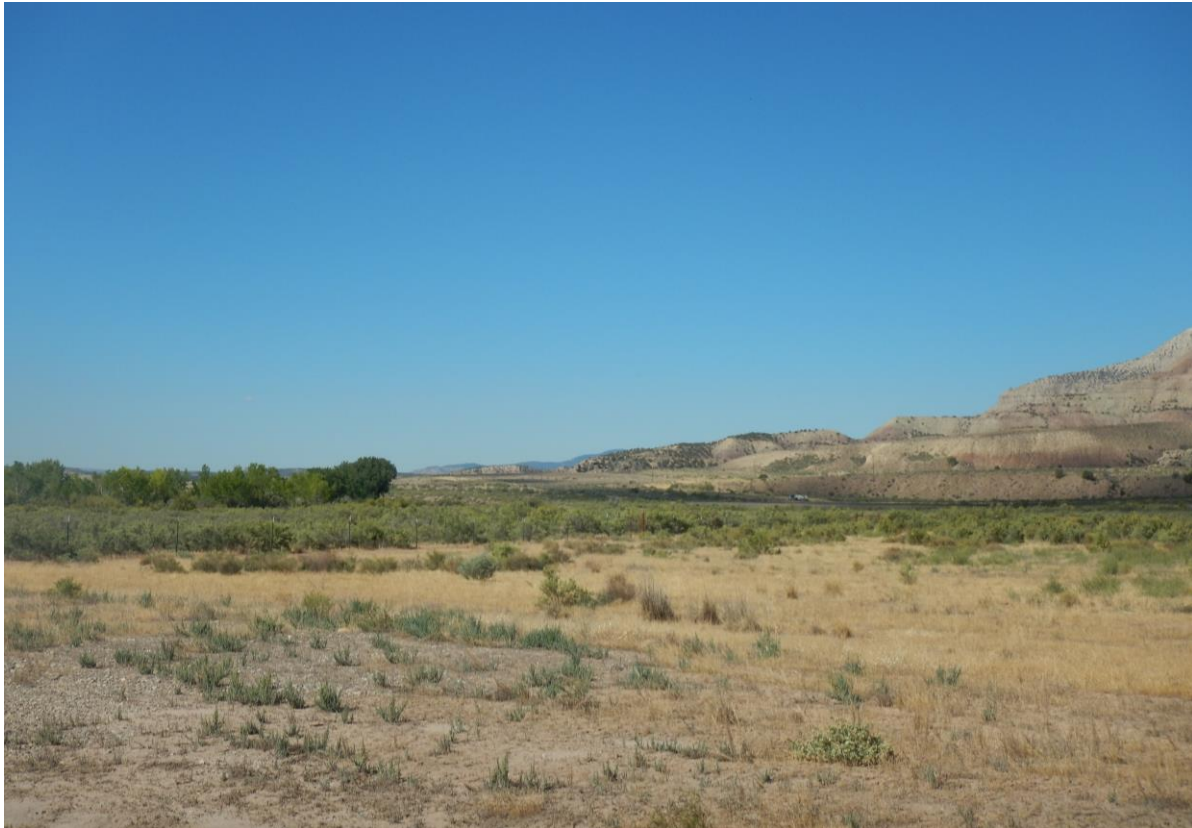
No mining conducted to date