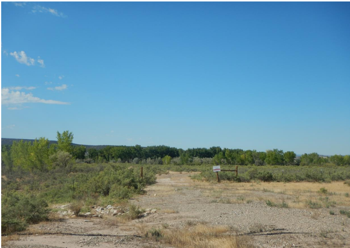
No additional disturbances since pre-operational inspection