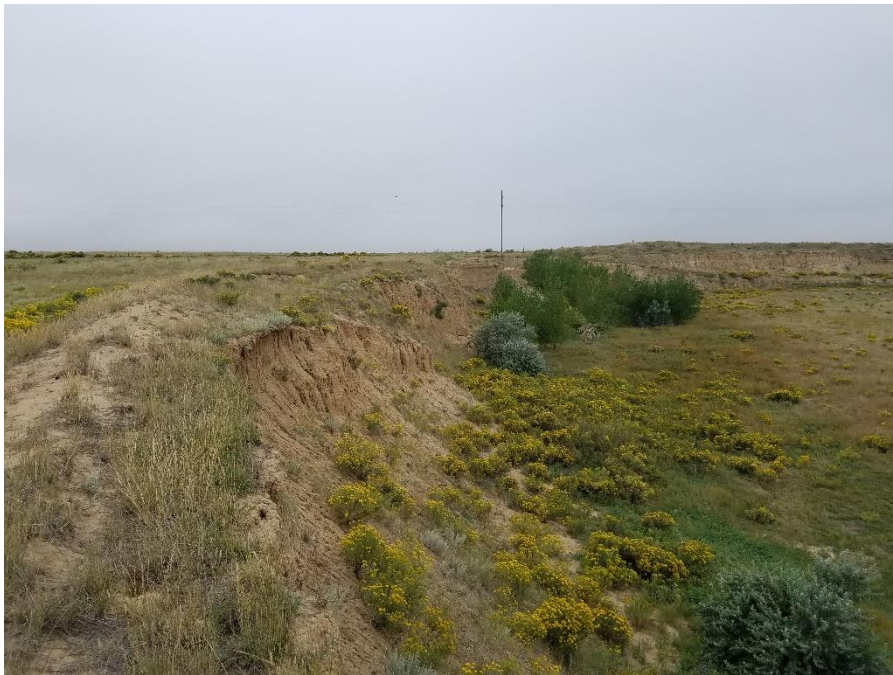
Figure 4. From the southeast corner of the site looking west.