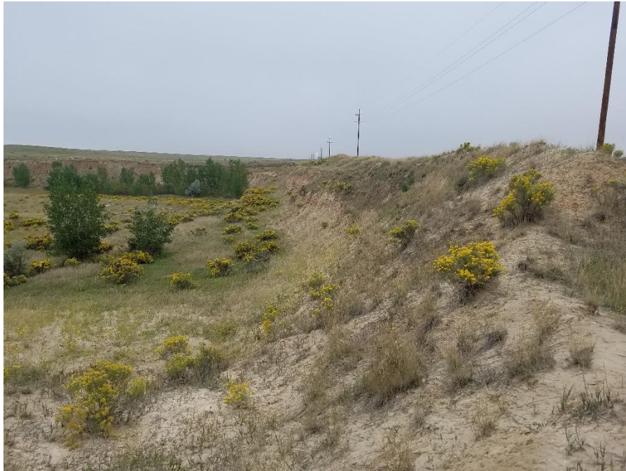
Figure 1. From the northwest corner of the site looking south. Highwall along County Road 213/Bartlett Road