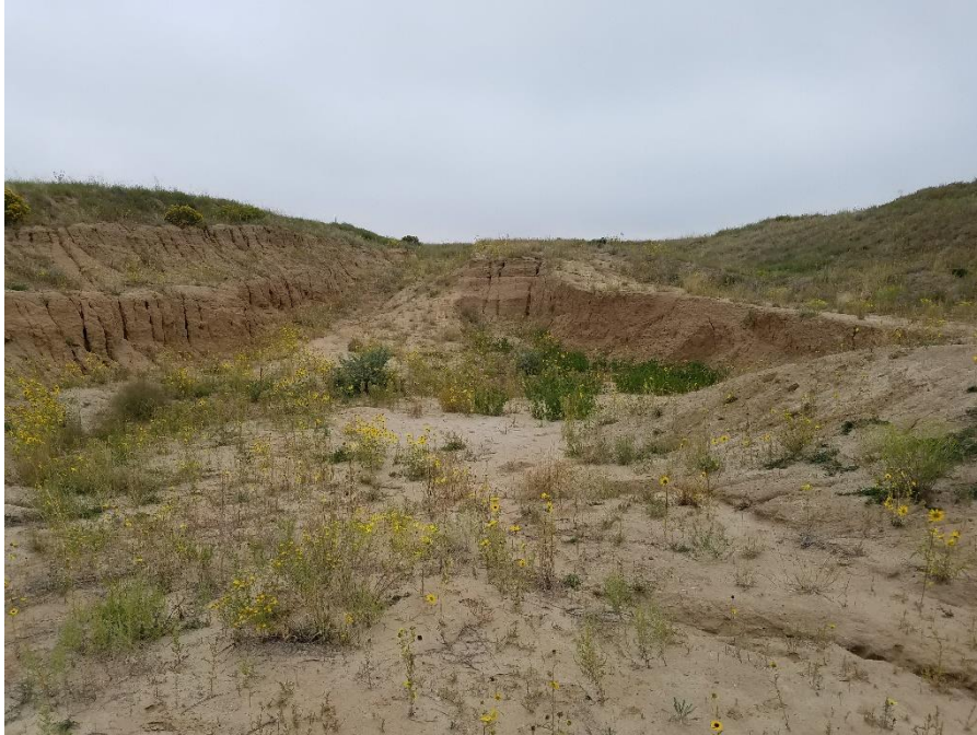
Figure 3. Most recent excavation in southeast corner.