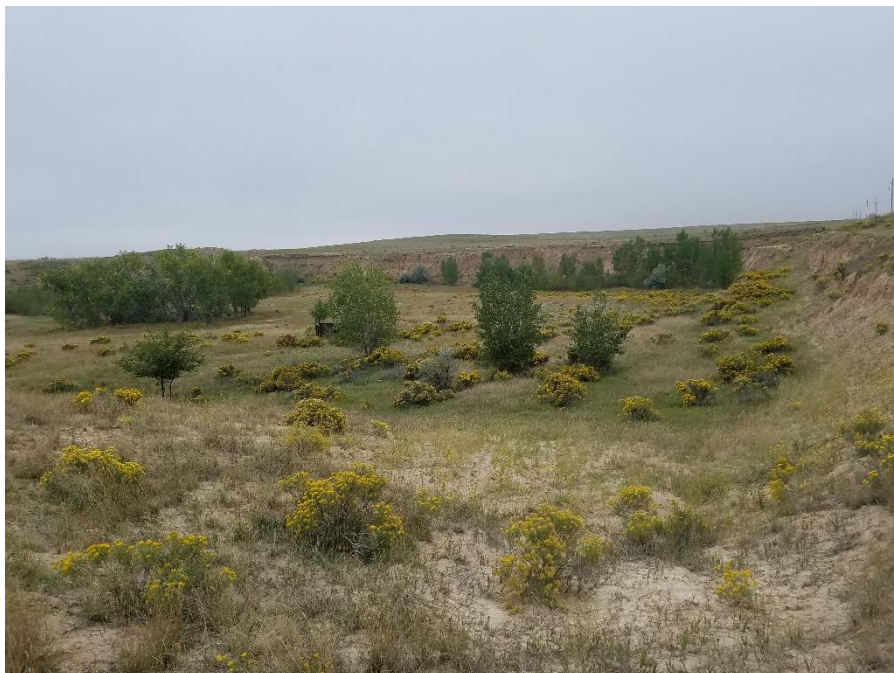
Figure 2. From the northwest corner of the site looking southeast.