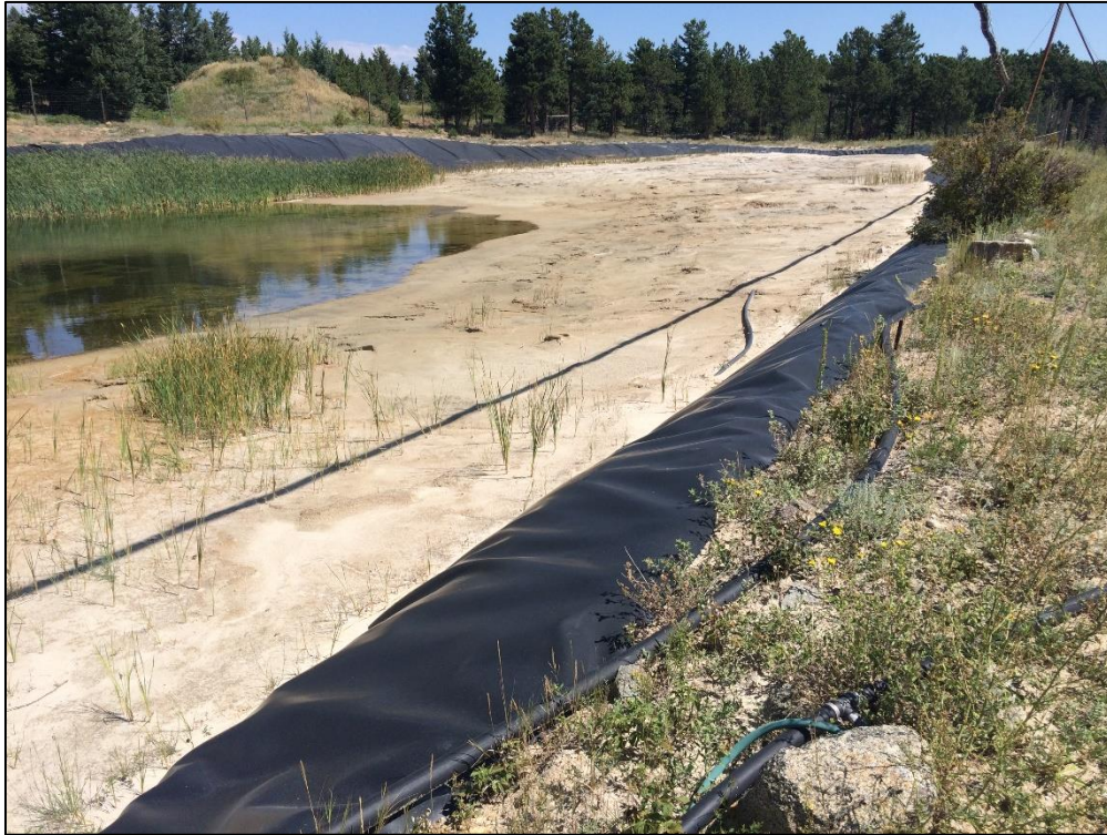
Photo 11. View looking across southern edge of tailings impoundment, showing an available freeboard of at least two feet (as required).