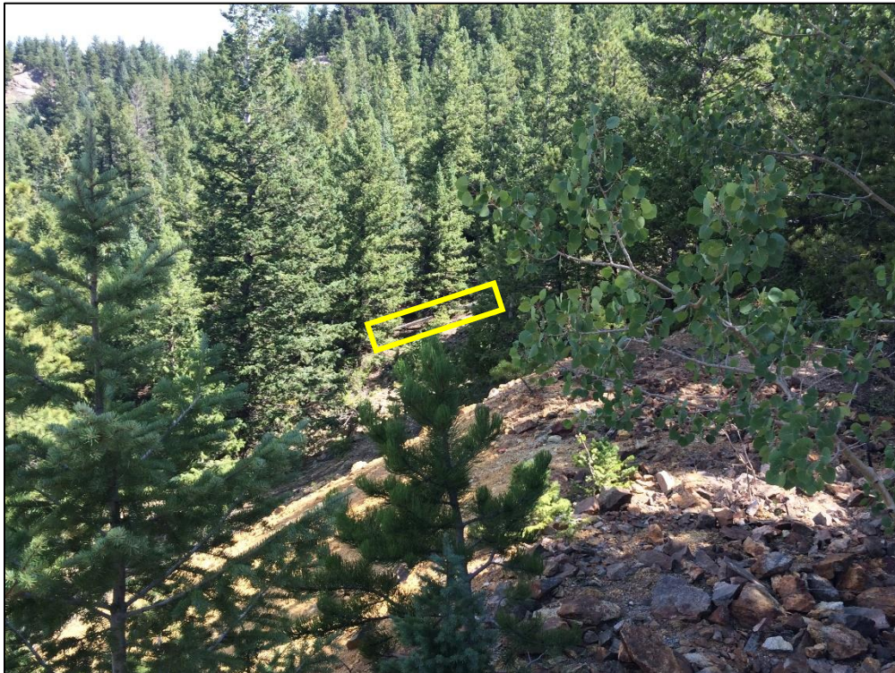
Photo 6. View looking northeast from Times Mine area, showing portion of existing pipeline in Lick Skillet Gulch visible (indicated with box). This pipeline was once used to convey water from the creek to the mill operation.