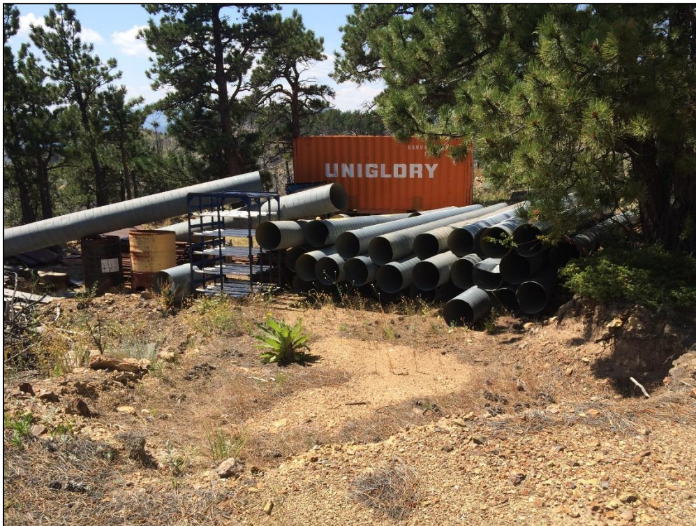
Photo 20. View looking across equipment storage area located southwest of ore stockpile. This area is located partially outside of the approved permit area.