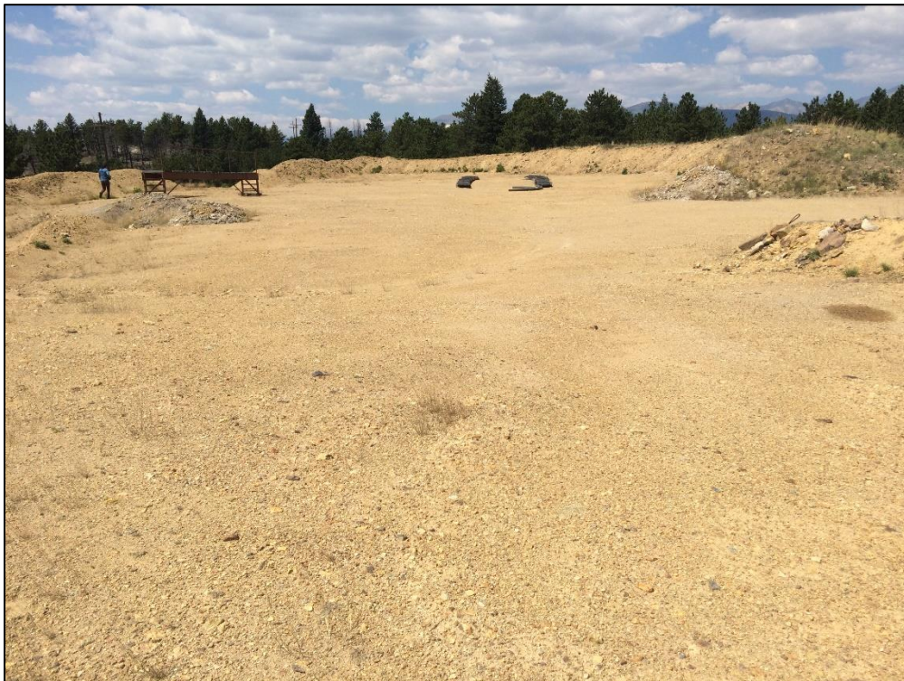
Photo 16. View looking southwest across top of ore stockpile stored southwest of mill building.