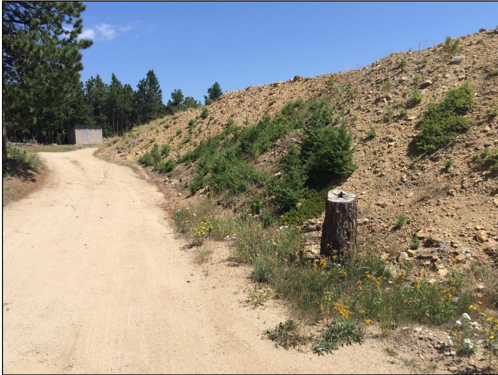
Photo 17. View looking east from access road, showing northern side of ore stockpile. The stockpile slopes appeared to be stable.