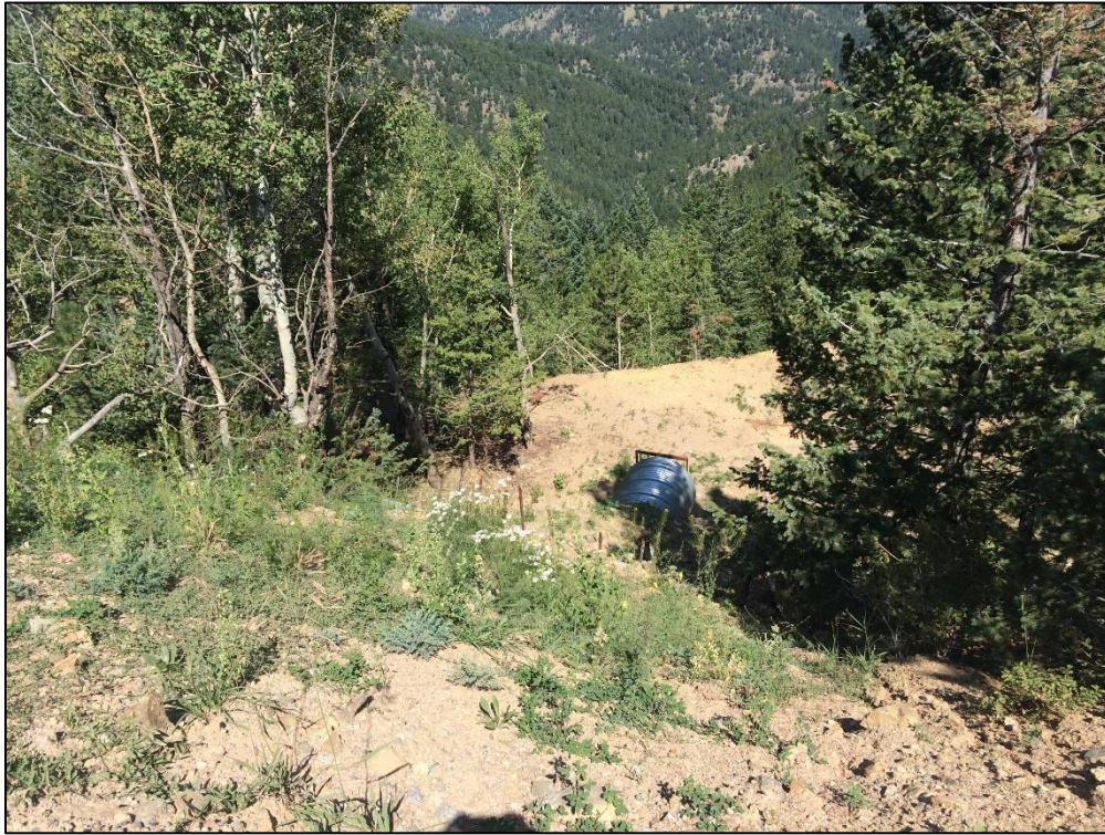
Photo 1. View looking down from northern edge of Sunshine Canyon Drive at Times Mine subsidence area. Culvert extending from portal visible below.