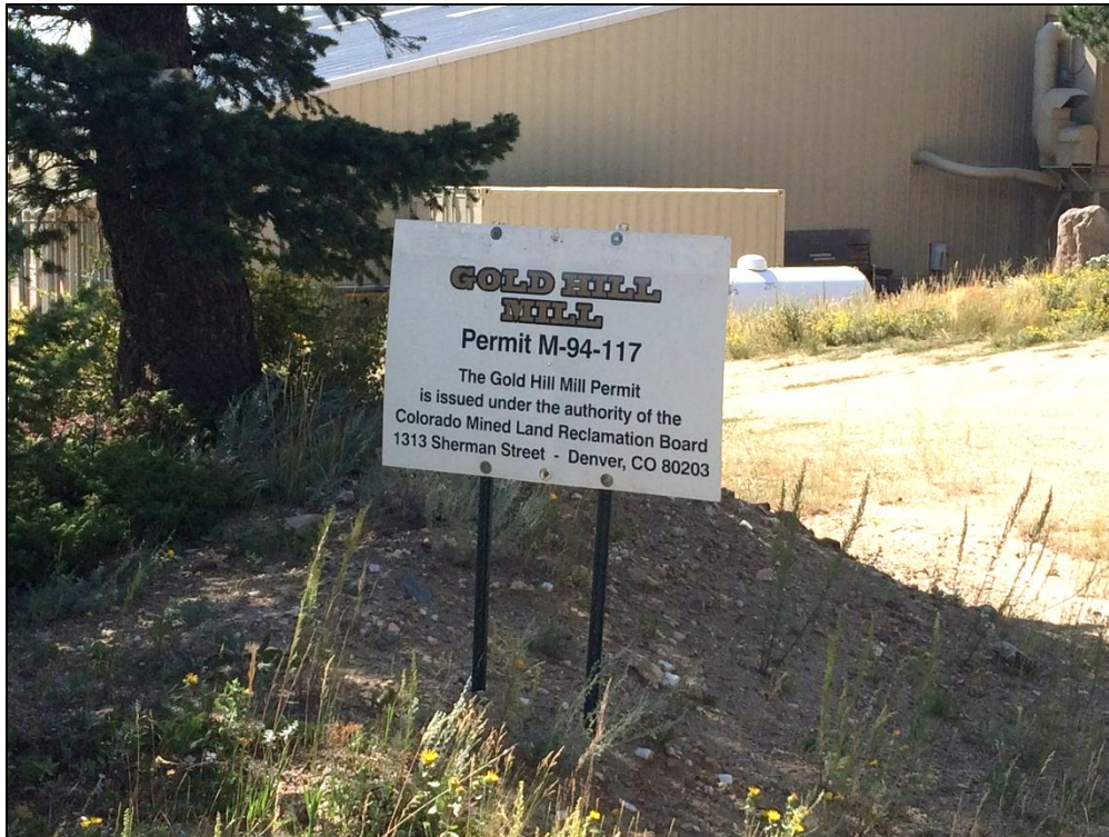
Photo 9. View of permit sign for Gold Hill Mill posted at mine entrance.