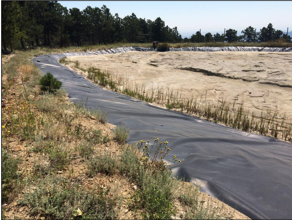
Photo 13. View looking across northeastern corner of tailings impoundment, showing an available freeboard of at least two feet (as required).