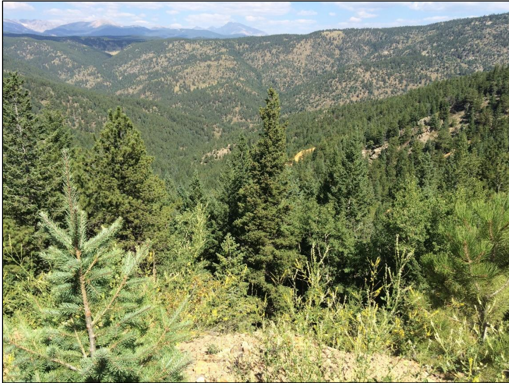
Photo 7. View looking down Lick Skillet Gulch where operator proposes installing a new water pipeline to convey water from Left Hand Creek to the mill.