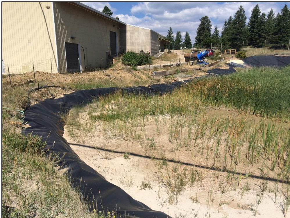
Photo 10. View looking across southwestern corner of tailings impoundment, showing an available freeboard of at least two feet (as required).