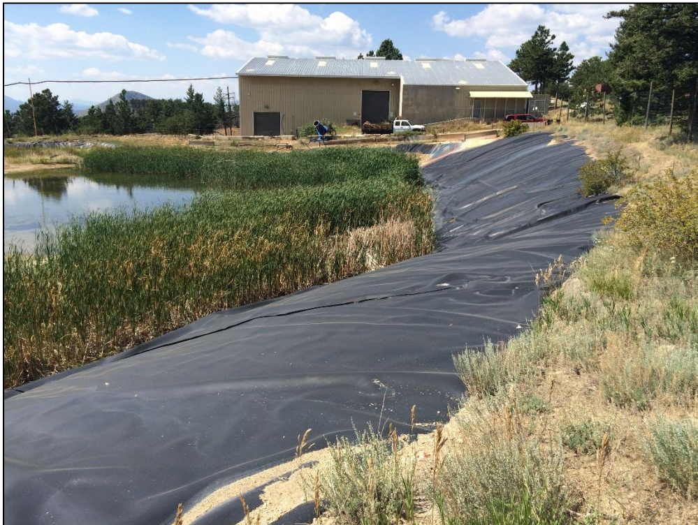
Photo 14. View looking across northern edge of tailings impoundment, showing an available freeboard of at least two feet (as required).