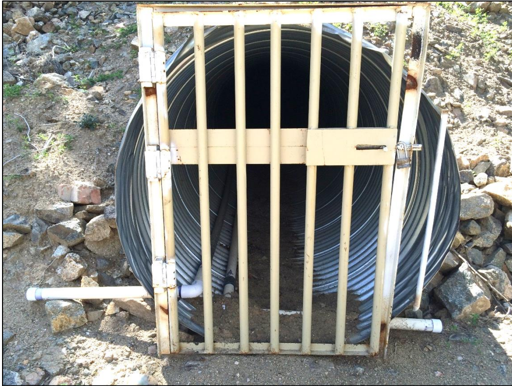
Photo 5. Closer view of Times Mine adit, showing portal secured by locked metal gate. Note two disconnected pipelines extending from adit.