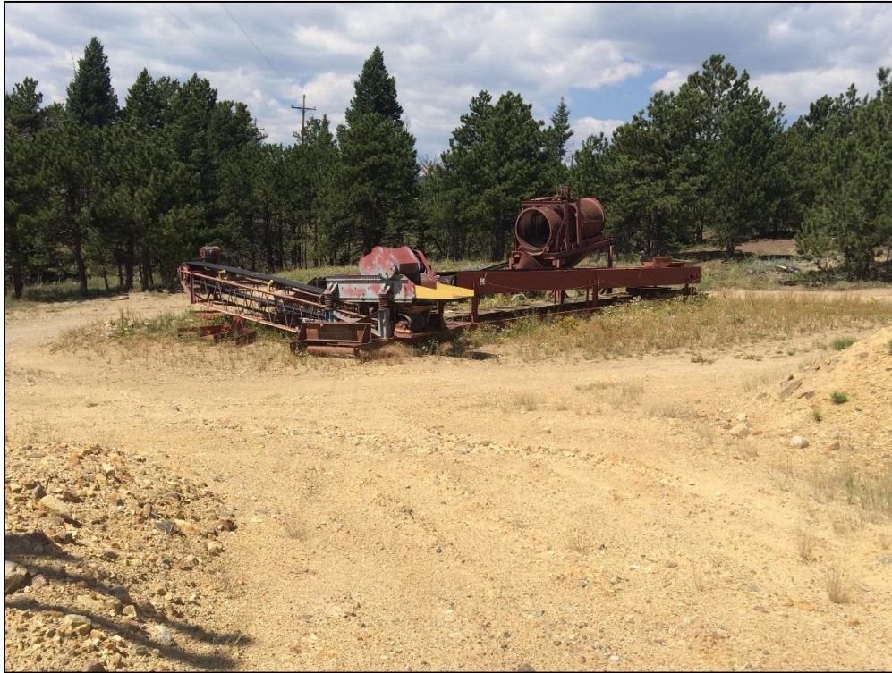
Photo 19. View looking across equipment storage area located southwest of ore stockpile. This area is within the approved permit area.