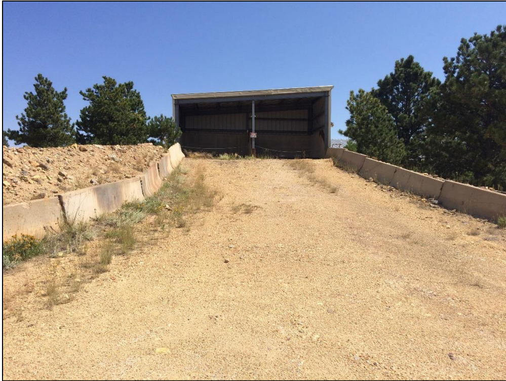
Photo 15. View looking up at two coarse ore bins located at top of ramp (on ore stockpile) at southwestern edge of mill building.