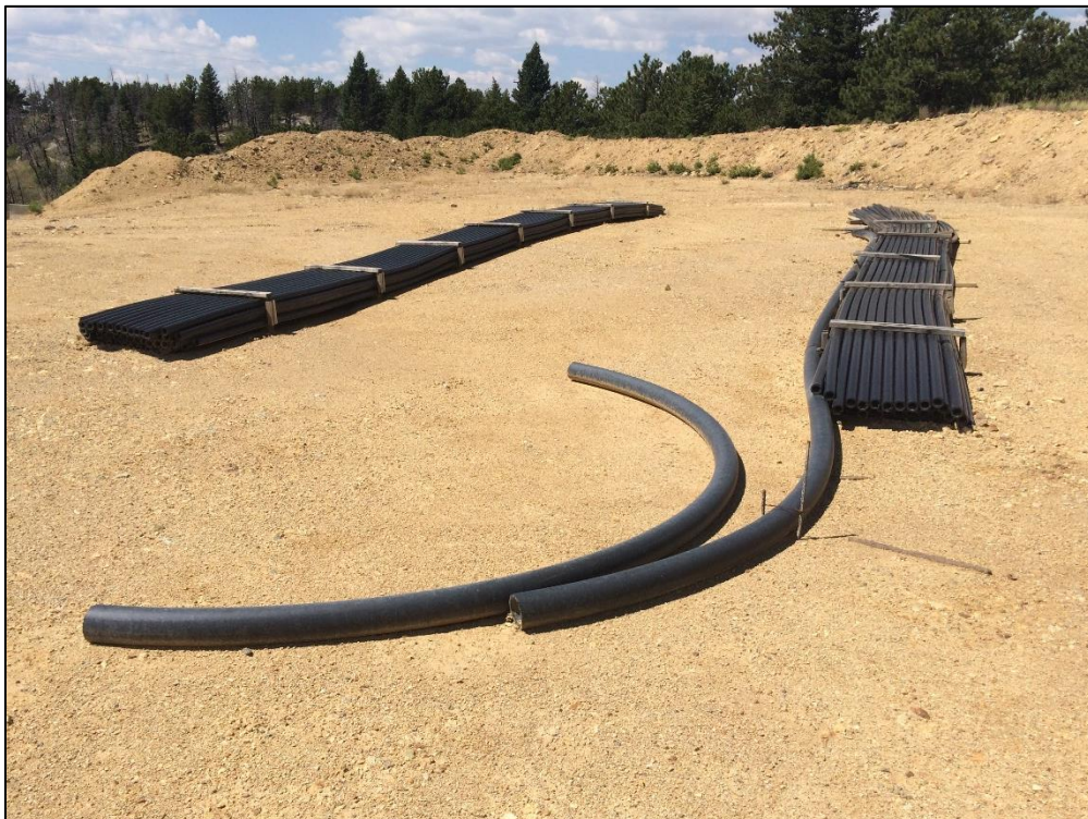
Photo 8. View of two-inch HDPE pipe currently stored on top of ore stockpile. This pipe is intended to replace the existing pipeline present in Lick Skillet Gulch to convey water pumped from Left Hand Creek to the mill.