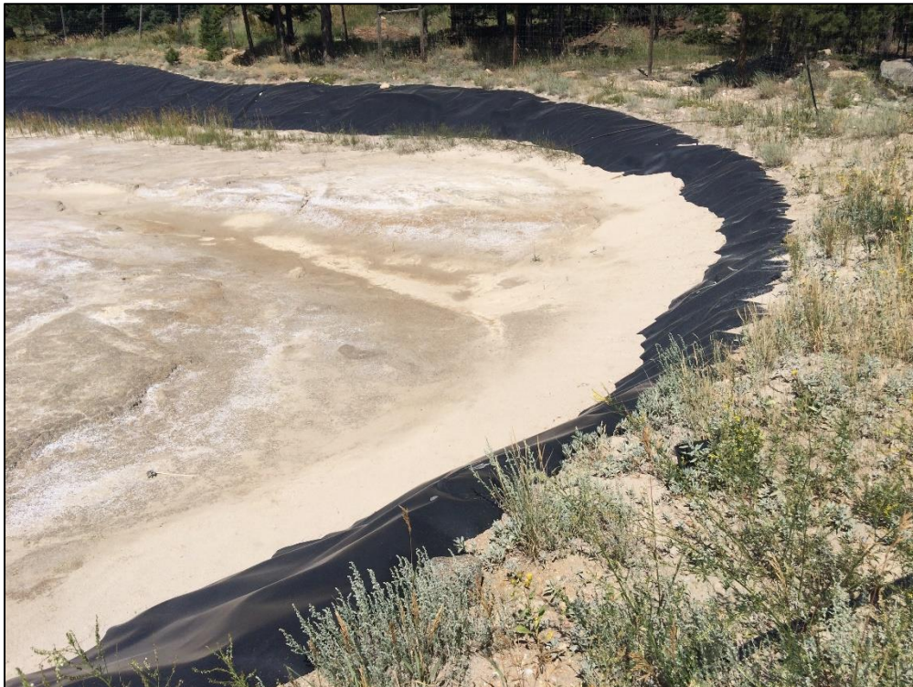
Photo 12. View looking across southeastern corner of tailings impoundment, showing an available freeboard of at least two feet (as required).