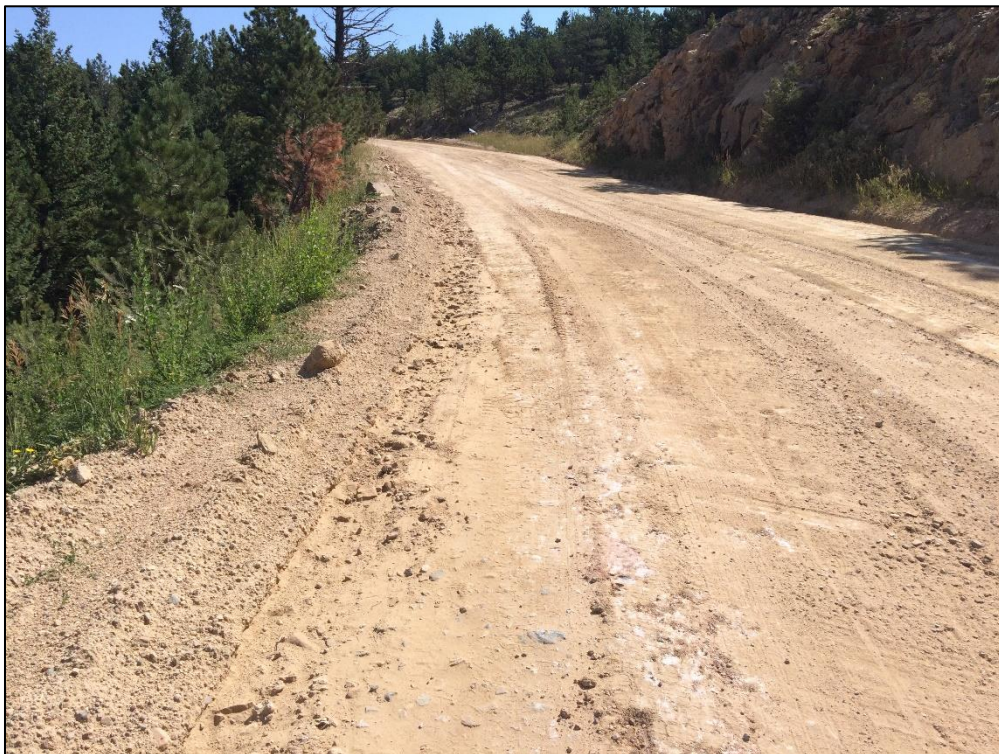
Photo 2. View looking east down Sunshine Canyon Drive (above Times Mine subsidence area), showing road in good condition at time of inspection.