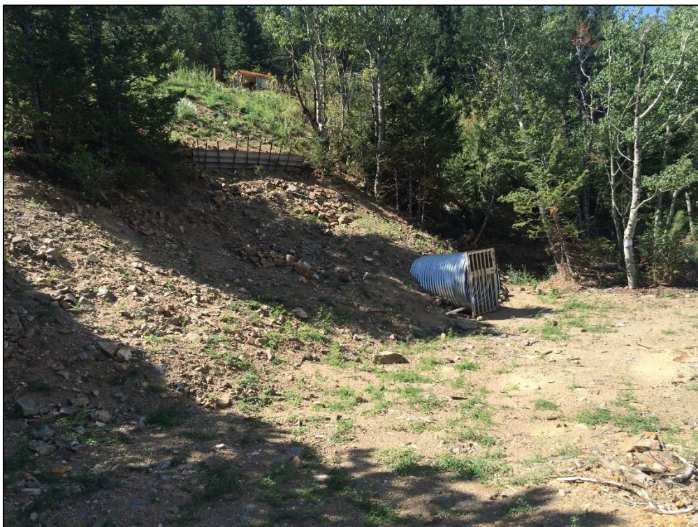
Photo 4. View of Times Mine adit located approximately 50 feet below Sunshine Canyon Drive. Fill area above adit appeared to be stable.