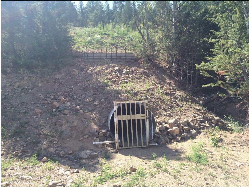
Photo 3. View of Times Mine adit located approximately 50 feet below Sunshine Canyon Drive. Fill area above adit appeared to be stable. Portal was secured by locked metal gate.