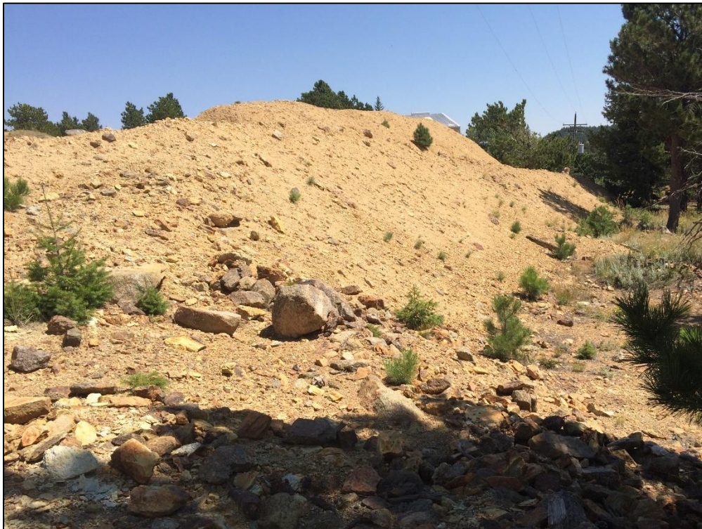
Photo 18. View looking east from access road, showing southern side of ore stockpile. The stockpile slopes appeared to be stable.