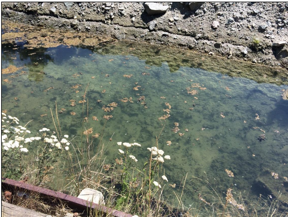
Photo 2. Closer view of water held in pond (shown in Photo 1). Note blue-green color of water possibly indicating elevated aluminum concentrations.