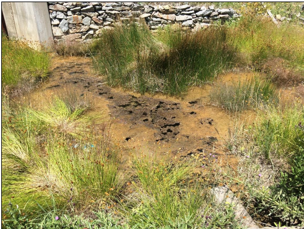
Photo 4. Closer view of water draining from Mount Royale No. 1 adit. Note orange staining of ground where drainage occurs.