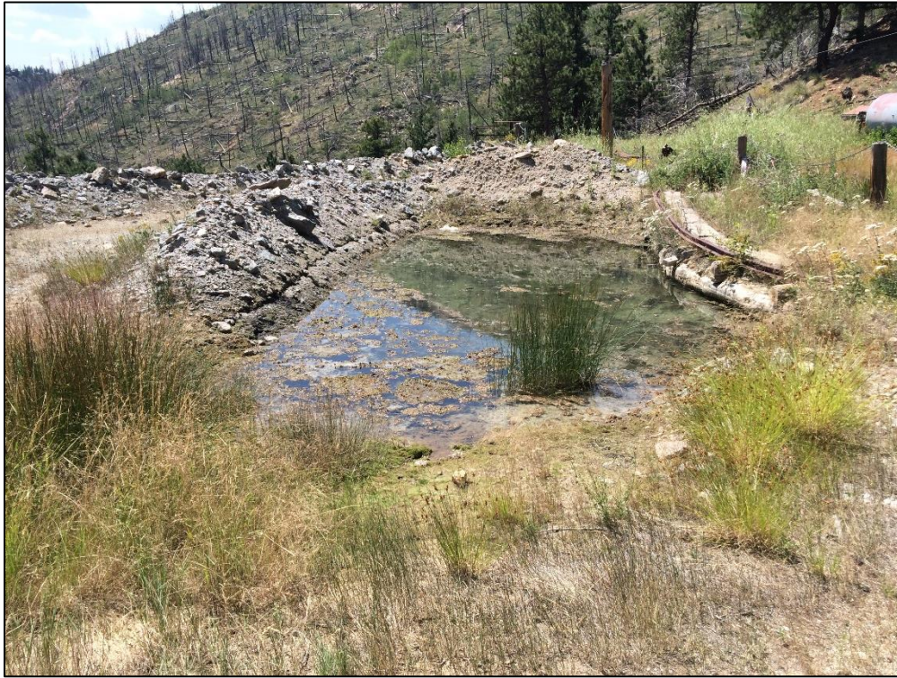
Photo 1. View looking southwest at small sediment pond located on top of waste rock pile, just below the Mount Royale No. 1 Adit. Note pond was partially full of water during inspection.