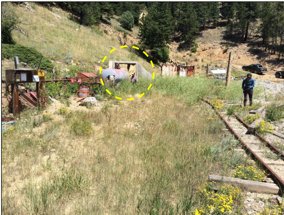
Photo 6. View looking northeast across Mount Royale Adit area. Adit is circled in background.