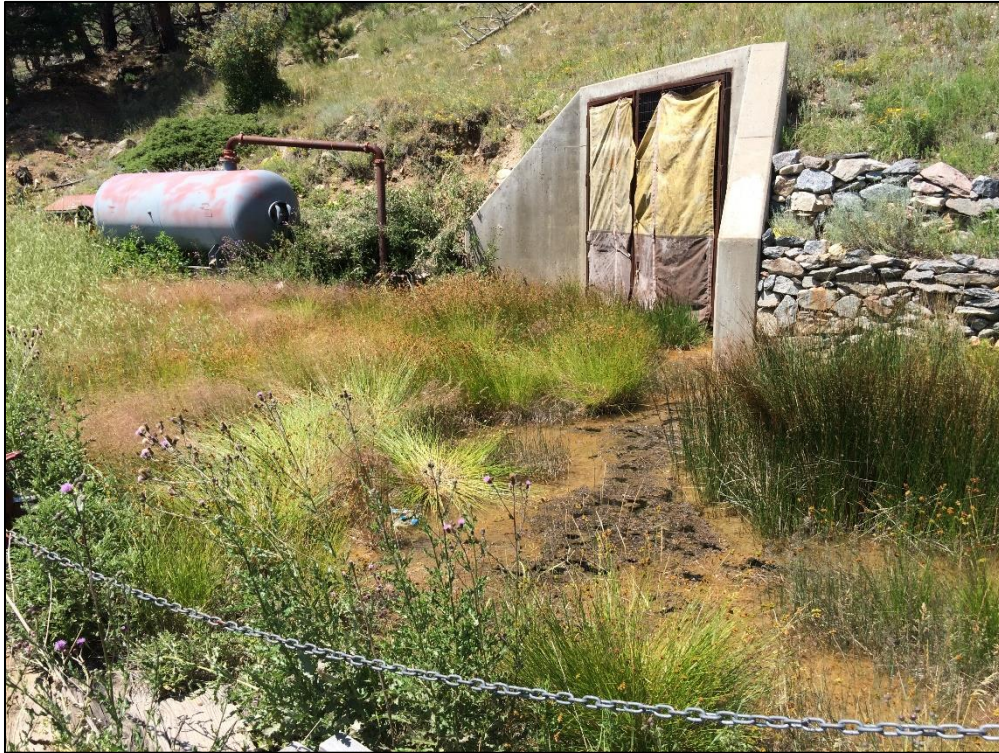
Photo 3. View looking west from edge of sediment pond showing water draining from Mount Royale No. 1 adit toward pond. Note orange staining of ground where drainage occurs.