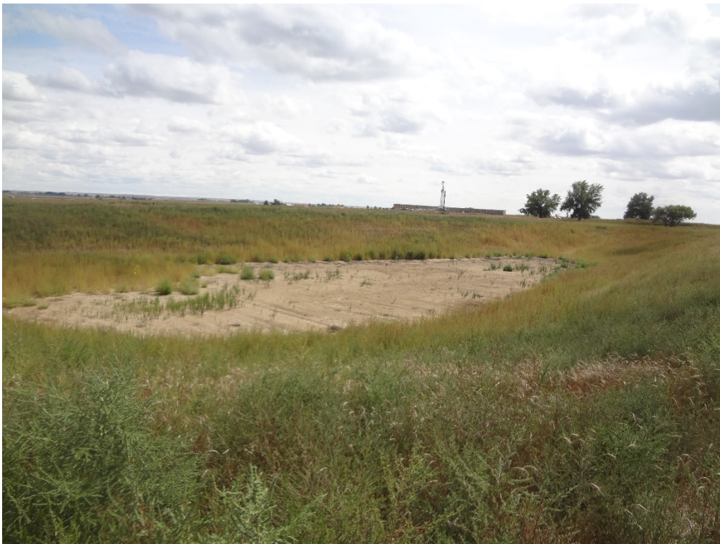
View of pit from the NW corner looking southeast