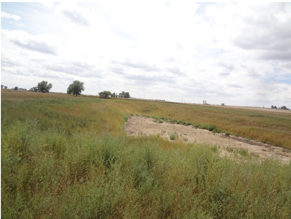
View of pit from the NE corner looking south