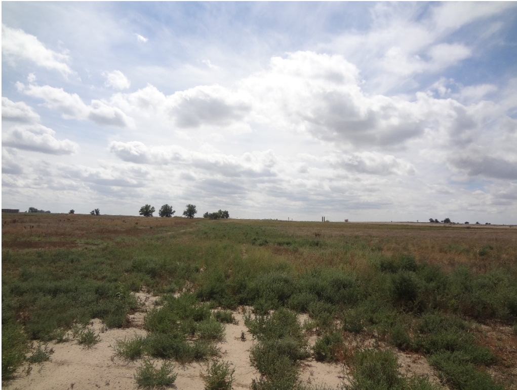
View of access road vegetation from WCR 50