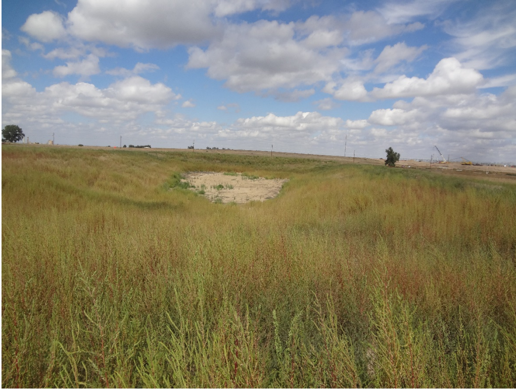
View of pit from the south side of the pit looking north