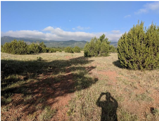
Road to NW-MW.

The reclaimed substation pad is well vegetated.