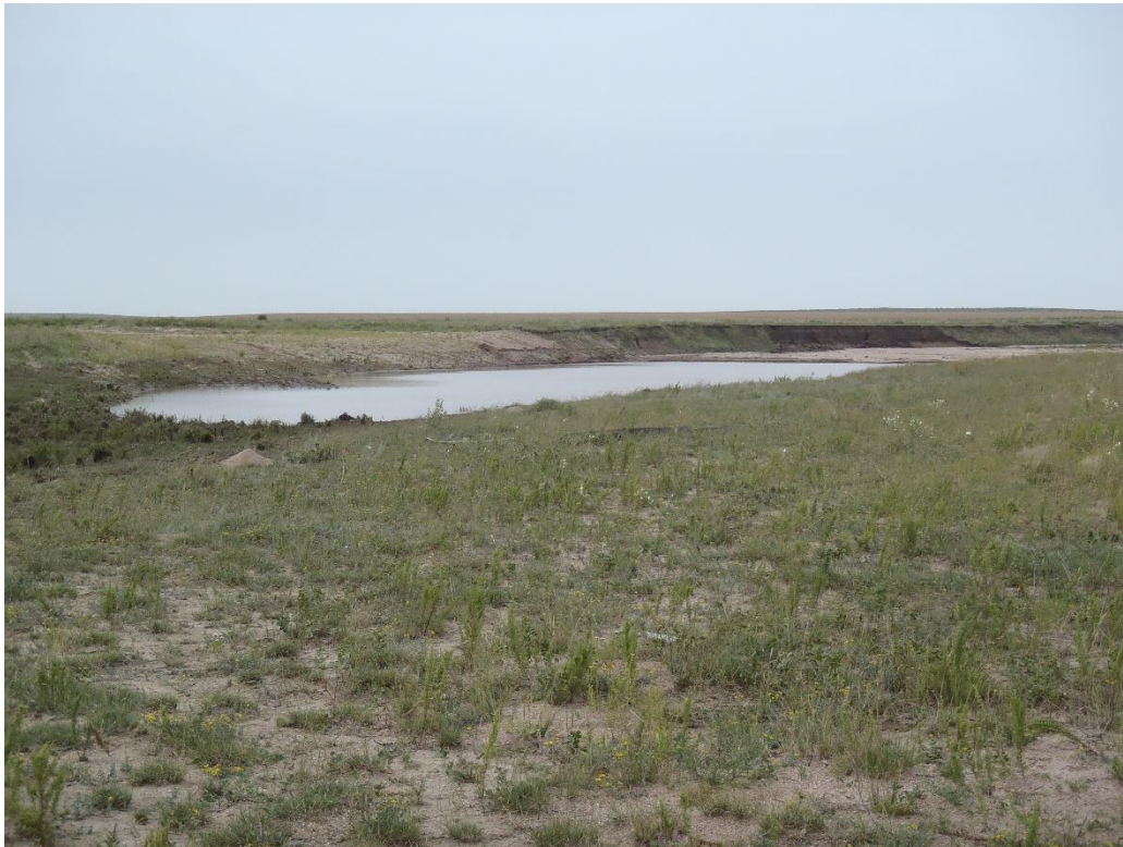
Photo 1. Standing water observed in Arikaree River bottom.