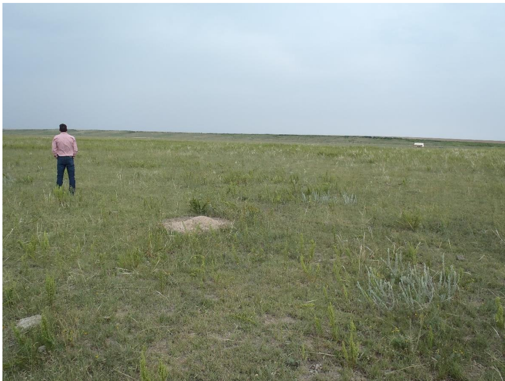
Photo 2. View of area requested for release (from SE corner post – looking NNW).