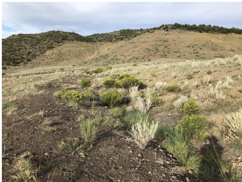
Ditch D73, looking downstream (west)