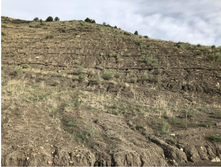
Hill above Pond 6