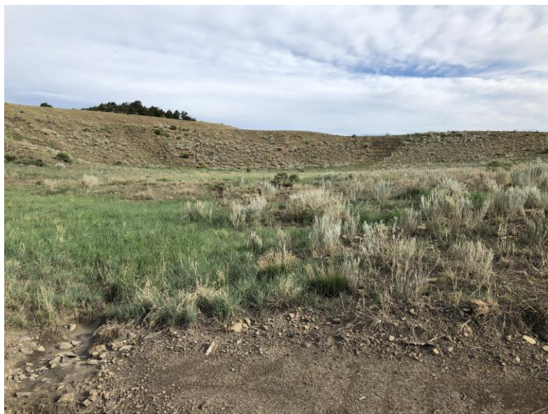
Area south of Culvert C5

Number of Partial Inspection this Fiscal Year: 1