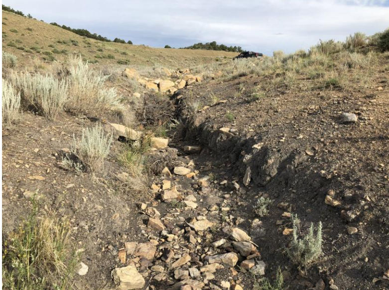
Branches for erosion control in Ditch D73 (top photo) and Ditch D9 (bottom)

Number of Partial Inspection this Fiscal Year: 1