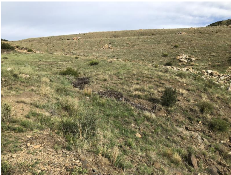
Fill 7 in background and erosion control branches near middle of photo

Number of Partial Inspection this Fiscal Year: 1