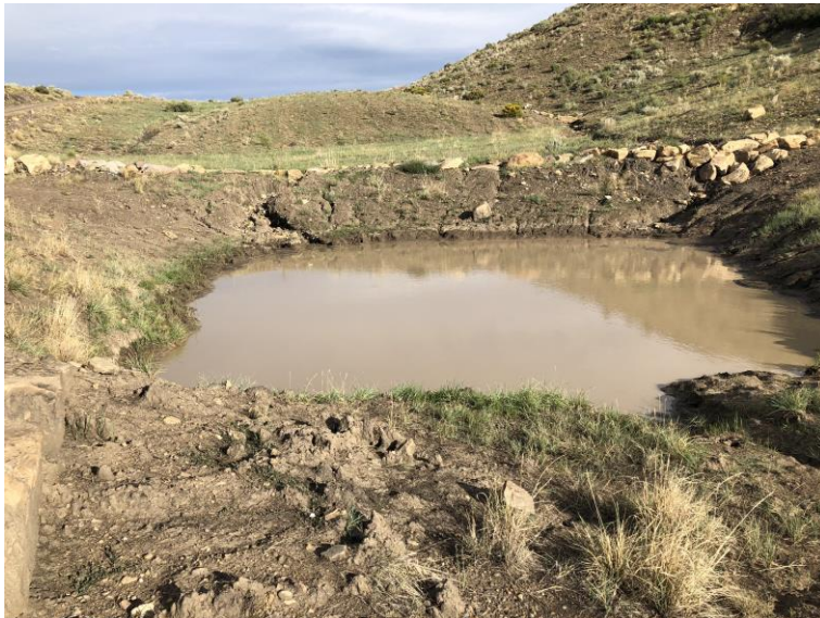
Sump at upper end of Culvert C4

Number of Partial Inspection this Fiscal Year: 1