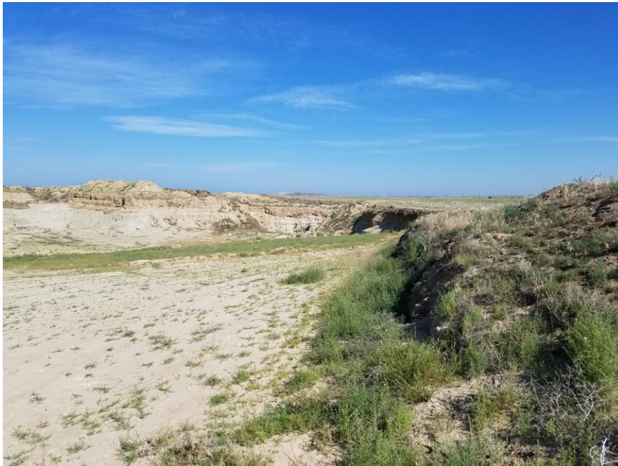
Figure 6. From the east side of the active mine area looking northwest.