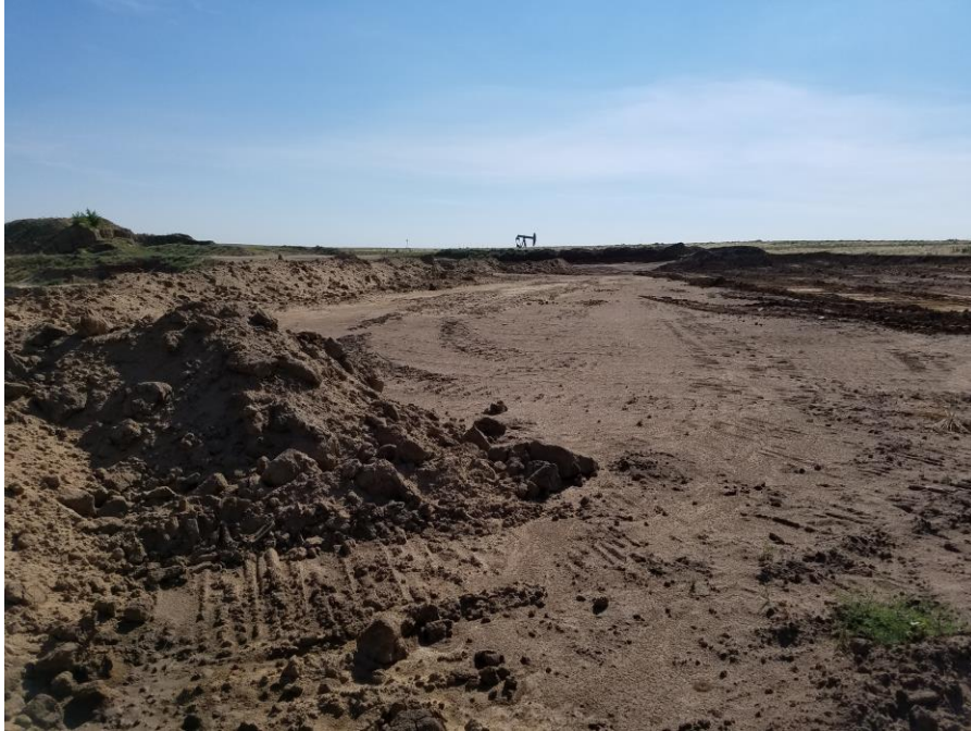
Figure 3. Area stripped of topsoil at the southeast corner of the active mine area.