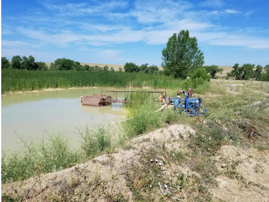
Figure 9. Last cell in the series of sediment ponds. Water pumped back up to the processing facilities.