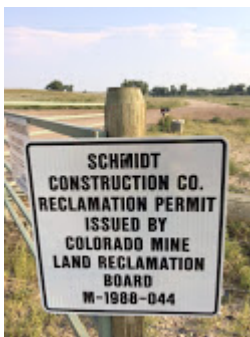
Coal Creek Reclamation #1.JPG