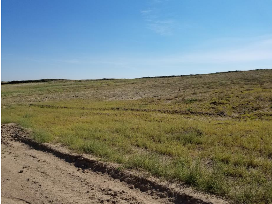
Figure 5. Backfilled and graded area on the east side of the active mine area.