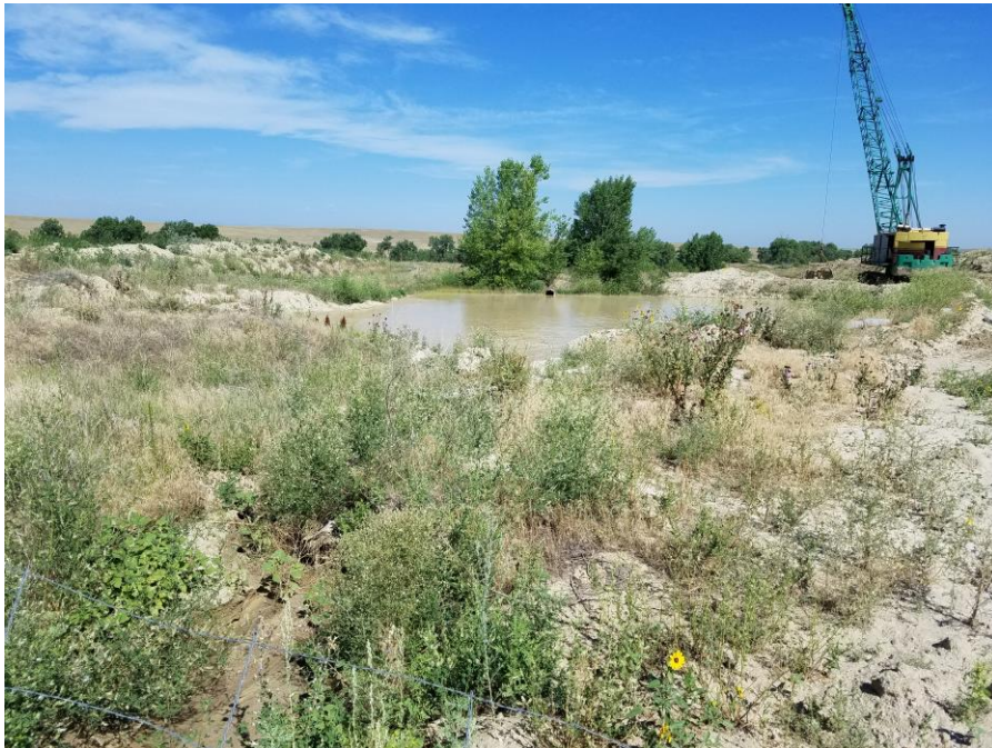
Figure 8. From the south end of the first cell of the sediment ponds west of the processing area.