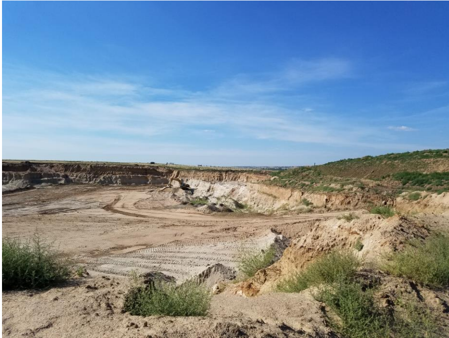
Figure 1. From the north end of the active mine area looking south.