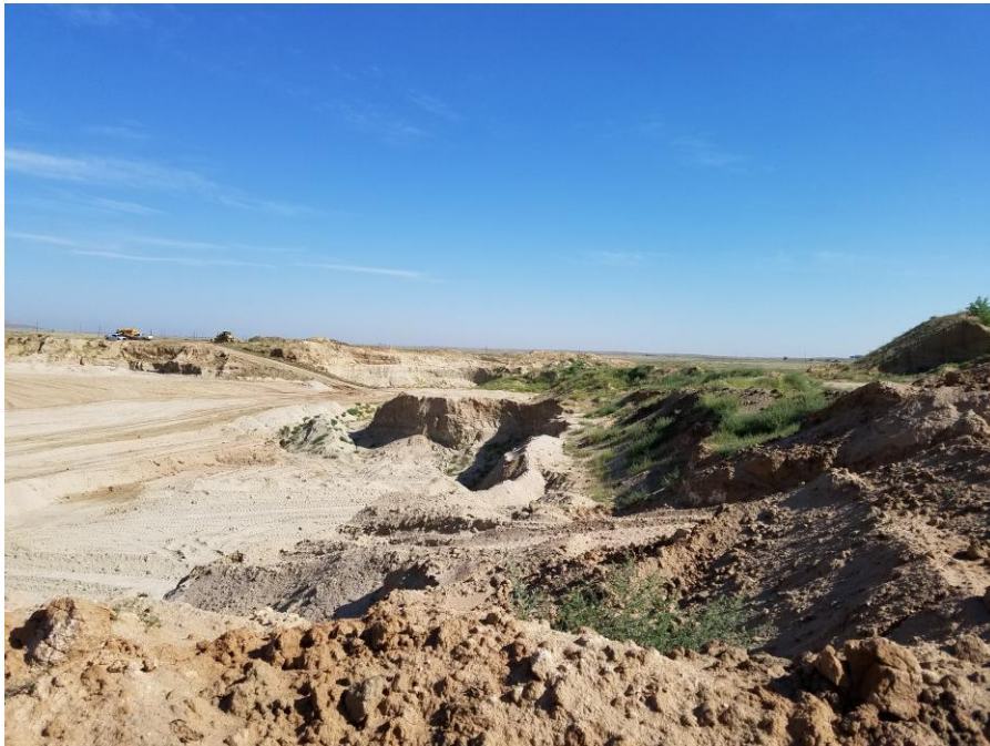
Figure 4. From the southeast corner of the active mine area looking north.