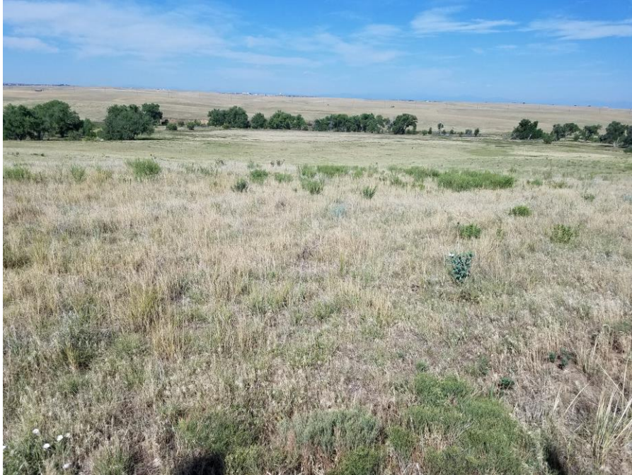
Figure 7. From the east end of the 2014 reclaimed area looking west.