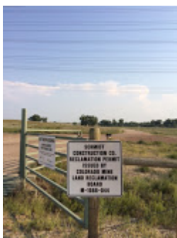
Coal Creek Reclamation Sign #2.JPG