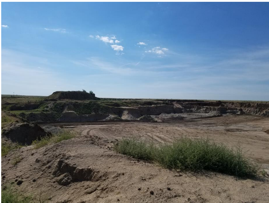
Figure 2. From the north end of the active mine area looking southeast.