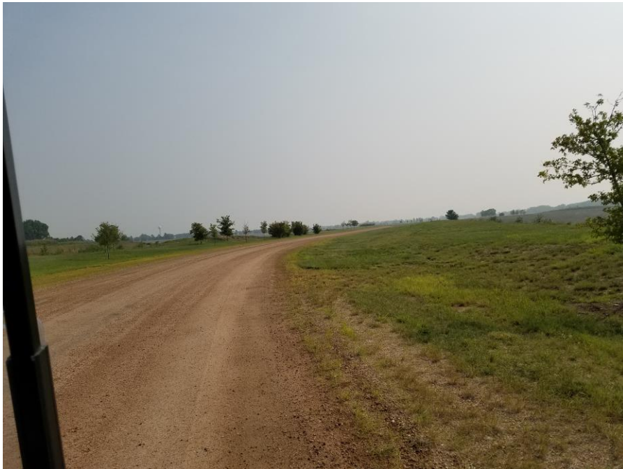
Figure 4. From the south end of the bond release area looking north.