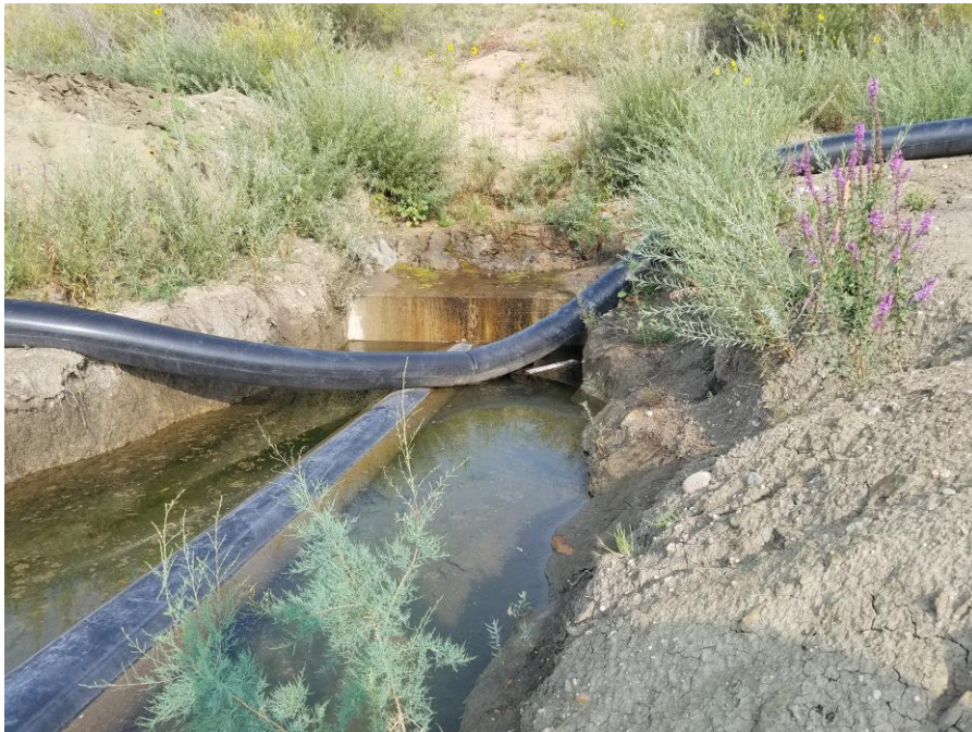
Figure 2. Piped interconnect between Lake 2 and Lake 1. Photo of the Lake 1 side.