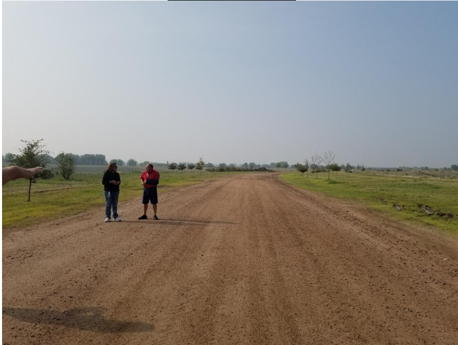
Figure 1. From the entrance to the site on 124th Ave looking south.