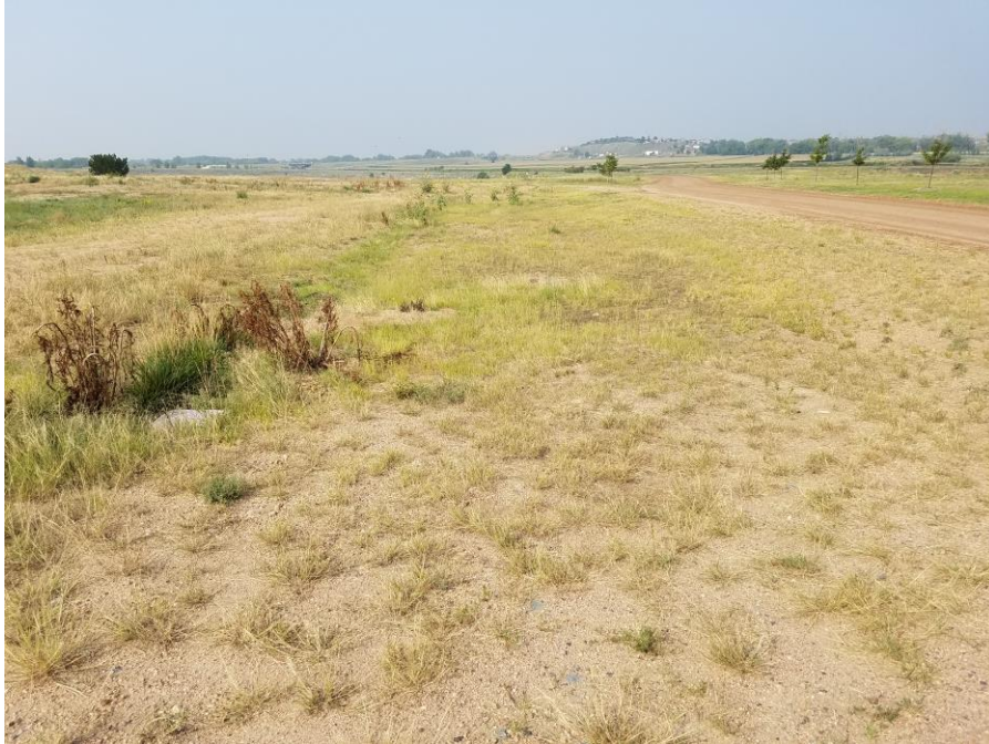
Figure 3. Future parking area portion of the release area from the north side looking south.