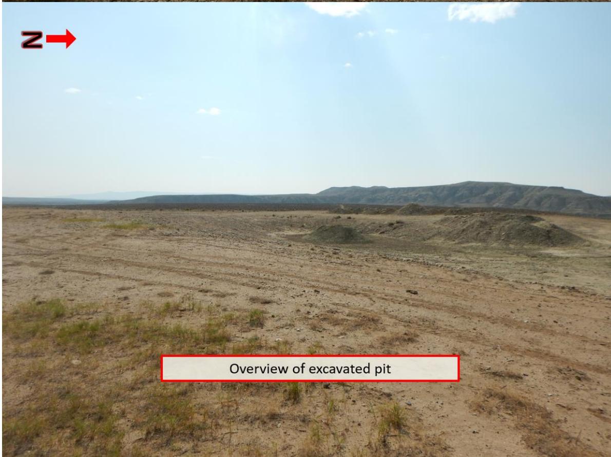
Overview of excavated pit