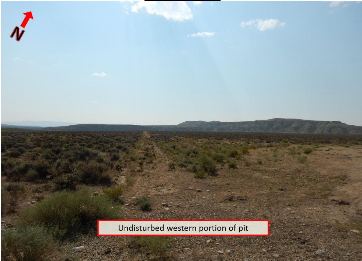
Undisturbed western portion of pit