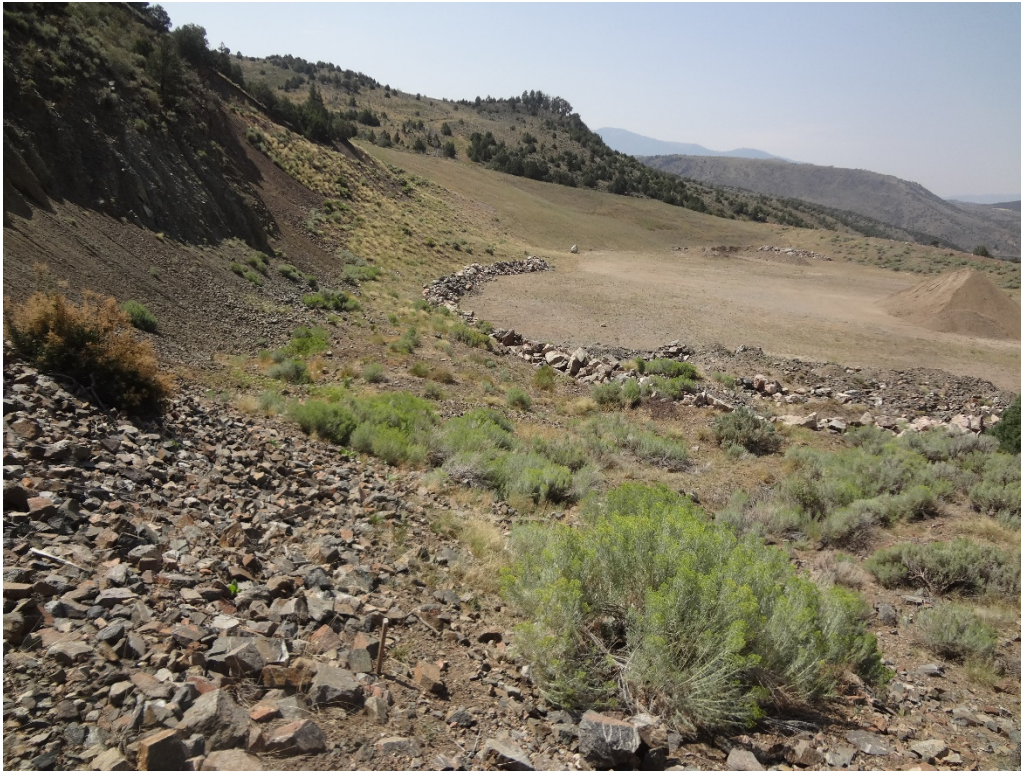
View of current site from SE amendment corner looking south