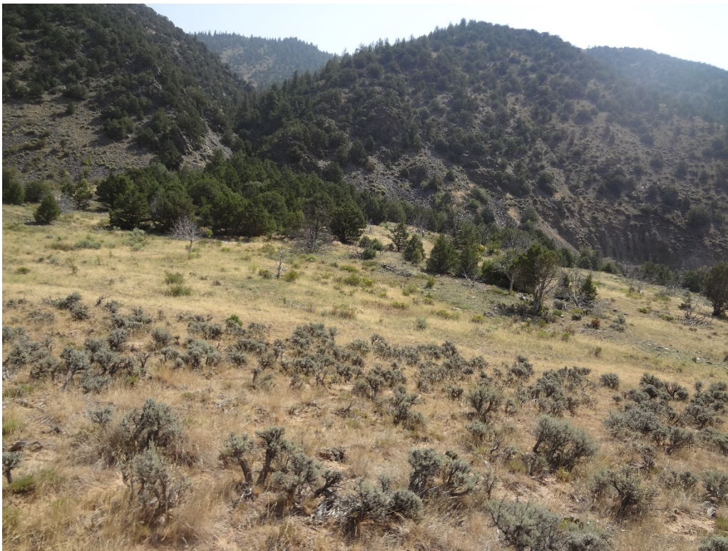
View of amendment area from the SW corner looking east