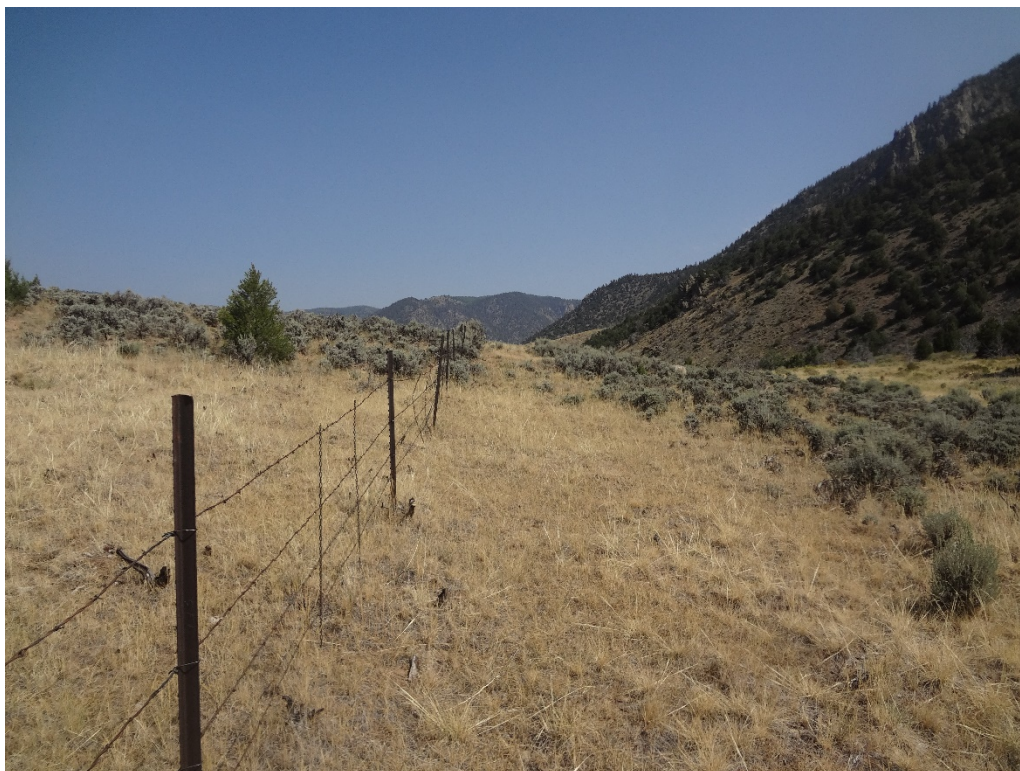
View of amendment area from the SW corner looking north