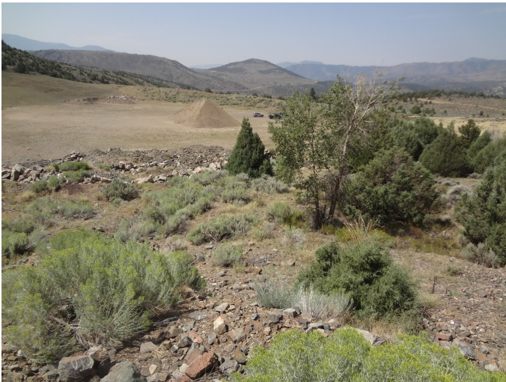
View of current site from SE amendment corner looking SW