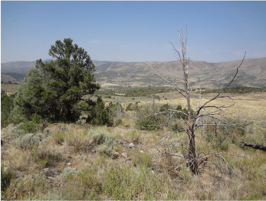
View of amendment area from the NE corner looking west