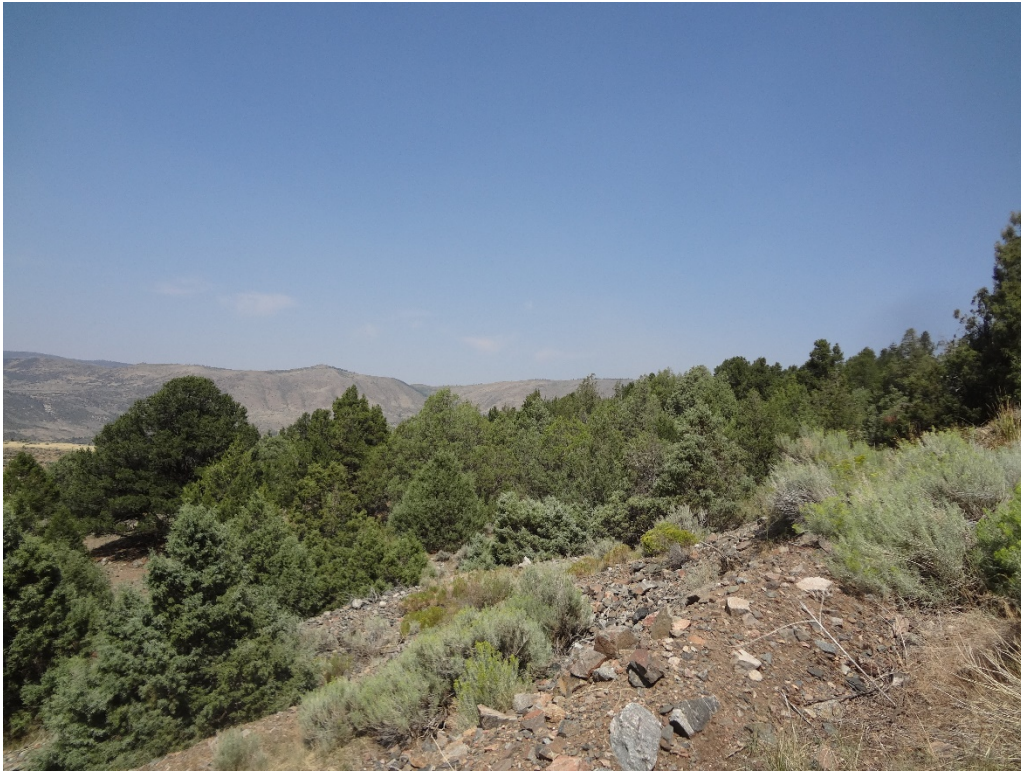
View of amendment area from the SE corner looking NW