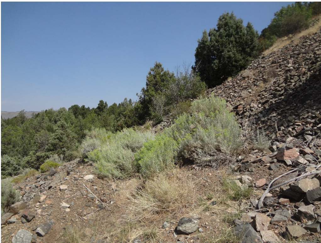
View of amendment area from the SE corner looking north