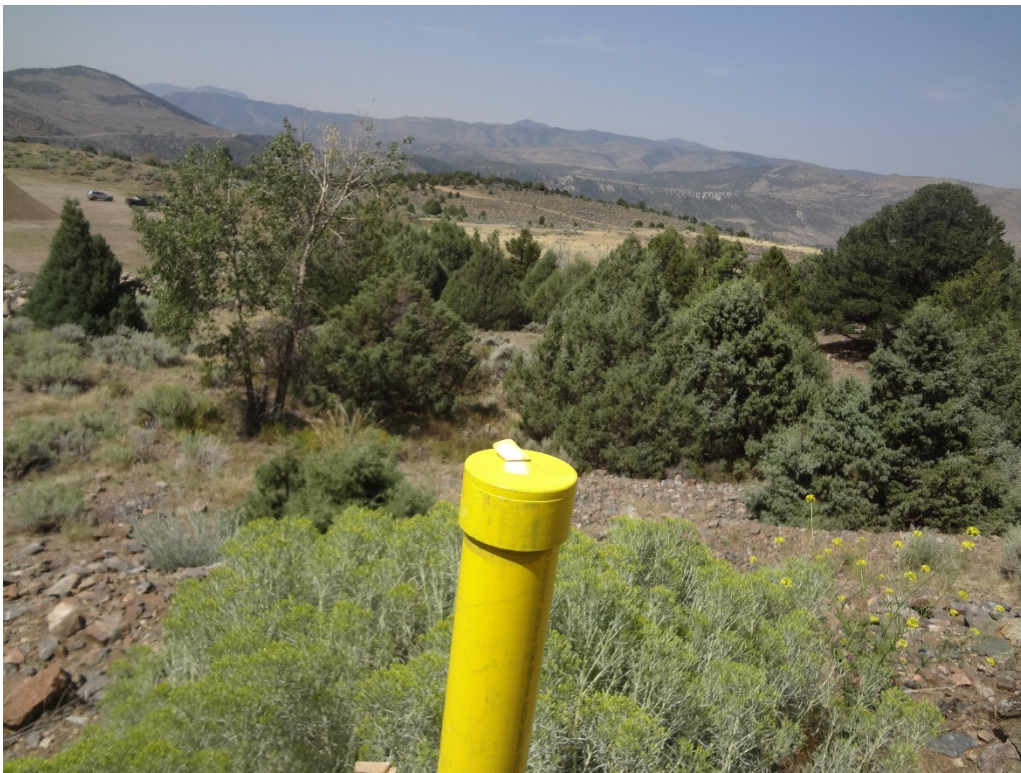
View of amendment area from the SE corner looking west