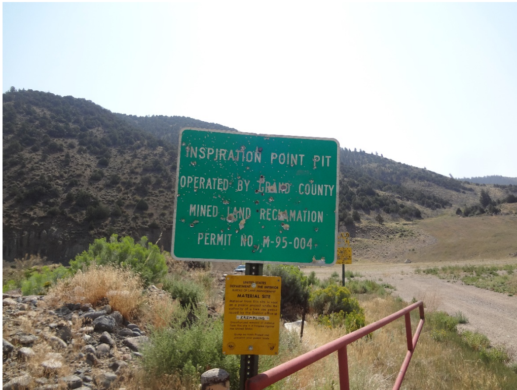
Inspiration Point mine sign