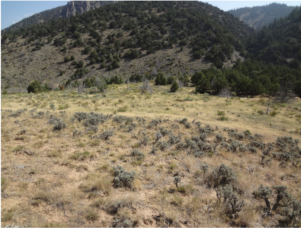
View of amendment area from the SW corner looking NE