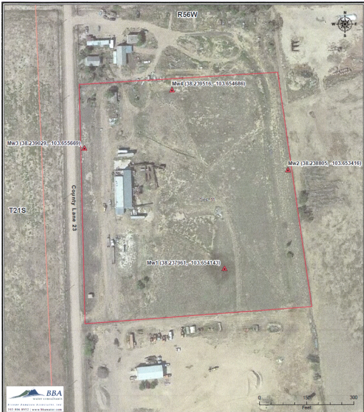
Figure 1 Mount Falcon Processing, LLC Sugar City Mill Site Map and Proposed Monitoring Point Locations Date: 1/8/2017 | Job No. 1632.00