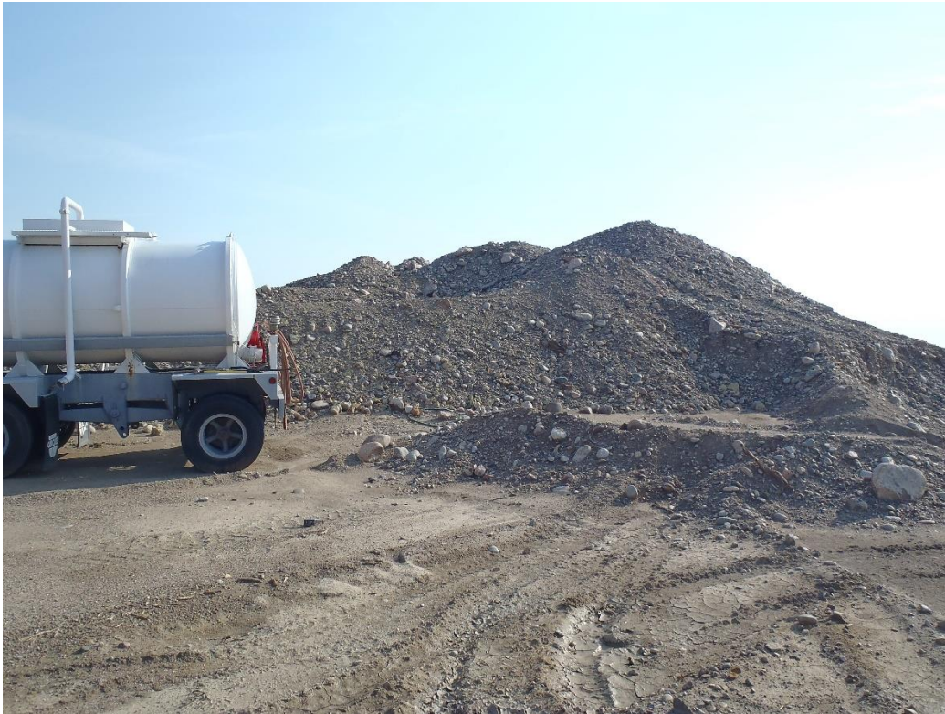
Photo 1. Unsorted/unscreened pile from 2005 complaint.