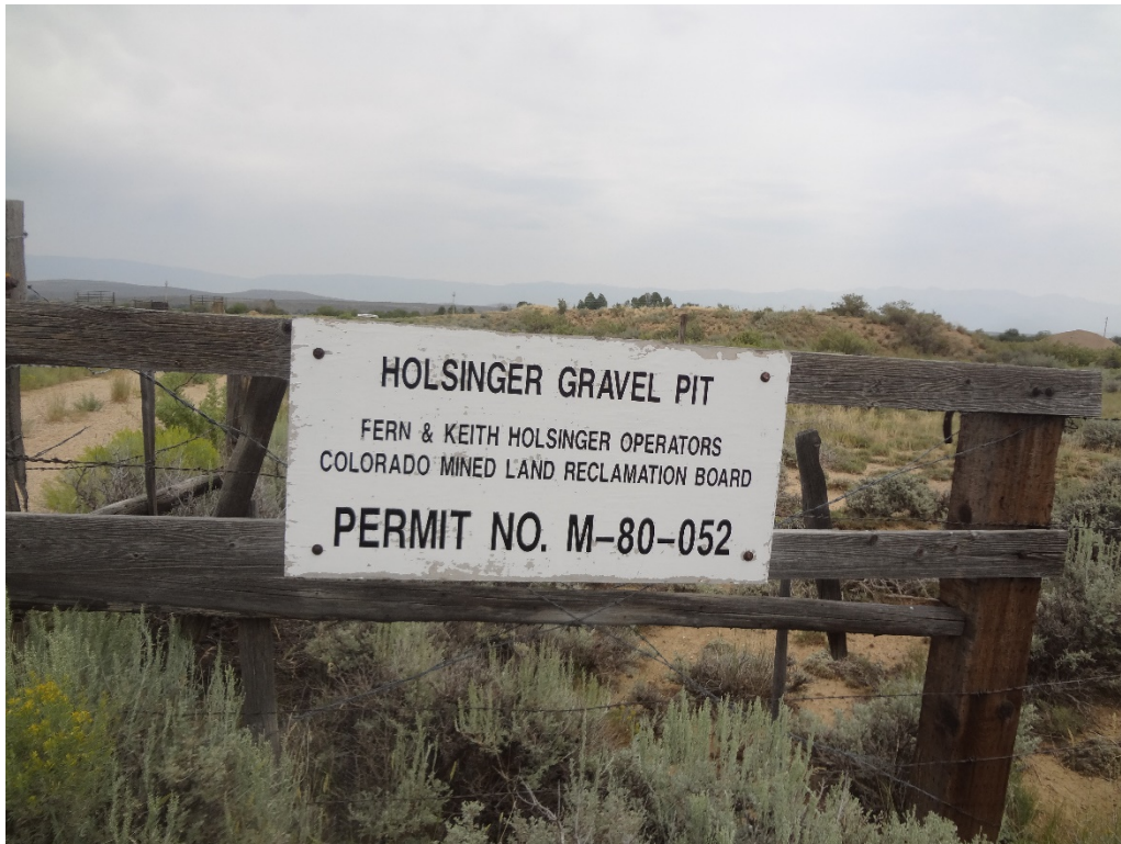
Holsinger Gravel Pit mine sign