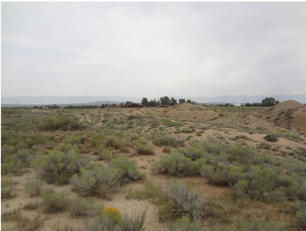
View of the site from the southeast corner looking NW