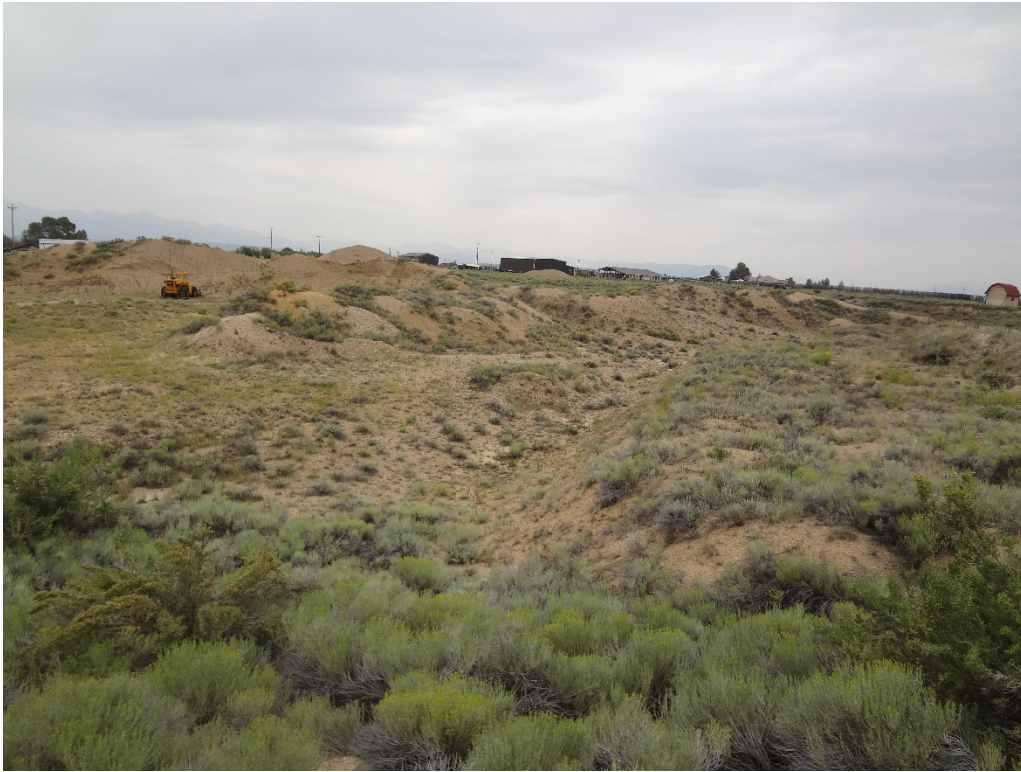
View of pit from the north end of the topsoil stockpile looking east