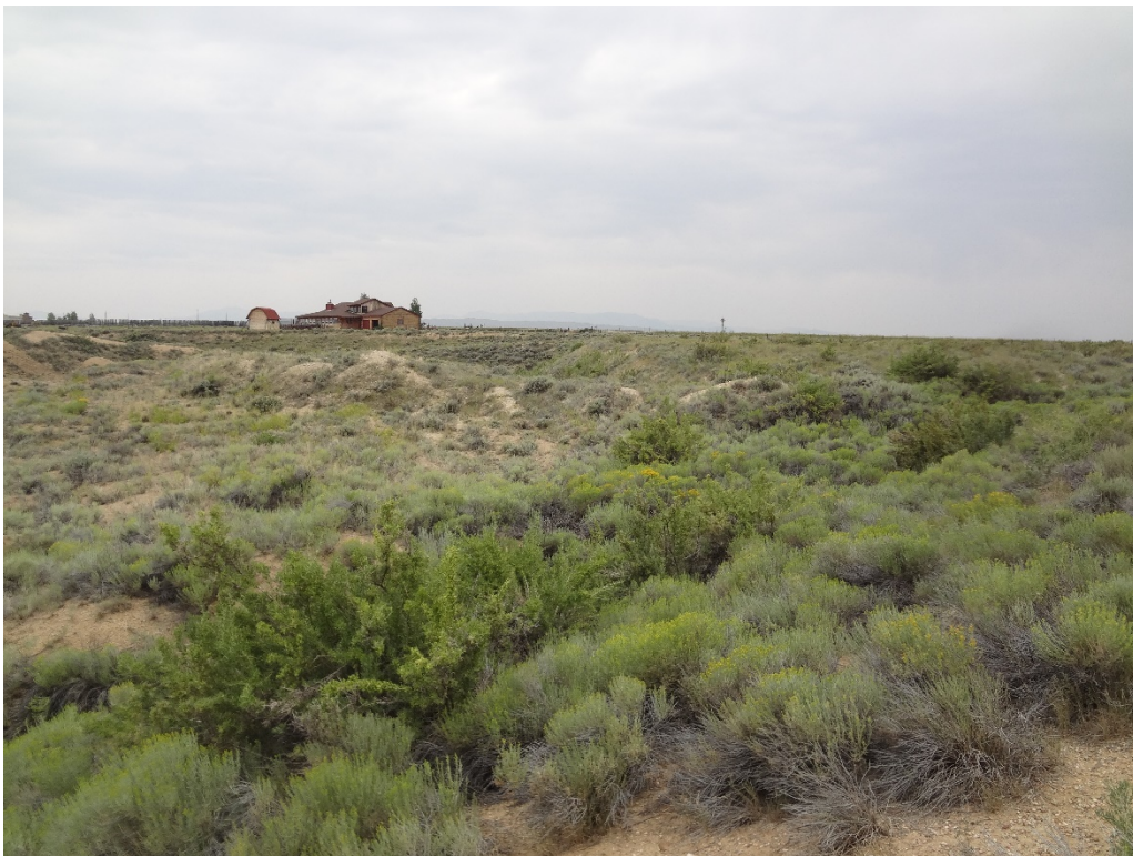
View of pit from the north end of the topsoil stockpile looking SE