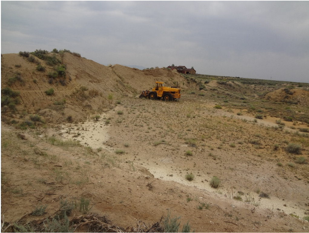
View of pit and highwall from north end of pit looking south