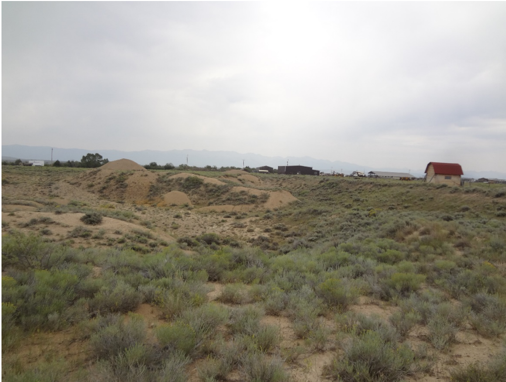
View of the site from the southeast corner looking north