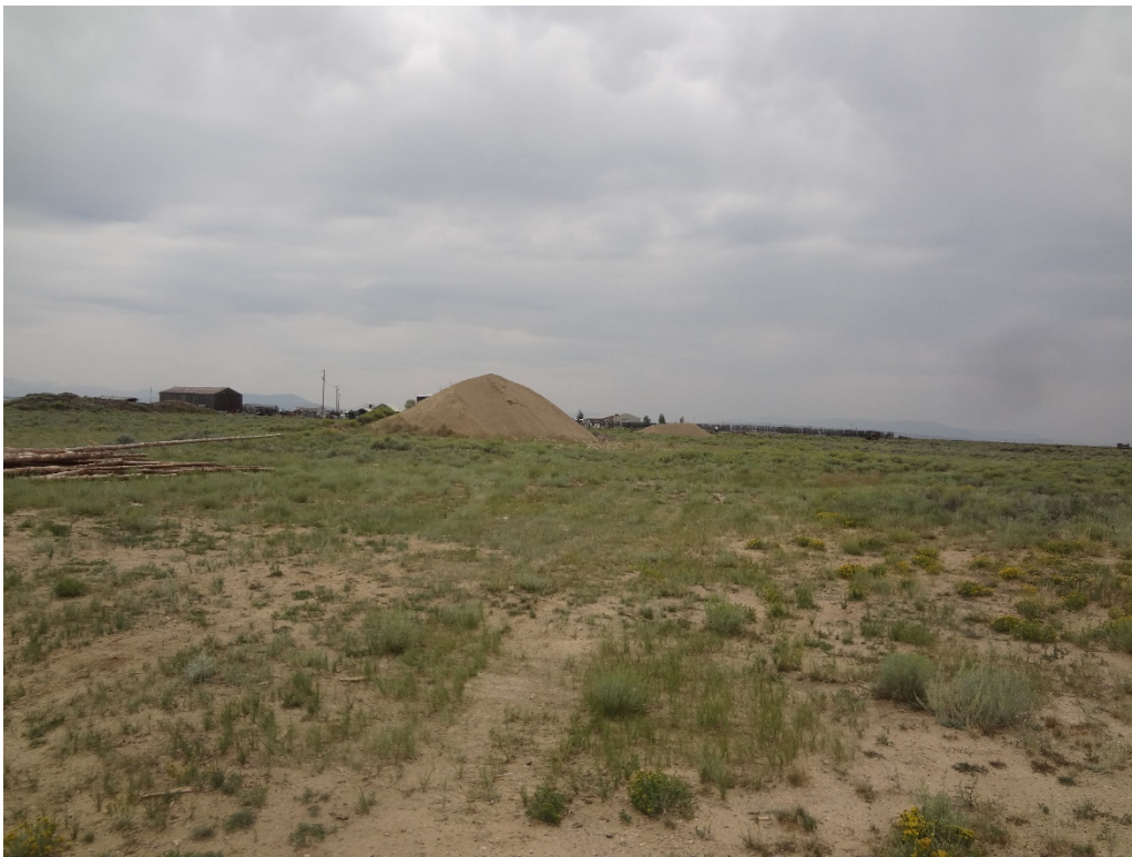
View of stockpiles east of the pit