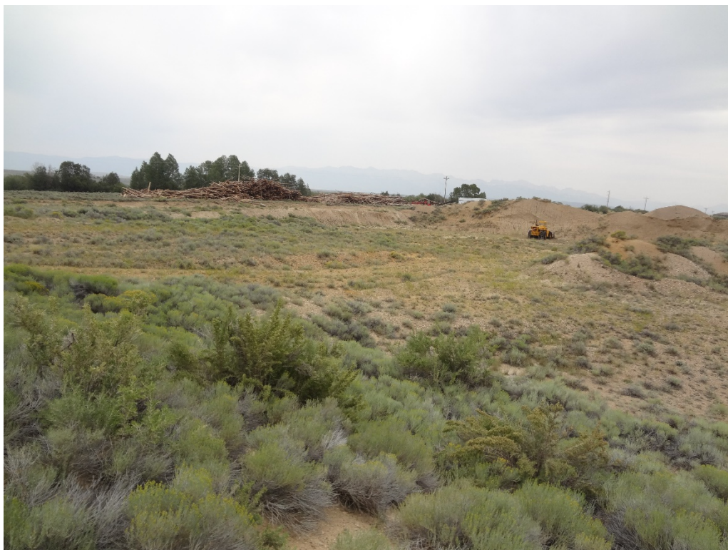
View of pit from the north end of the topsoil stockpile looking NE