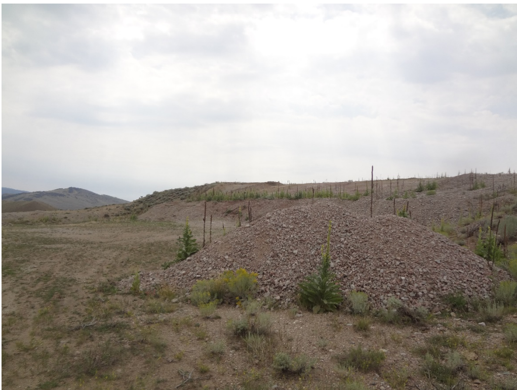
View of the site from the end of the access road looking SE at highwall and stockpile