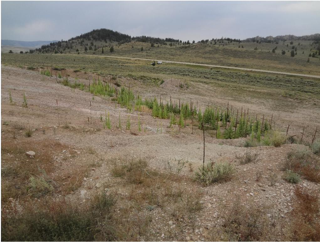
View of the site from the east side of the highwall looking NW at slope and pit floor