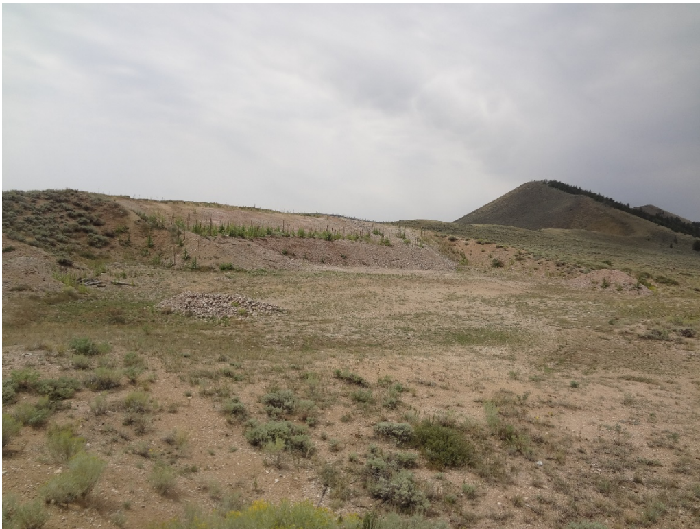
View of the site from the NE permit corner looking SW at slope and pit floor