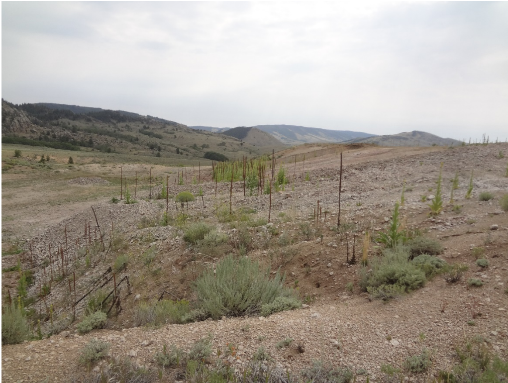
View of the site from the west of the pit looking west at slope and pit floor