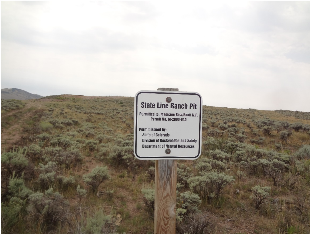
State Line Ranch Pit mine sign