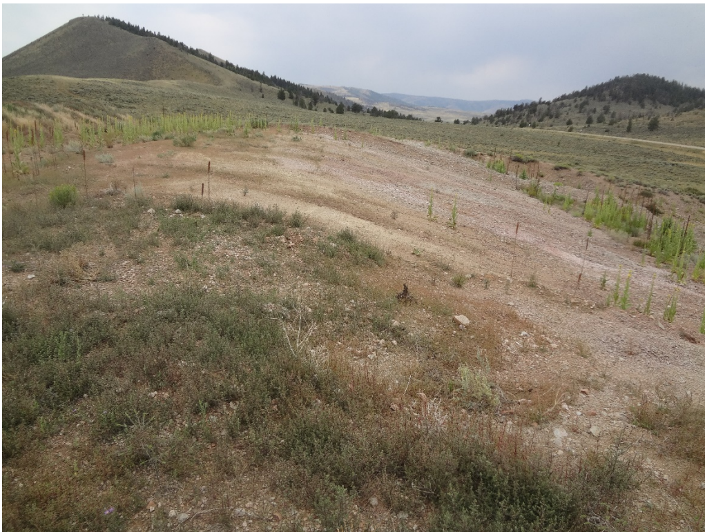
View of the site from the east side of the highwall looking west at slope