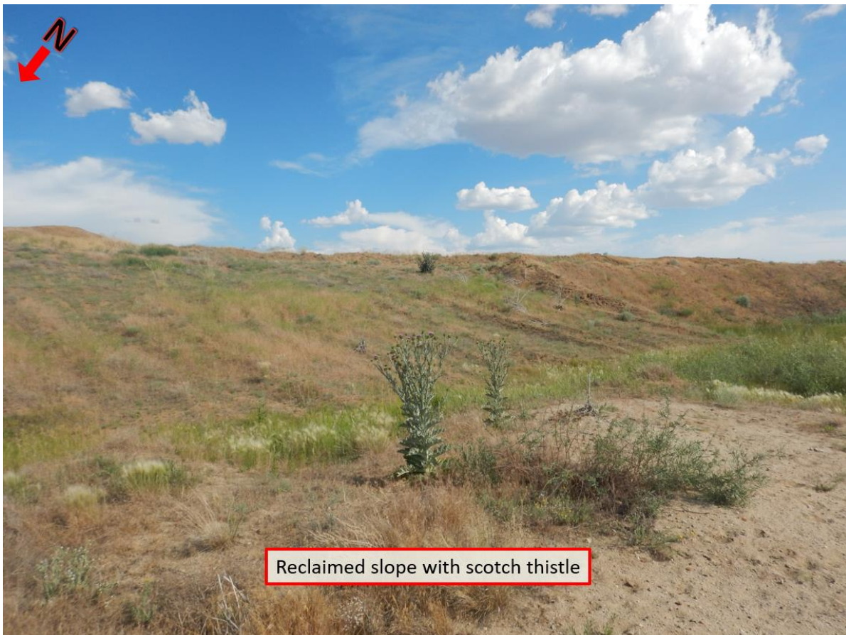
Reclaimed slope with scotch thistle