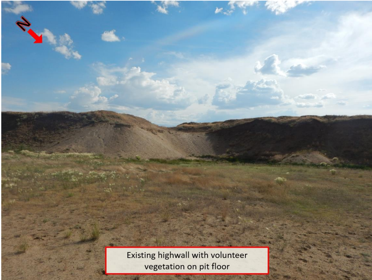
Existing highwall with volunteer vegetation on pit floor