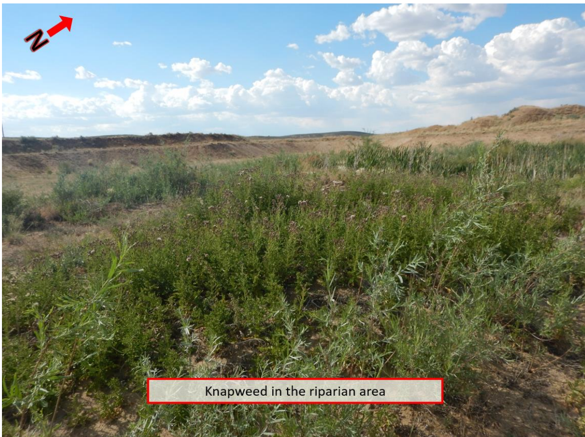
Knapweed in the riparian area