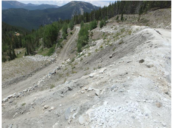
View from the stockpile bench