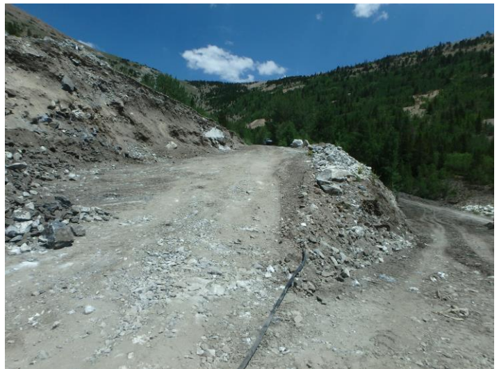
Current mining area