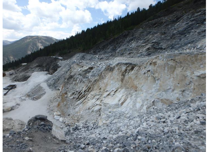
View from upper mine bench