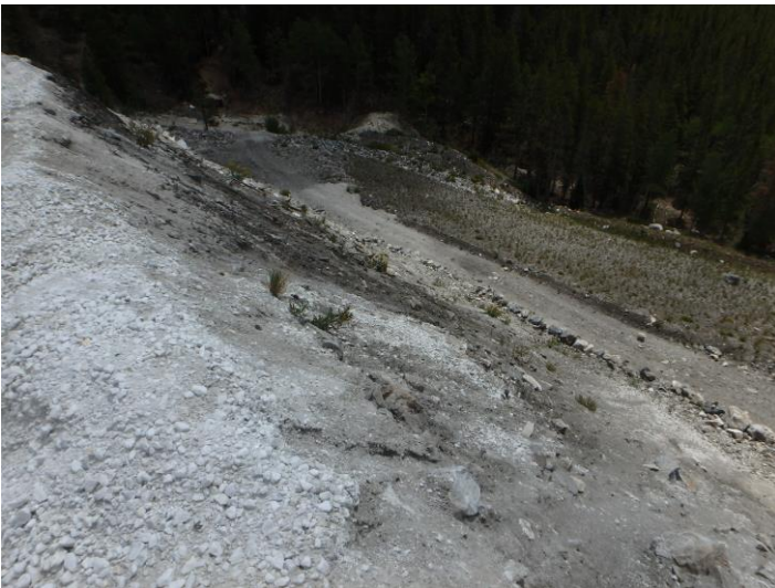
View from the stockpile bench