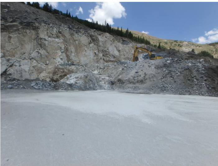
Current mining/operations area