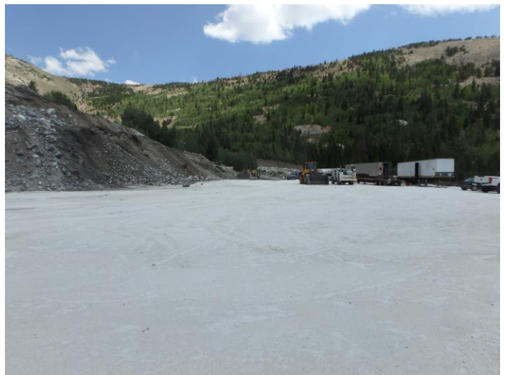
Current mining/operations area