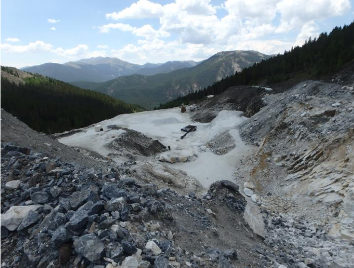
View from upper mine bench