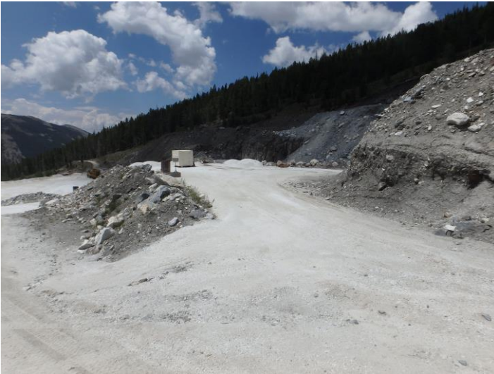
Explosives storage located on bench below active mining area