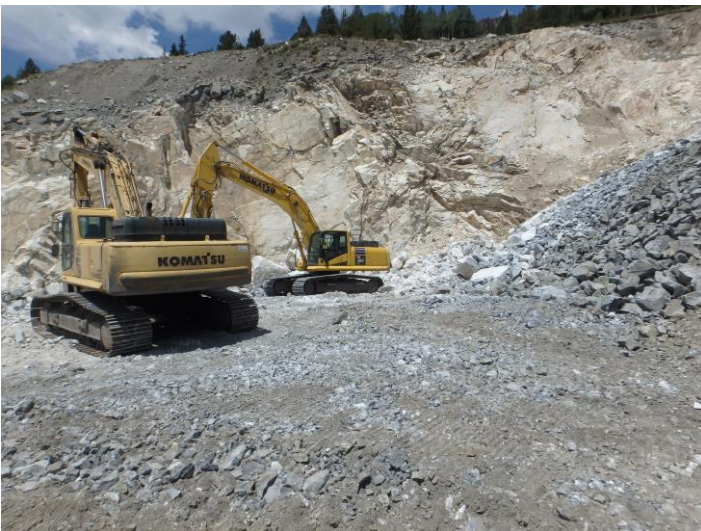
Current mining area