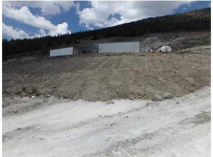
Slope below active operations bench