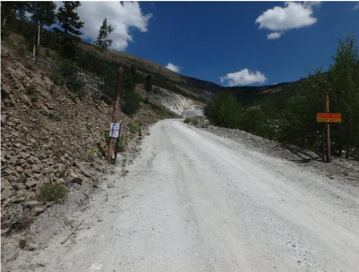
Adequate sign at mine entrance