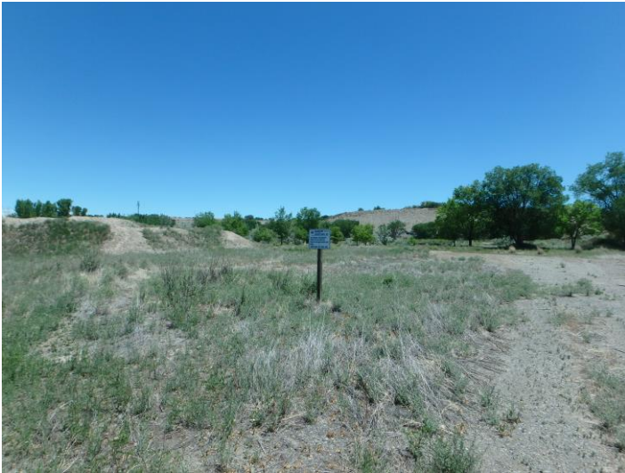
Mine ID at entrance and knapweed infestation.