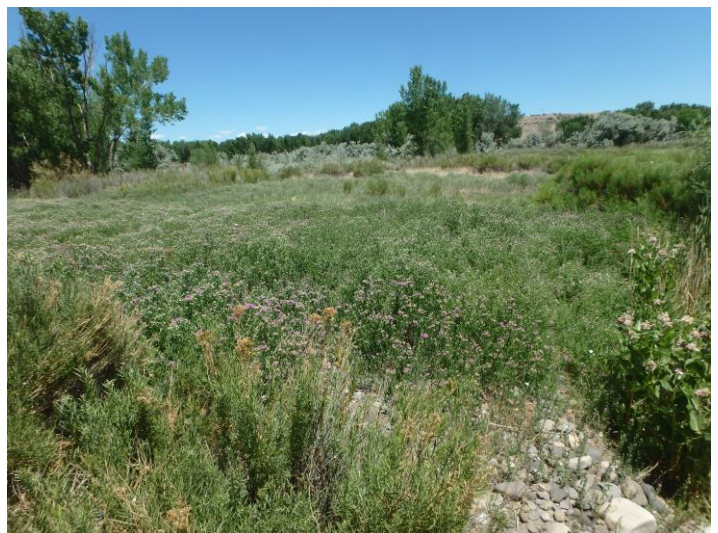
Knapweed infestation between ponds