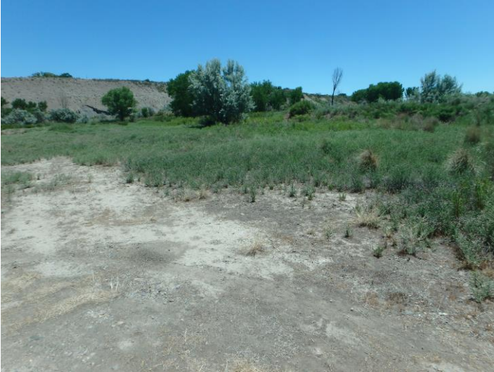
Knapweed infestation between ponds