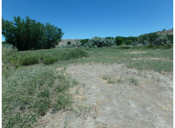
Knapweed infestation between ponds