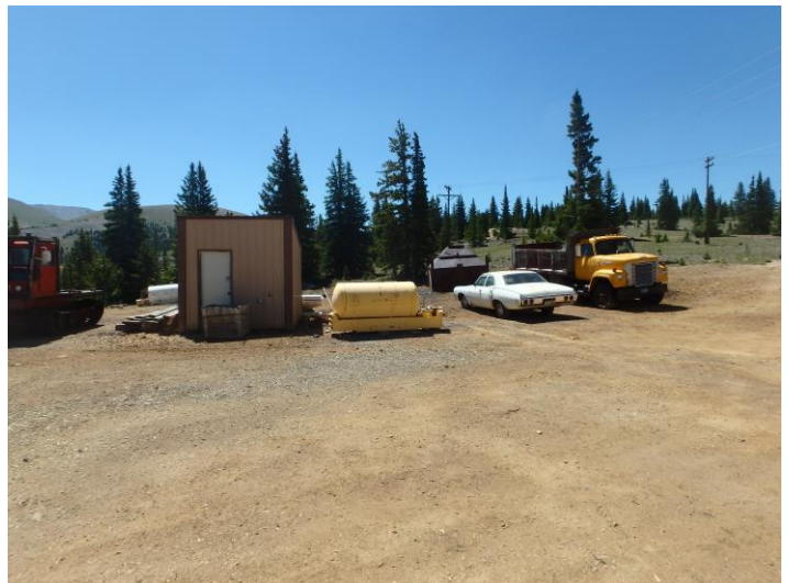
Storage around Hopemore building