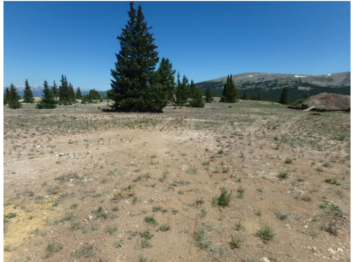
West side of Hunter Shaft area