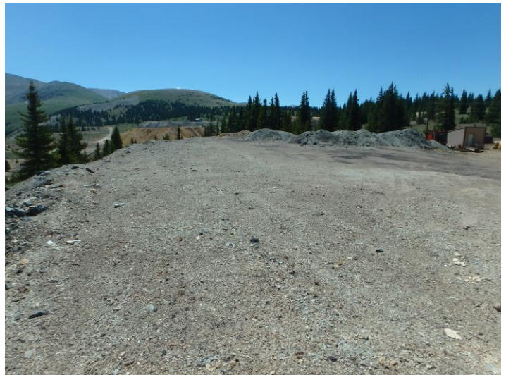
Hopemore wasterock pad