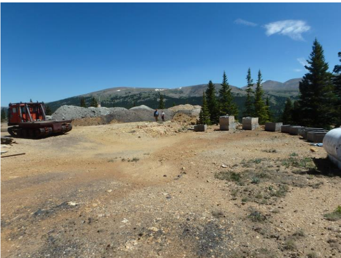
Hopemore ore pad