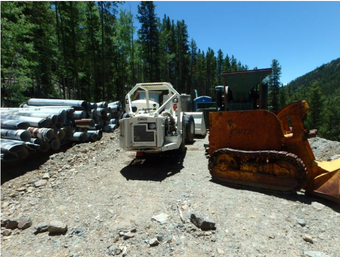
Storage area on south end of permit area