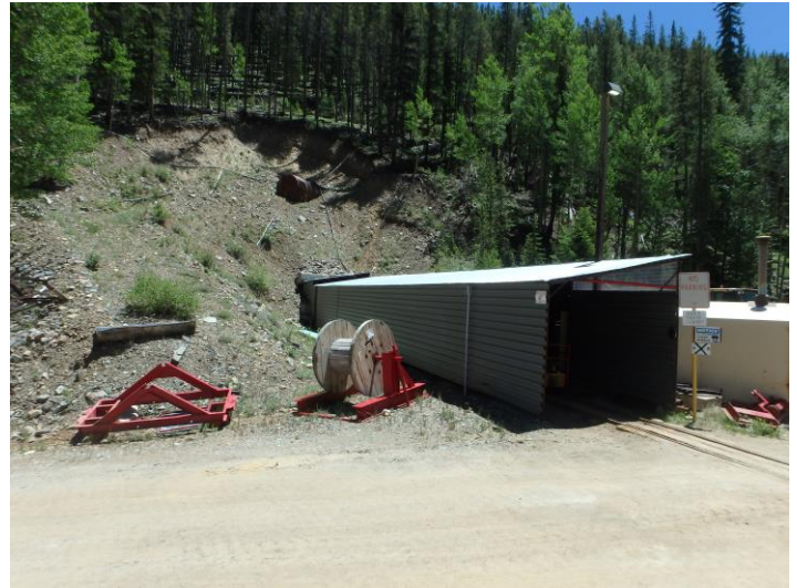
Portal secured with steel gate