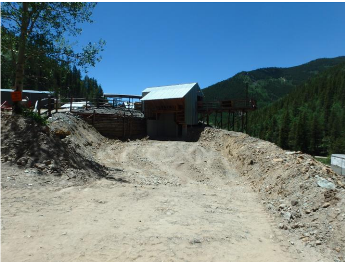
Load out area