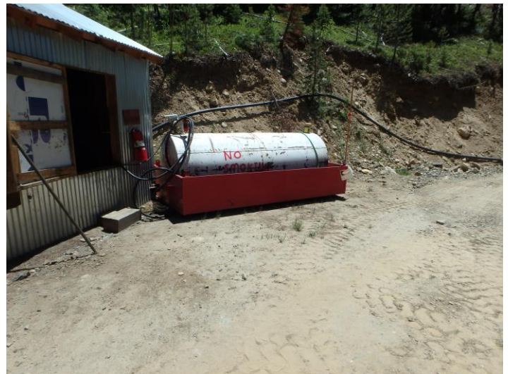
Fuel storage outside generator building