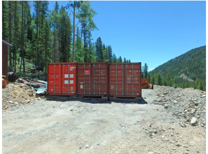
Storage area on south end of permit area