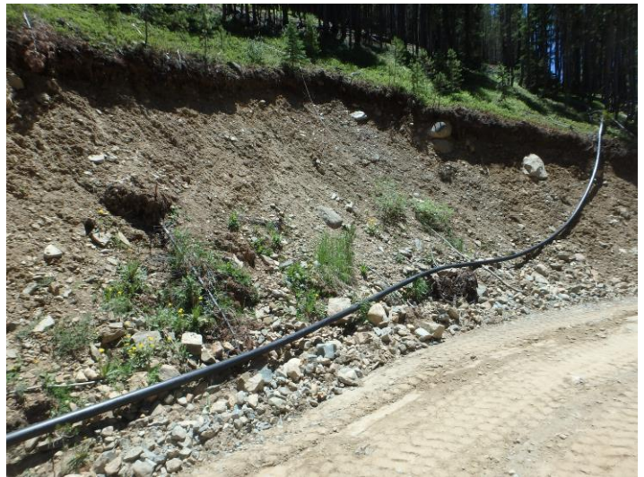
Location for TR-2 "storage" portal that was not constructed