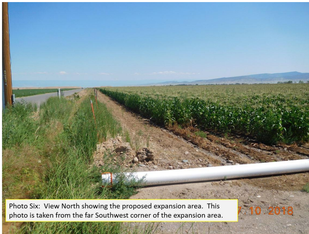
Photo Six: View North showing the proposed expansion area. This photo is taken from the far Southwest corner of the expansion area.