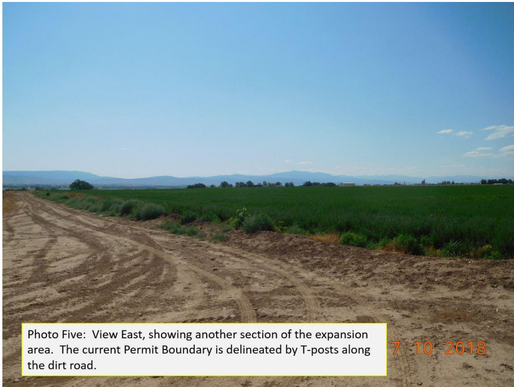
Photo Five: View East, showing another section of the expansion area. The current Permit Boundary is delineated by T-posts along the dirt road.