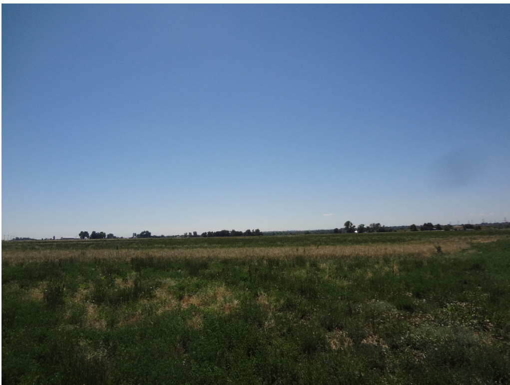
View of AR01 parcel from NW corner looking southeast