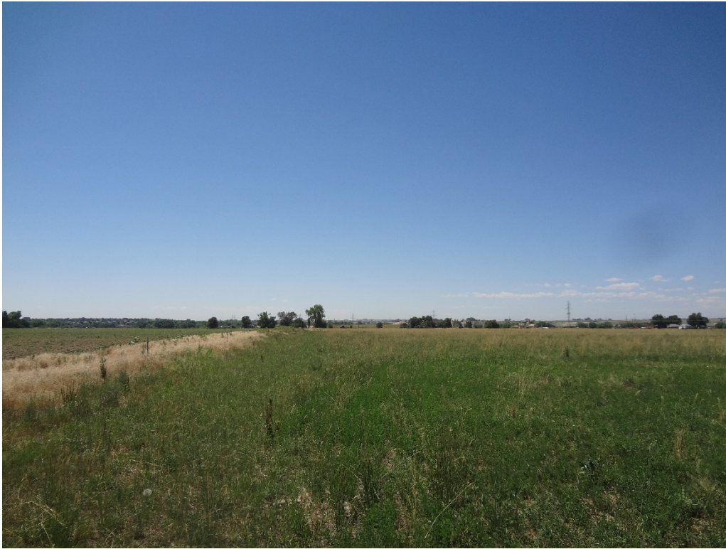
View of AR01 parcel from NE corner looking south