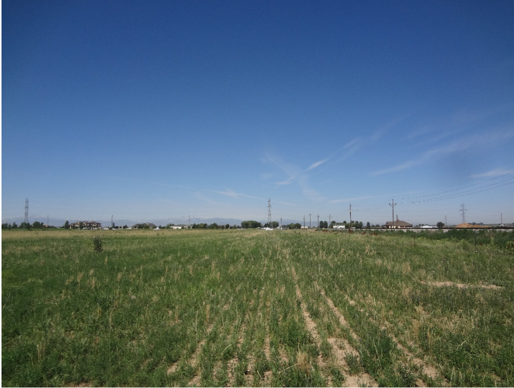
View of AR01 parcel from NE corner looking west