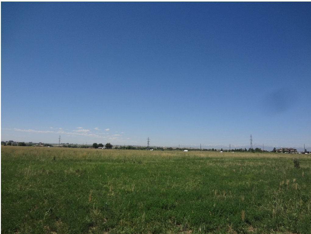
View of AR01 parcel from NE corner looking southwest