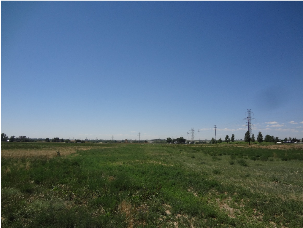
View of AR01 parcel from NW corner looking south