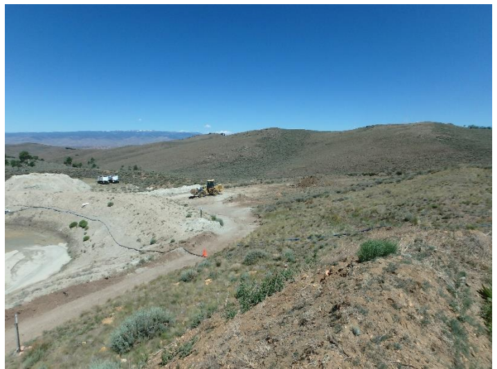
Primary settling pond