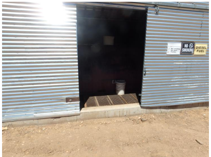
Concrete lined fuel storage shed