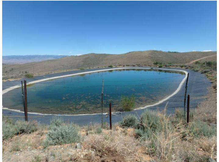
Upper "lined" pond