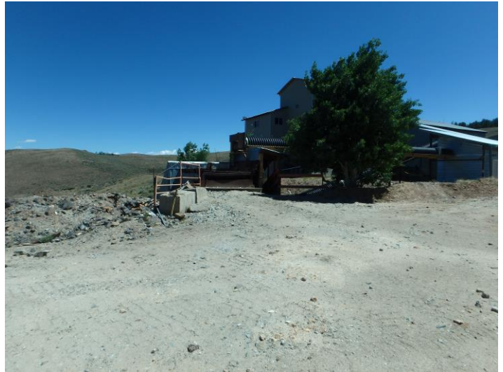
Ore storage pad