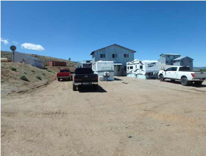
Parking area in front of mill facility