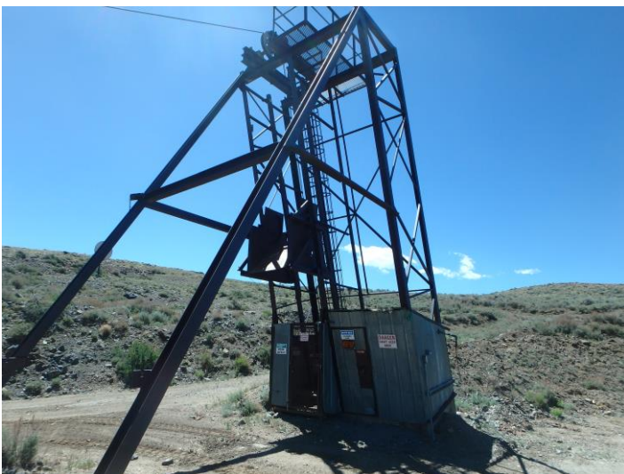
Secured hoist assembly