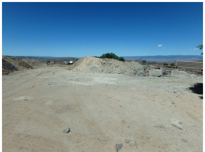
Ore storage pad