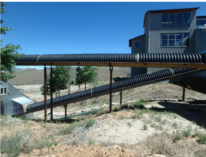
Conveyor system from crusher