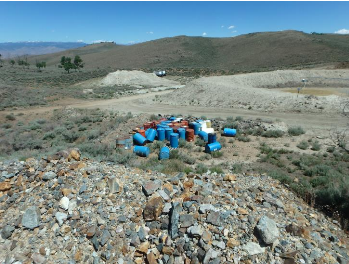
Empty barrels stored below ore storage pad