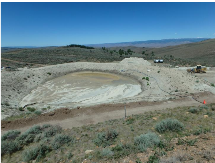
Primary settling pond