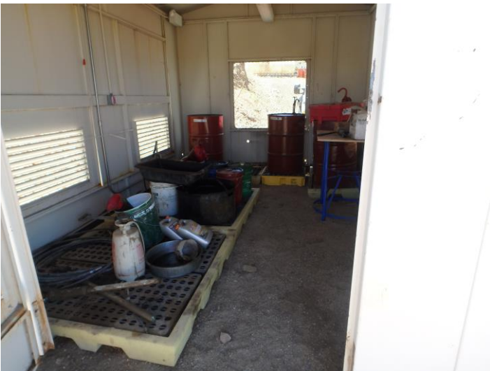
Chemical storage shed