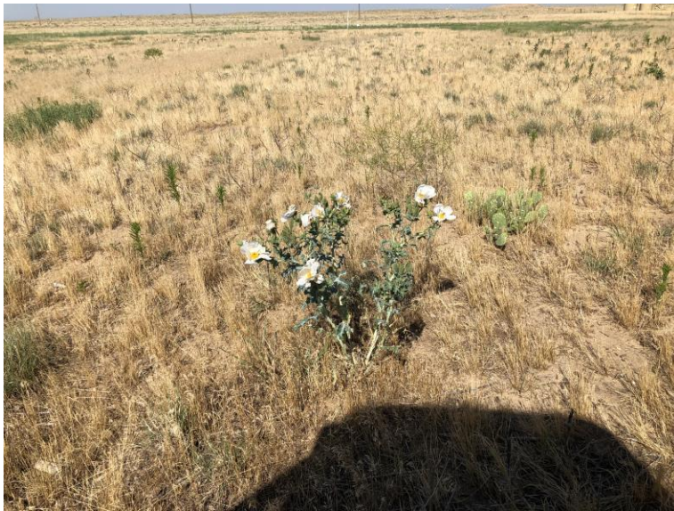
Pricklepoppy in Area 29

Number of Partial Inspection this Fiscal Year: 9