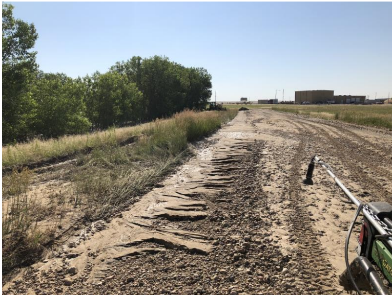
Sediment on road near Sediment Pond 2

Number of Partial Inspection this Fiscal Year: 9