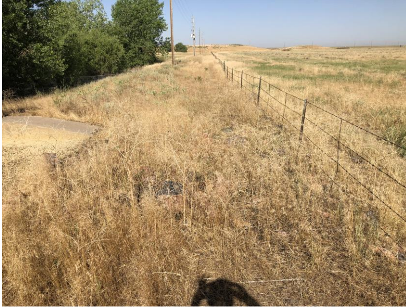
Area below Sediment Pond 2 (no detrimental impacts from discharge)