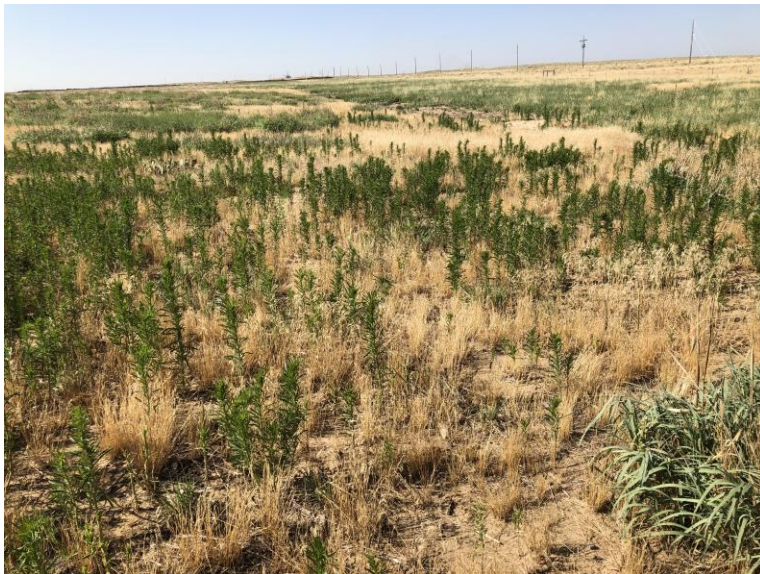
Horseweed in Area 30

Number of Partial Inspection this Fiscal Year: 9