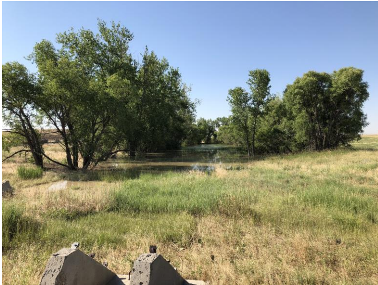
High level of water in Dugout Pond