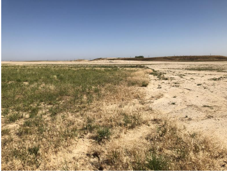
Looking north toward spoil area