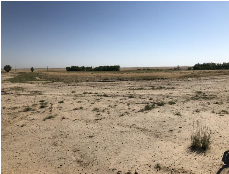
Looking northeast toward Area 25

Number of Partial Inspection this Fiscal Year: 9