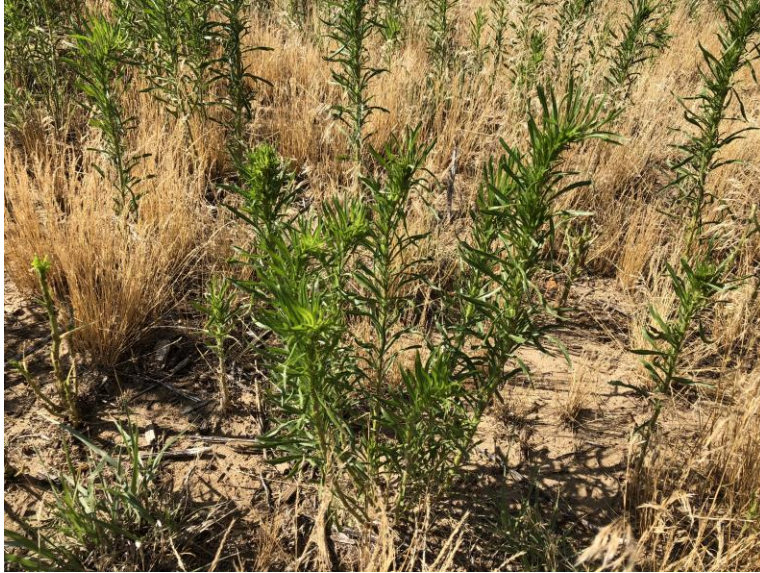
Close up of horseweed