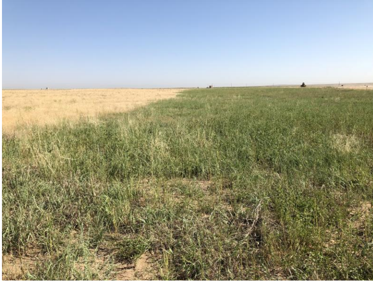
West of B Pit – cheat grass treatment by CEC has been effective (yellow grass on left side is off site)