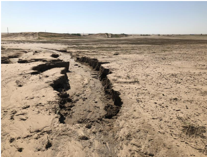
Erosion from recent storms in north part of B Pit

Number of Partial Inspection this Fiscal Year: 9