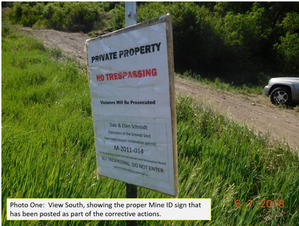
Photo One: View South, showing the proper Mine ID sign that has been posted as part of the corrective actions.