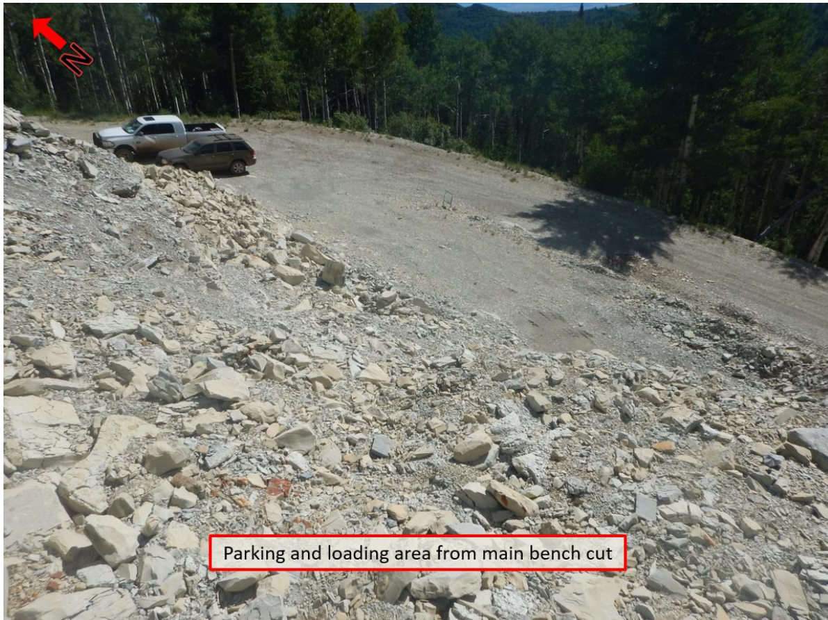
Parking and loading area from main bench cut