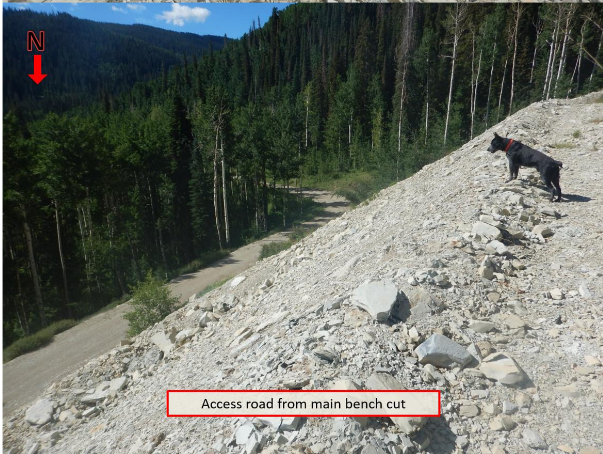
Access road from main bench cut