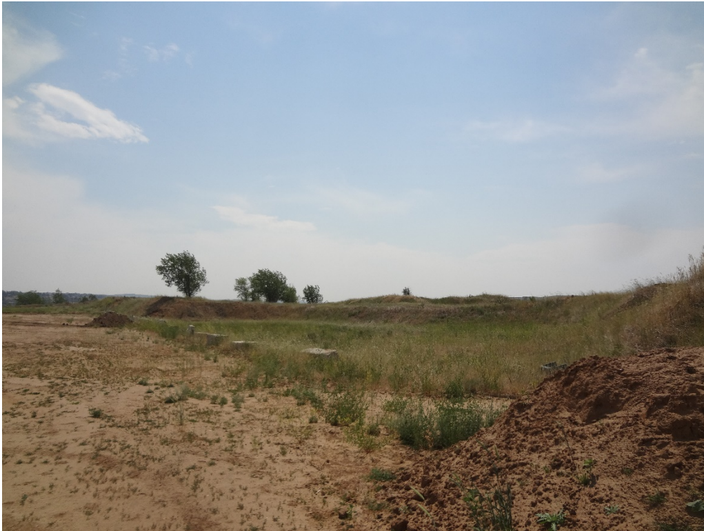
AM-05 disturbance area, self-revegetated