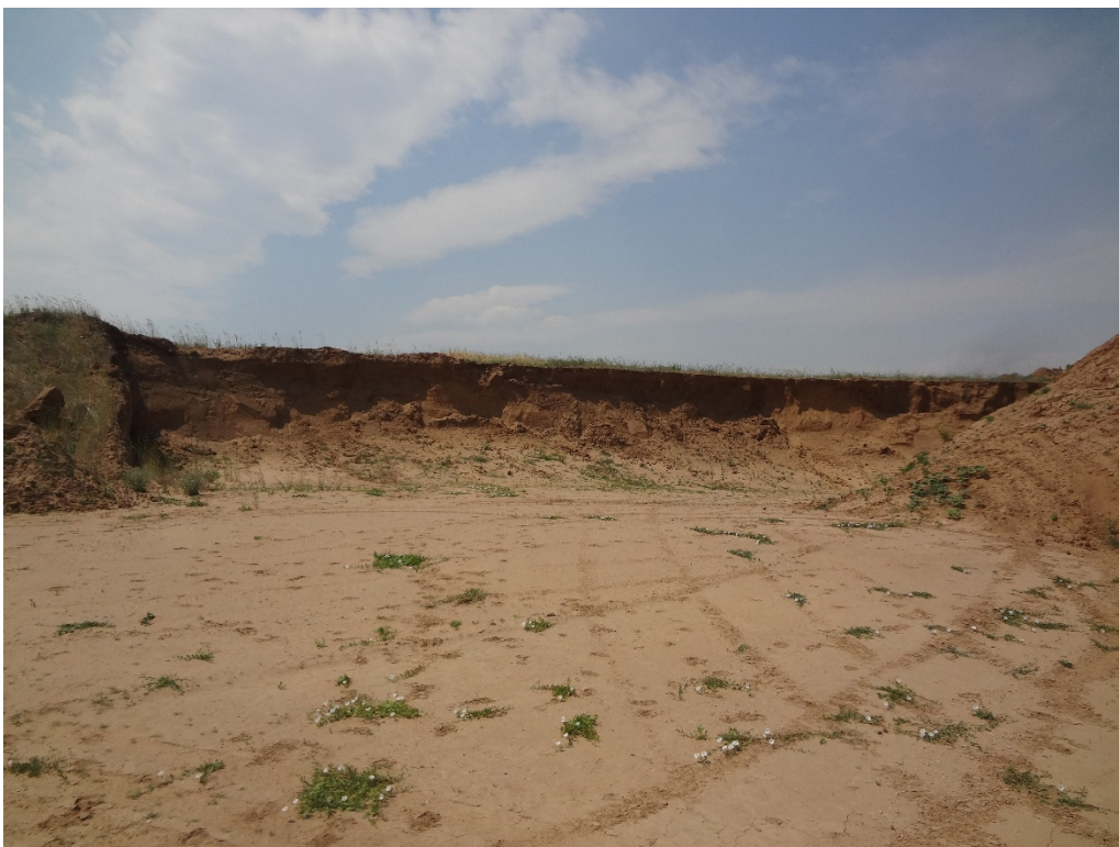
Mining disturbance west of AM-05 area