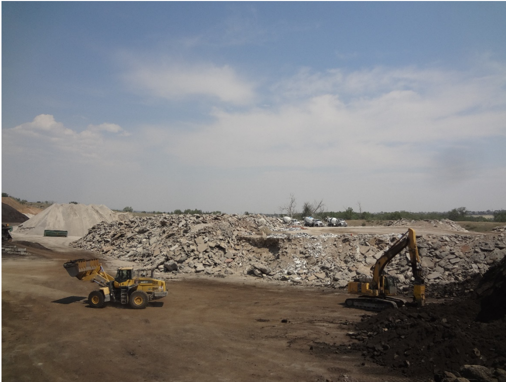
View of concrete and asphalt recycling activities looking northeast