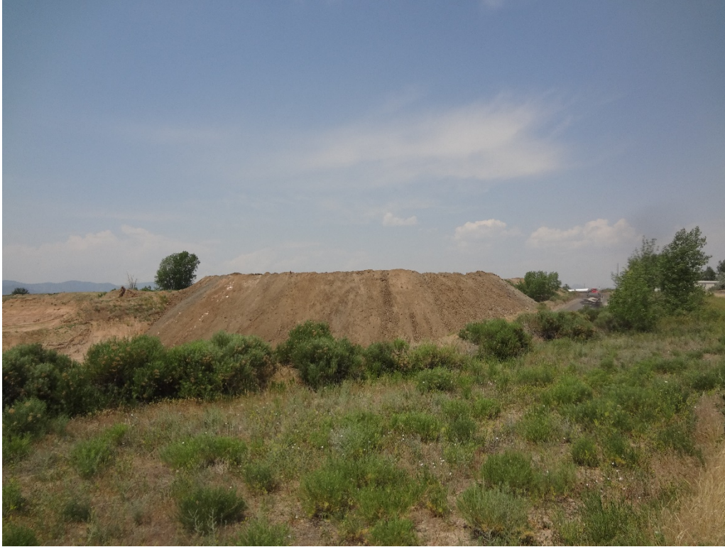
View of backfill area located south of scale house looking west