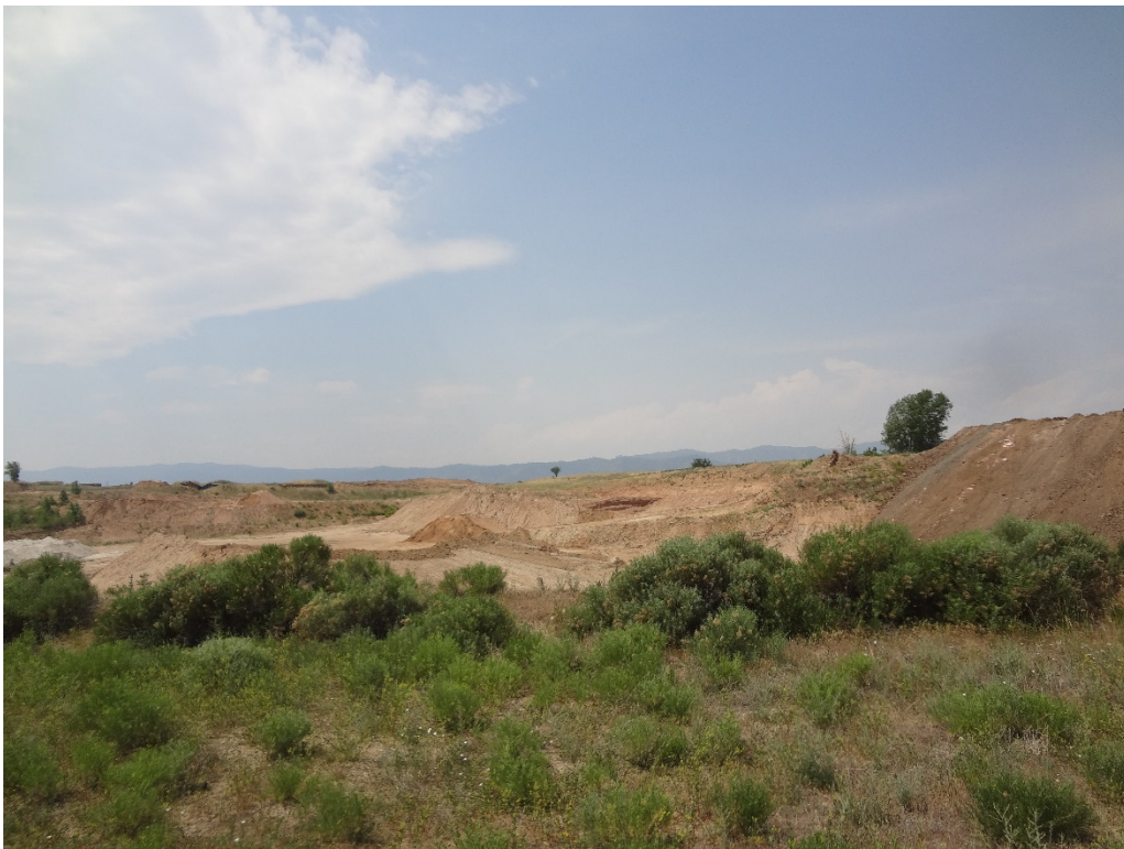
View of the backfill area and mining excavation in the west highwall looking southwest