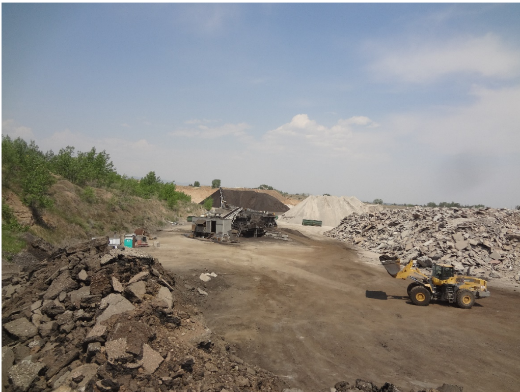
View of concrete and asphalt recycling activities looking north