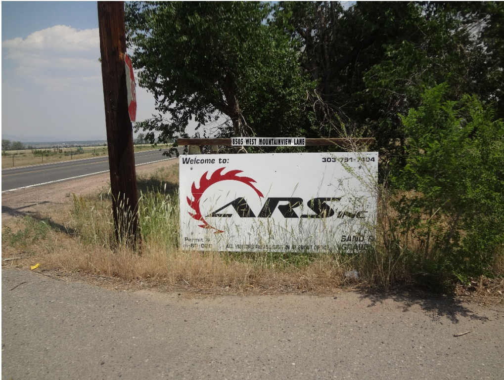
ARS Sand and Gravel mine sign at north entrance