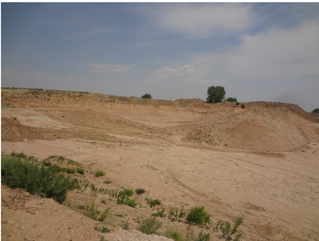
Mining area in west highwall and stockpile looking northeast