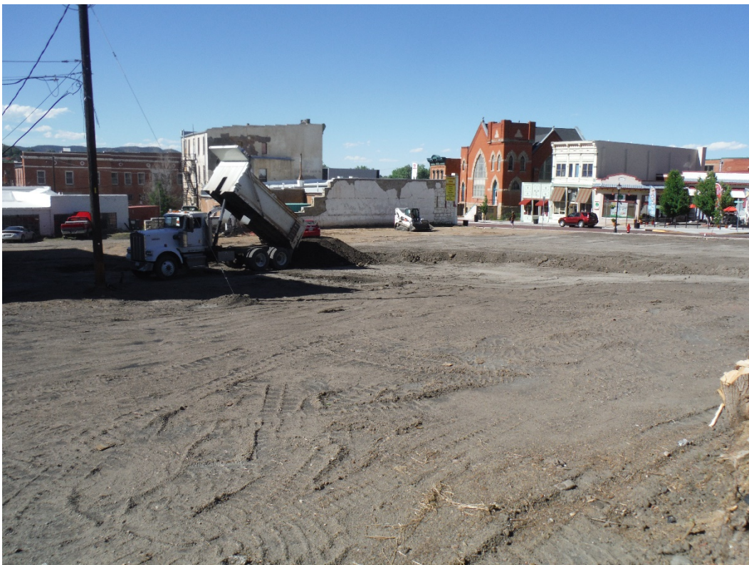
Photo 2. Dump truck at the open lot in Trinidad; looking northeast.