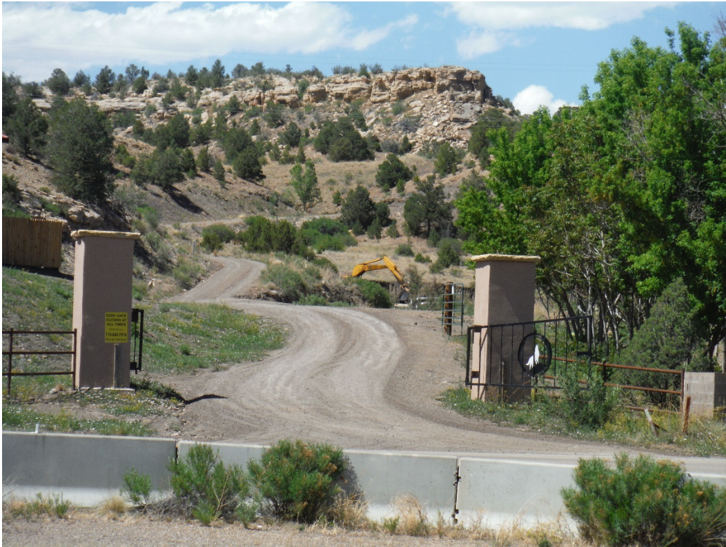
Photo 1. Excavator loading dump truck; looking north from Highway 12 and CR 47.7.