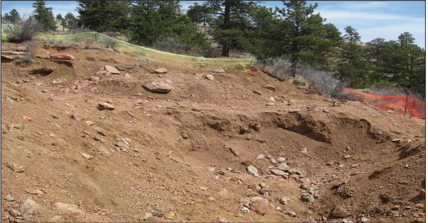
3. Open excavation along the southern portion of the trench.