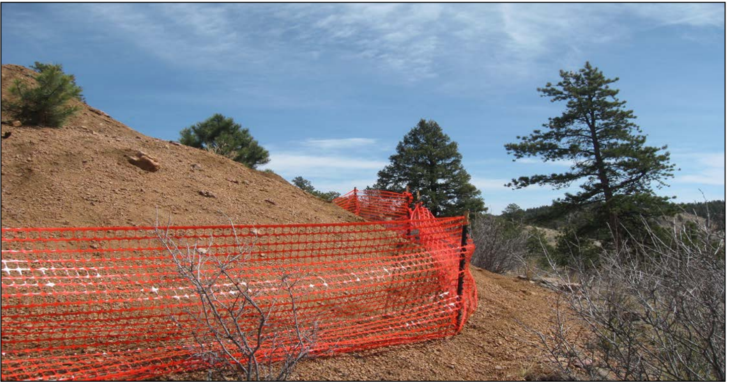
2. Safety fencing around the excavation.