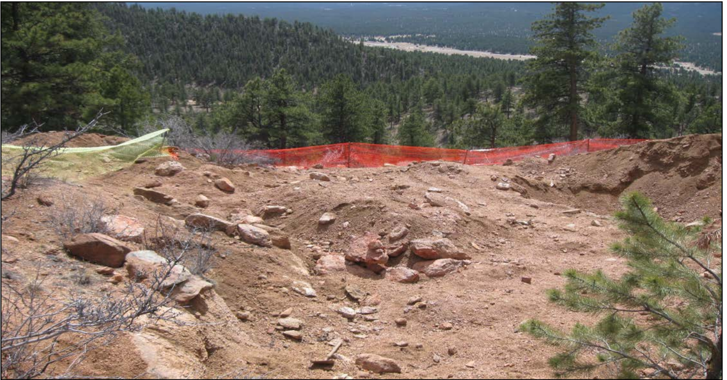
1. Backfilled area along northern portion of the trench.