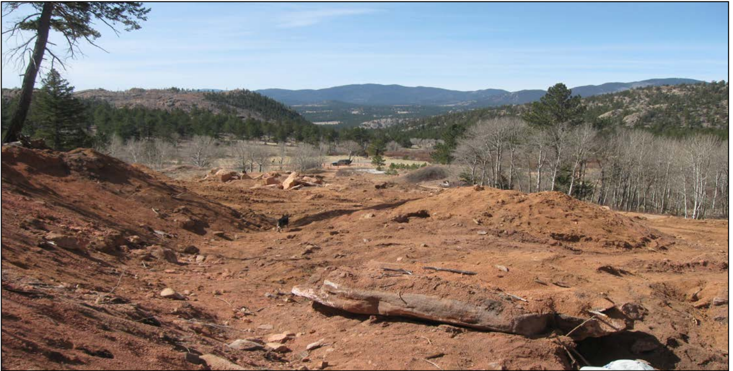
1. Overview of site, photo taken facing south.