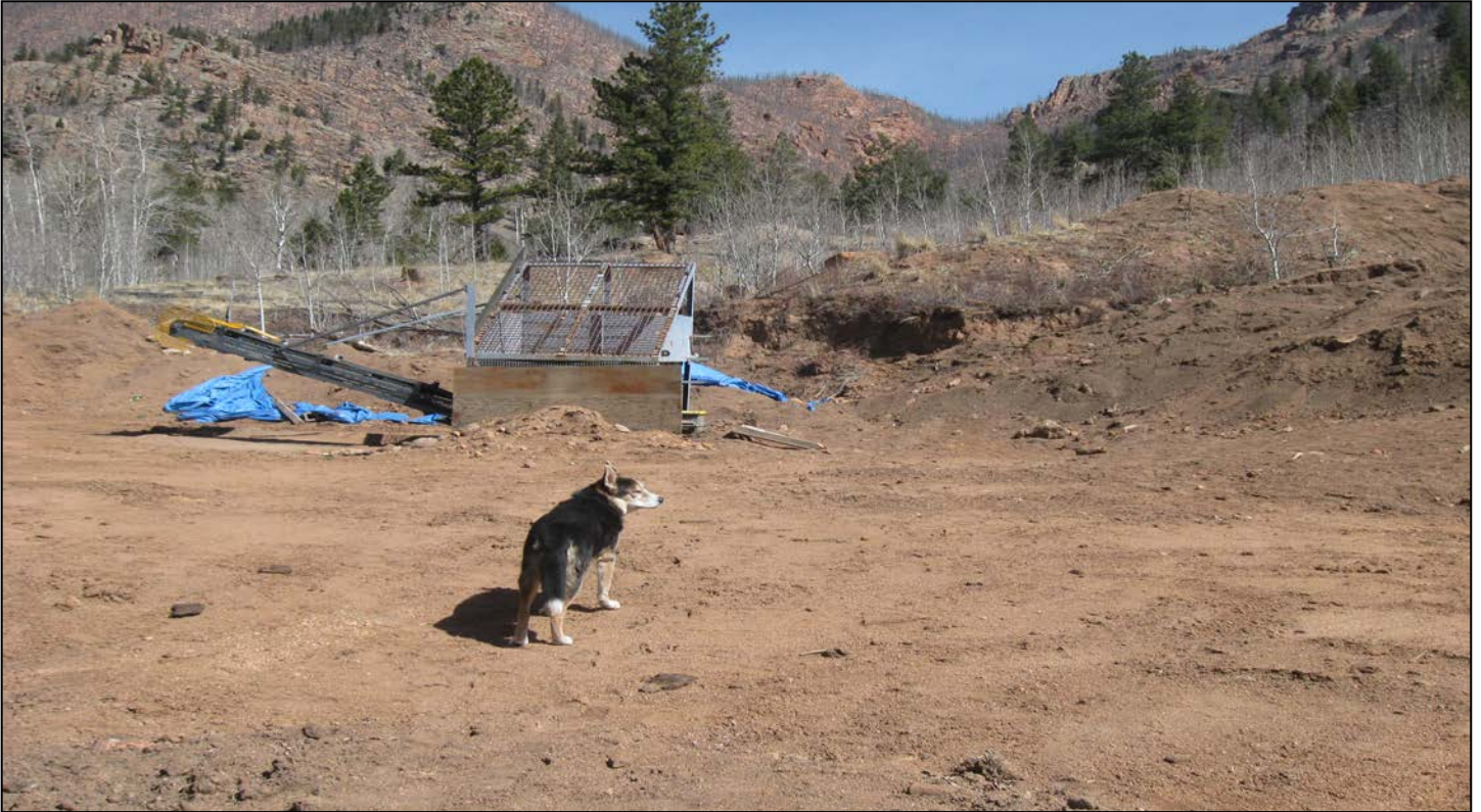
3. Processing area.