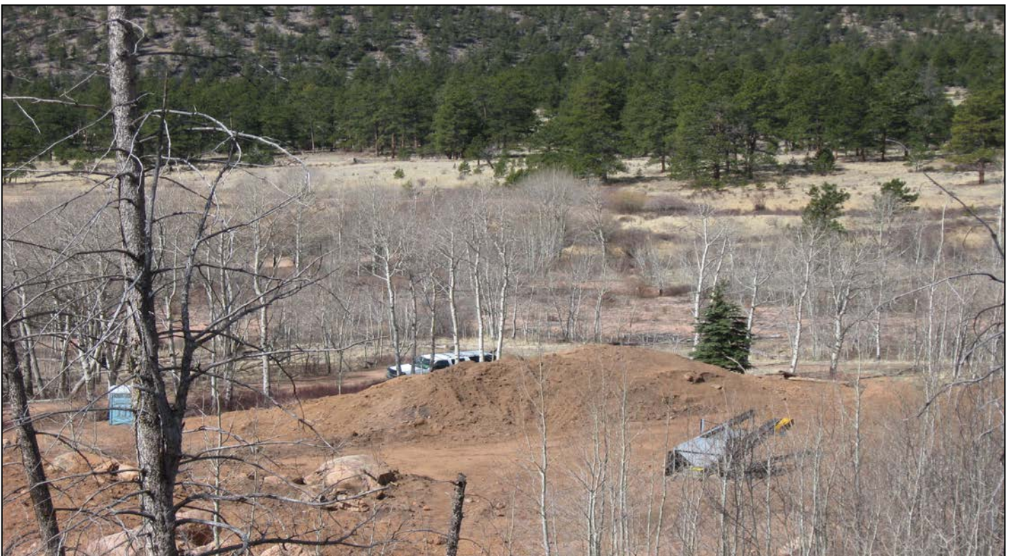
4. Screened material to be used for backfilling.