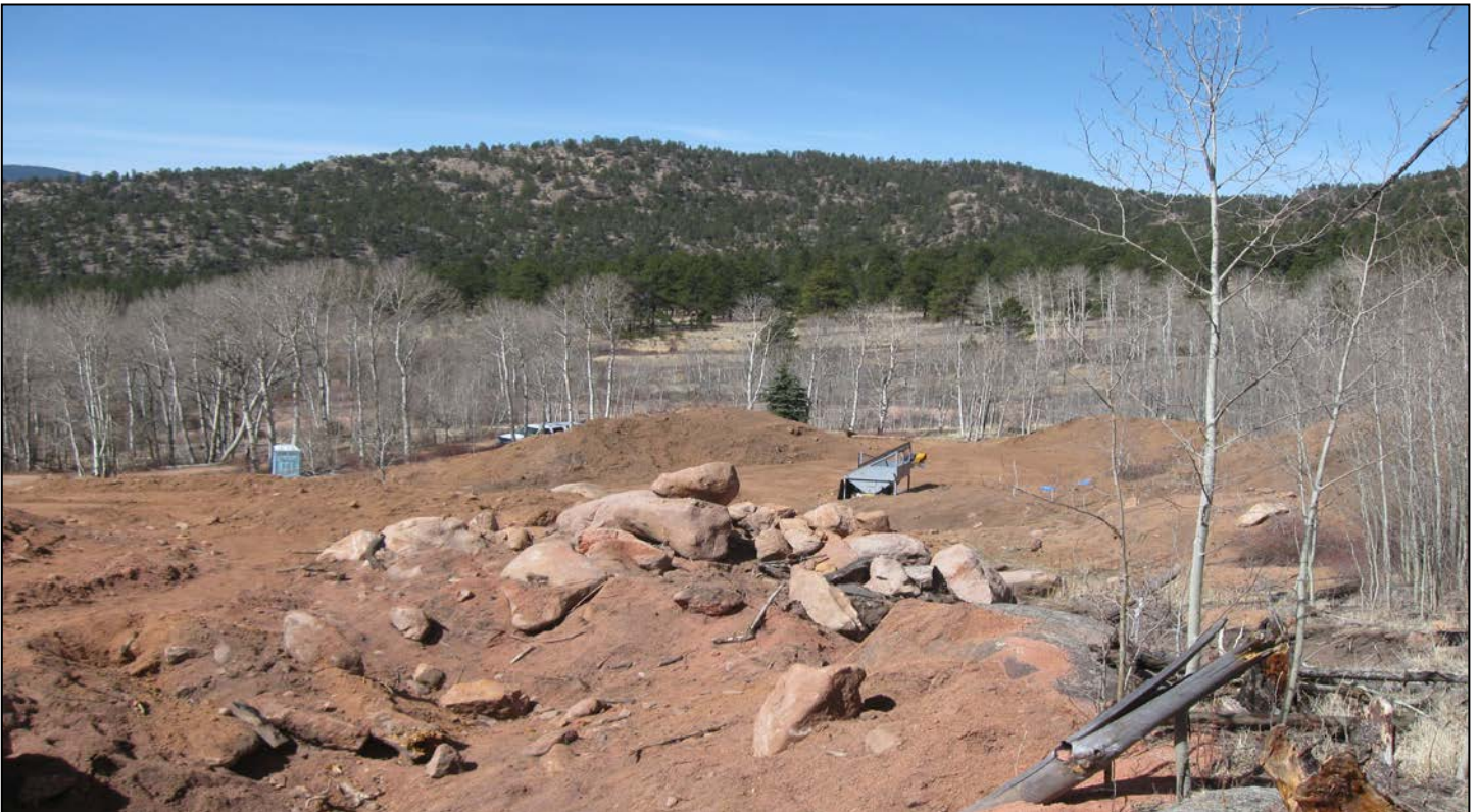
2. Overview of site, photo taken facing north.