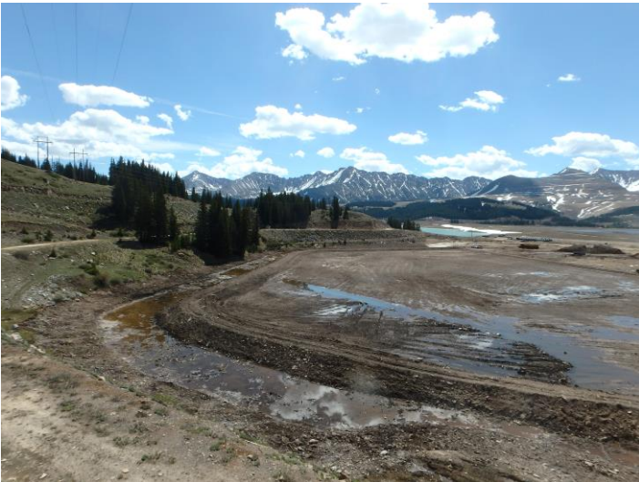
Lake Irwin Wetlands Mitigation