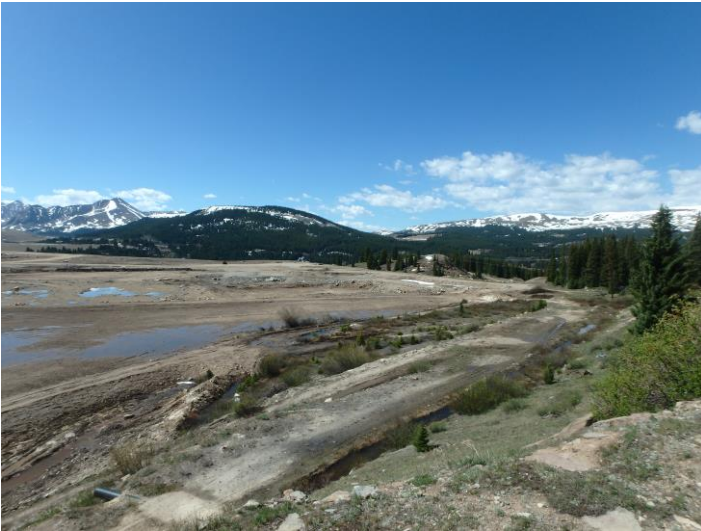
Lake Irwin Wetlands Mitigation