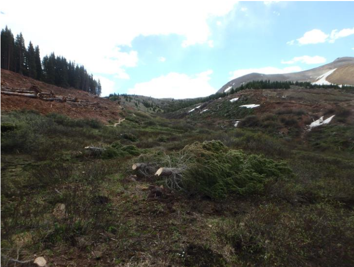
McNulty OSF Expansion