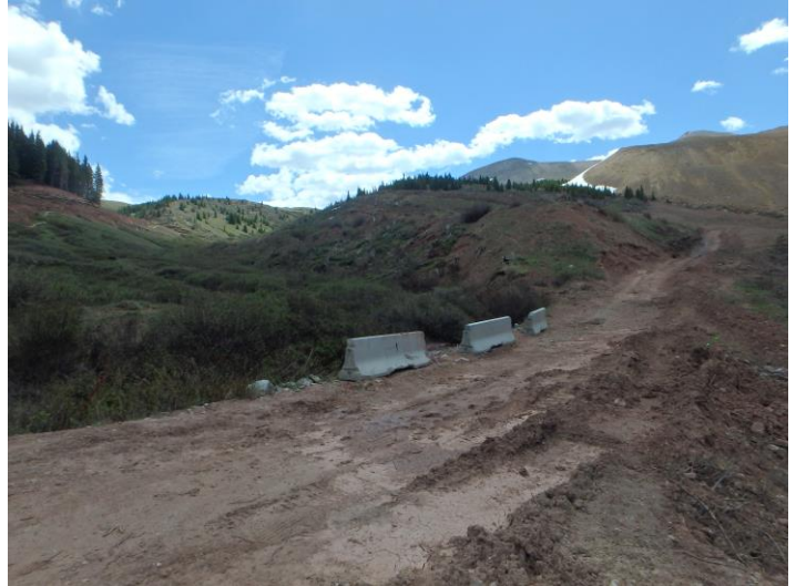
McNulty OSF Expansion