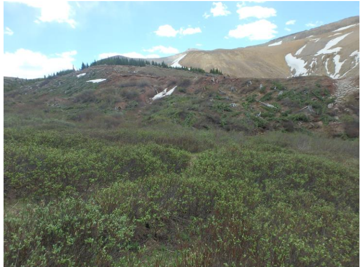
McNulty OSF Expansion