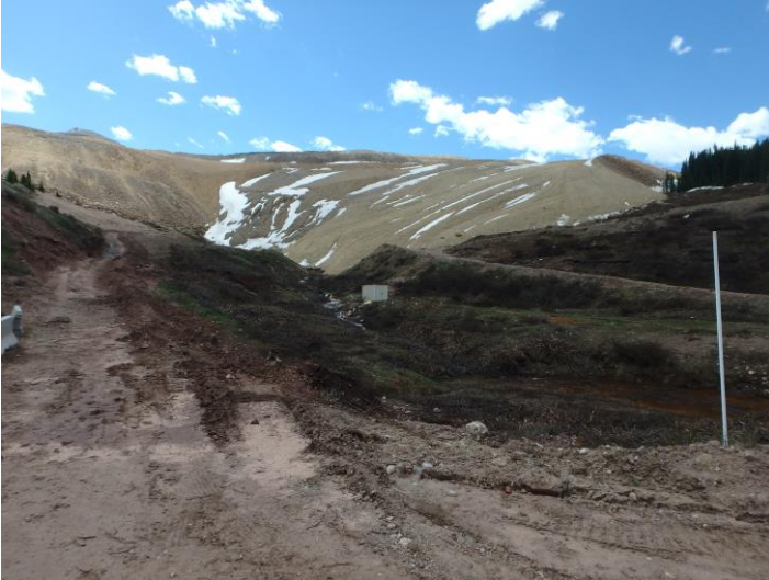
McNulty OSF Expansion