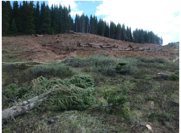
McNulty OSF Expansion