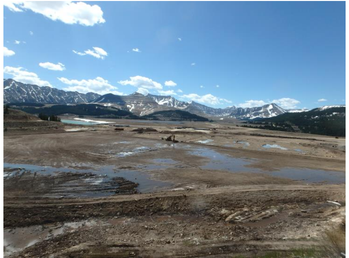
Lake Irwin Wetlands Mitigation