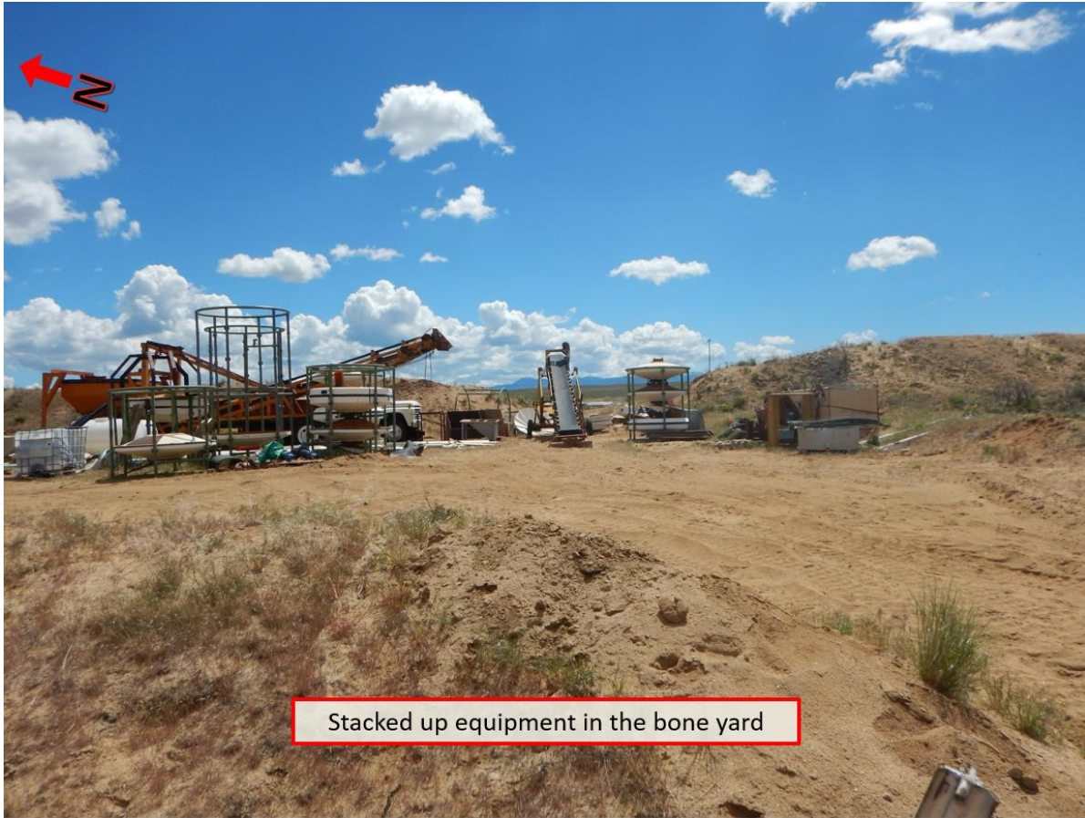
Stacked up equipment in the bone yard