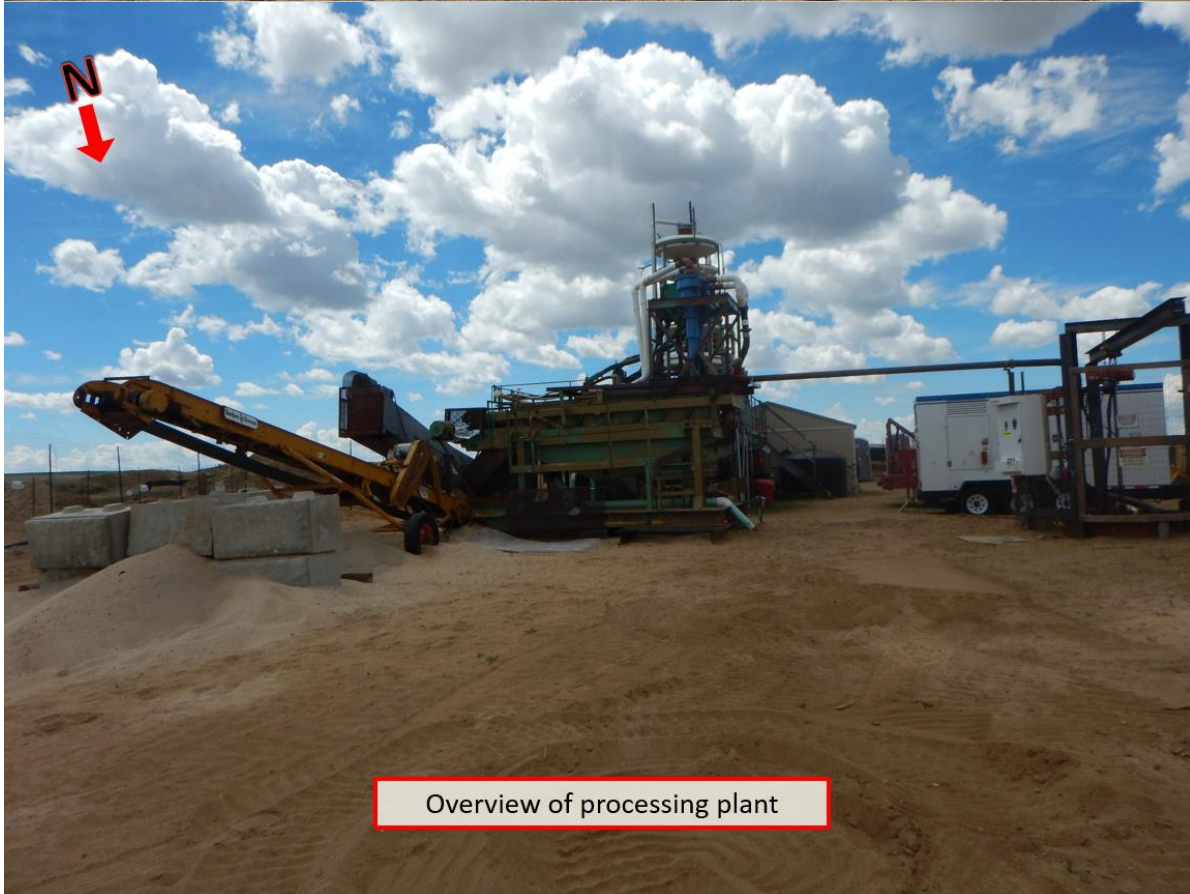
Overview of processing plant