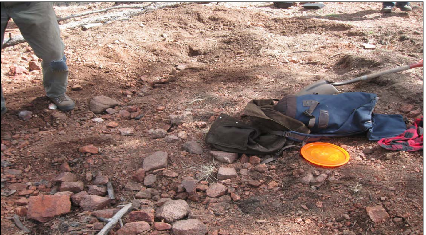
2. Reclaimed prospect site, where un-permitted prospector were encountered.