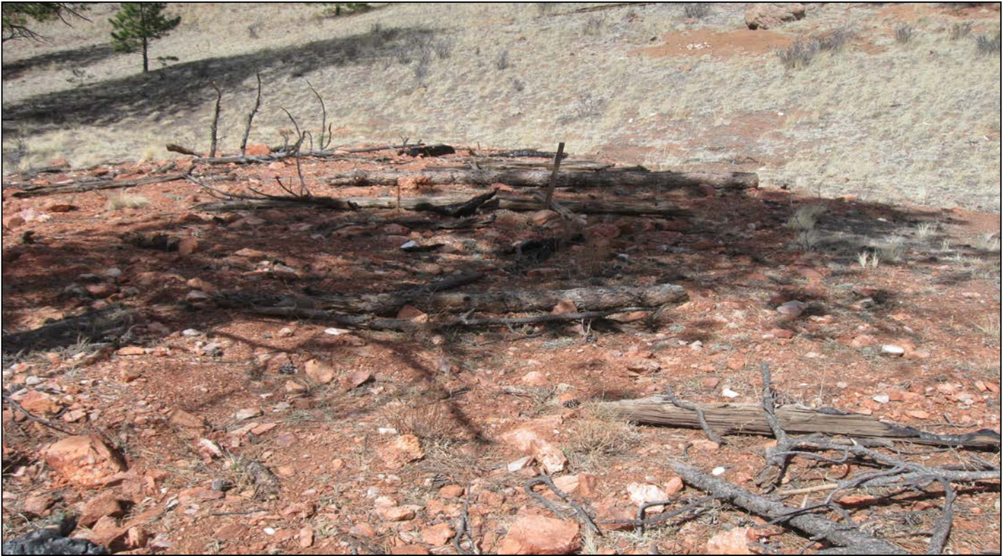
3. Reclaimed prospect site, early establishment of vegetation.