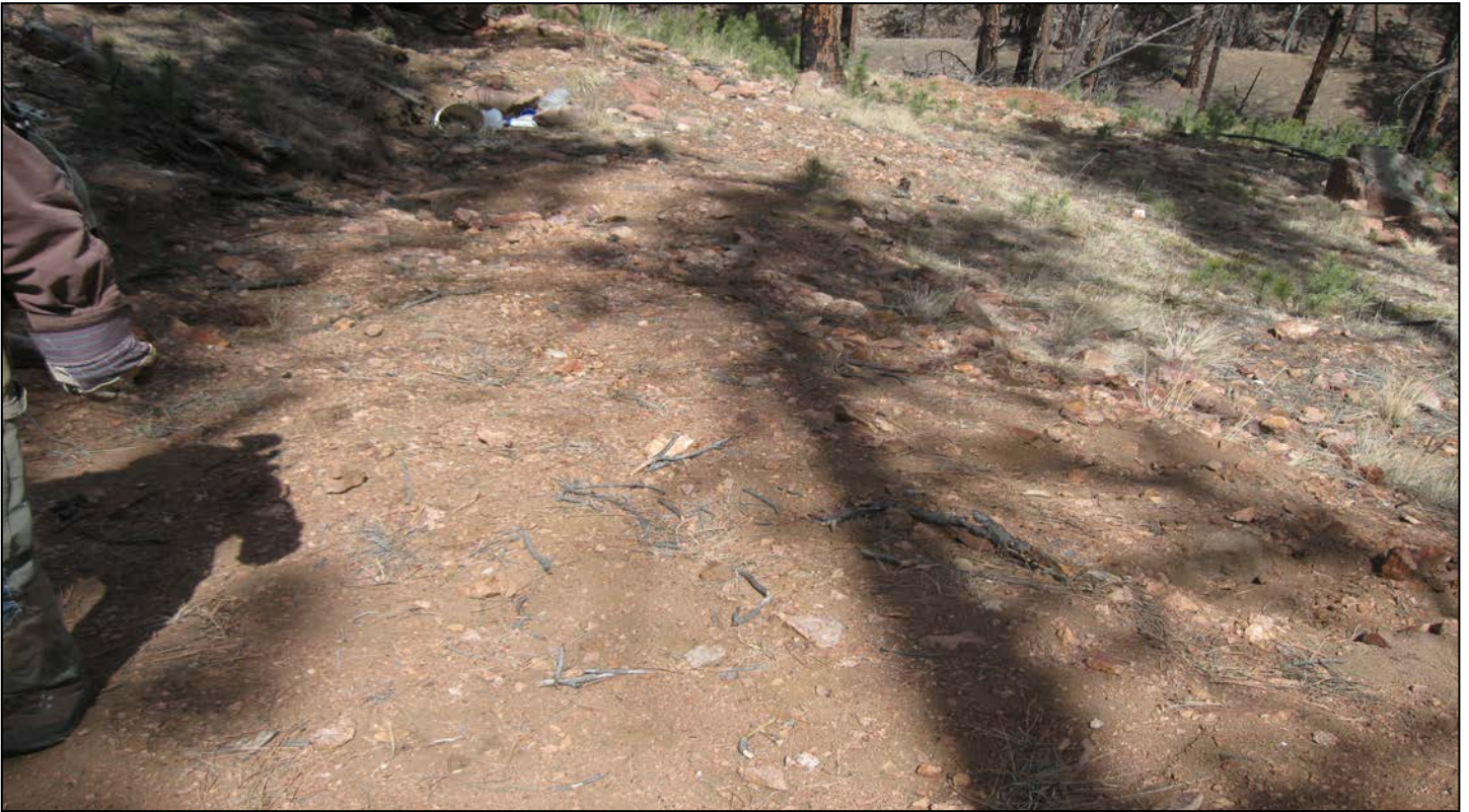
1. Reclaimed prospect site, disturbance created by un-permitted prospectors.