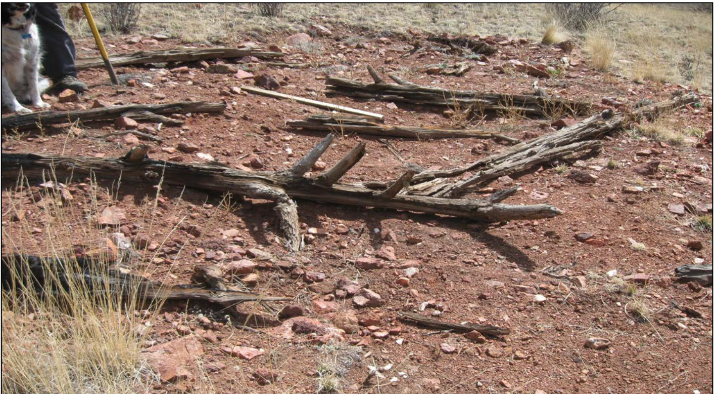
4. Reclaimed prospect site, early establishment of vegetation.