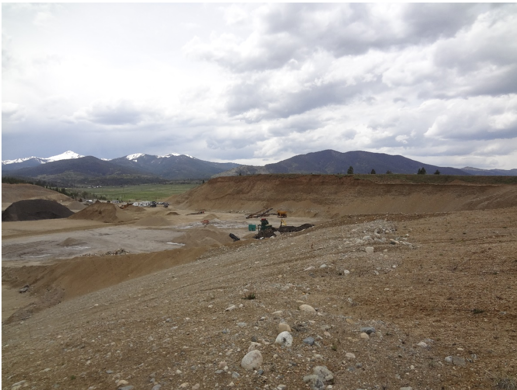
View of site from the north highwall looking southwest