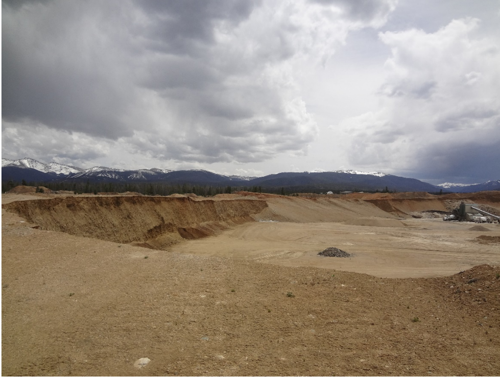
View of the current highwall and graded section of highwall looking south