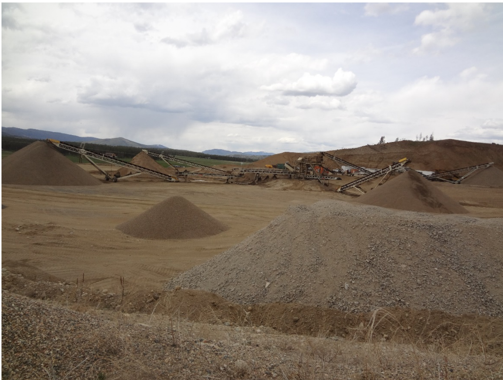
View of wash plant looking north from pit floor