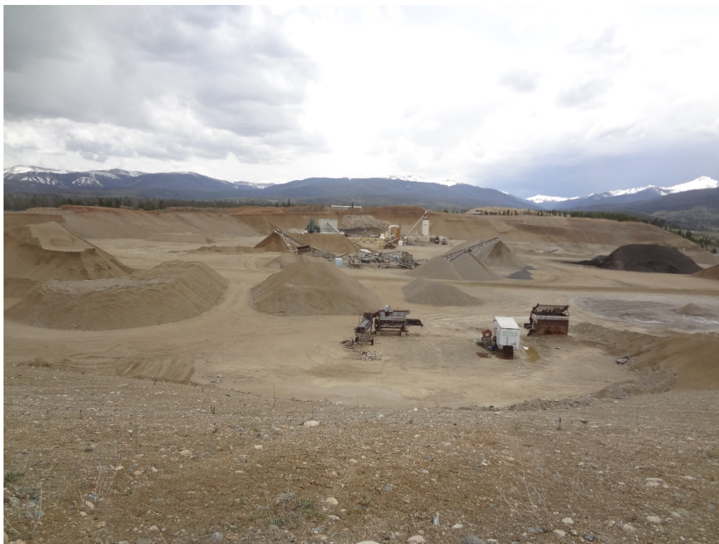
View of site from the north highwall looking south at batch and processing plants