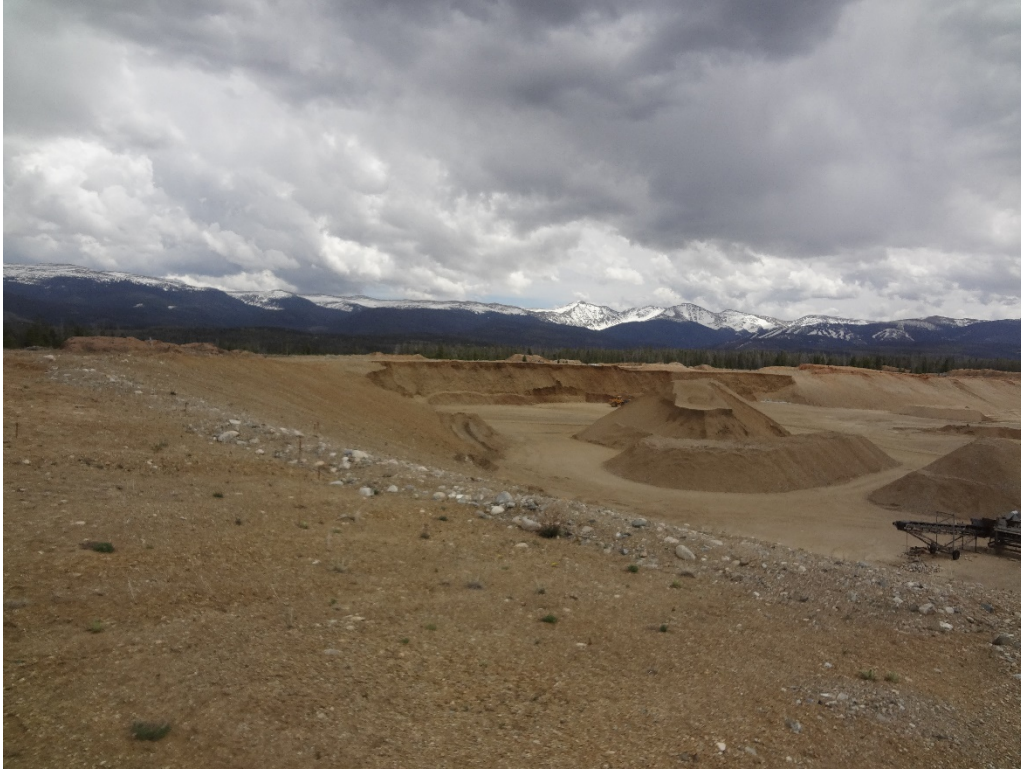
View of site from the north highwall looking southeast at highwall and stockpiles