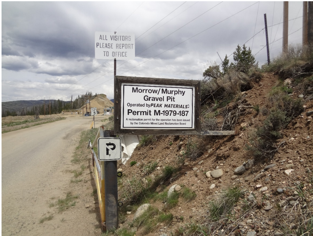
Morrow/Murphy mine sign