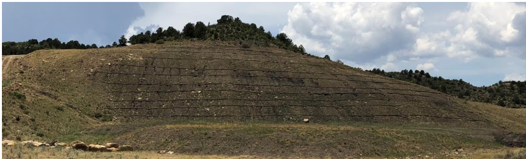
Hill above pond cleaning dump area