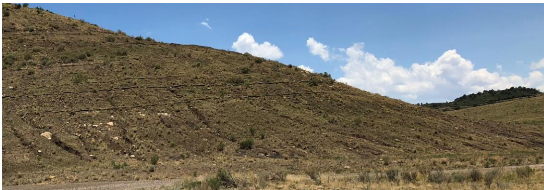
West end of “the knob”

Number of Partial Inspection this Fiscal Year: 9