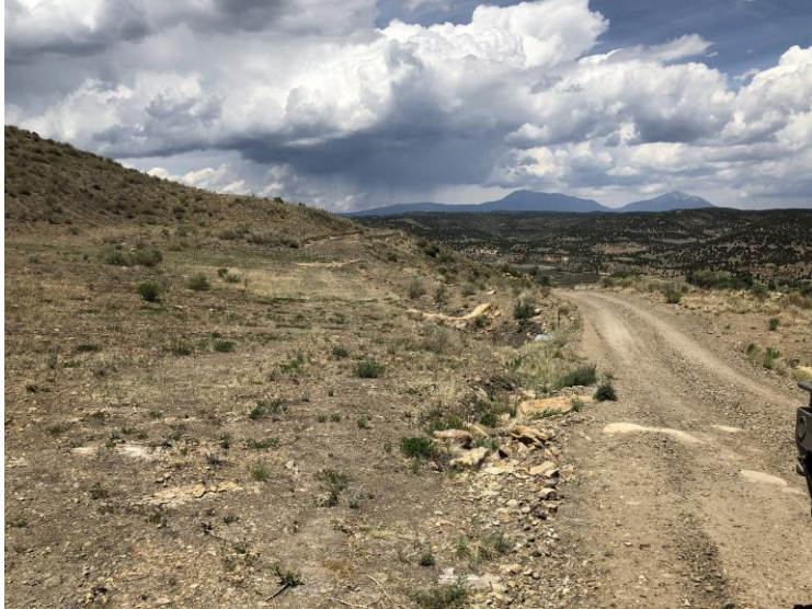
BMPs in Ditch D86