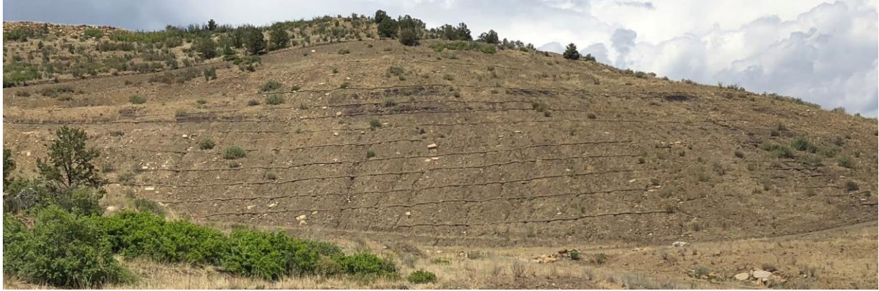
Hill above Pond 6