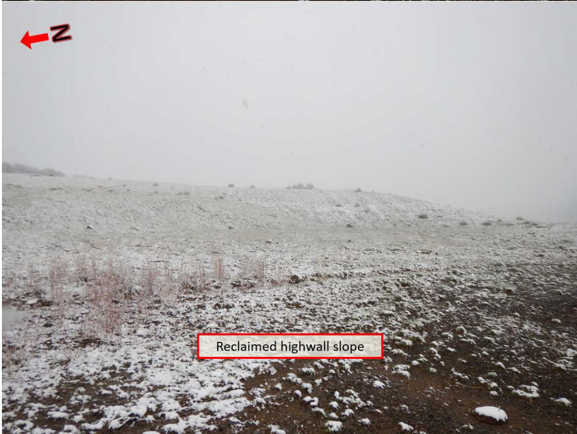
Reclaimed highwall slope