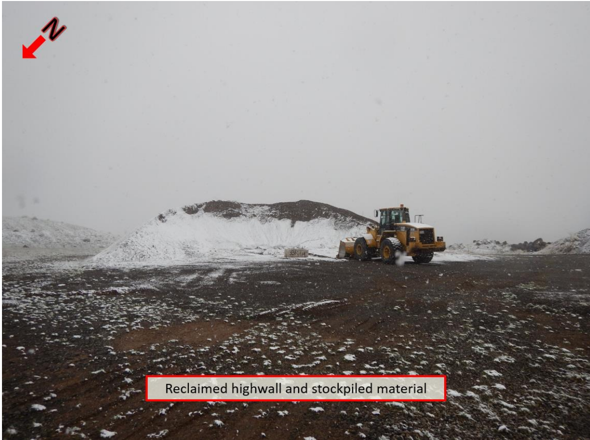
Reclaimed highwall and stockpiled material