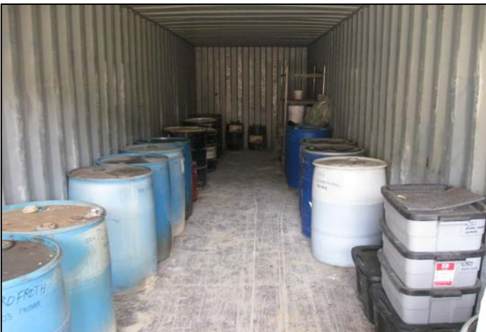
5. Conex used to store reagents.