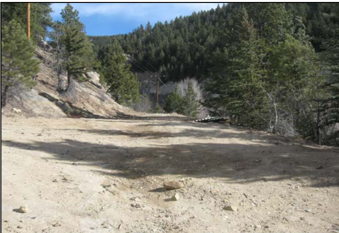
3. Area adjacent to Mill, previously used to store equipment and refuse.