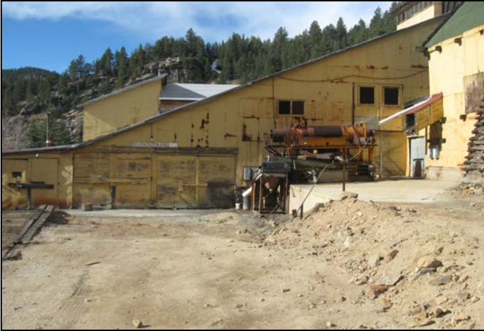
1. North side of Mill building.