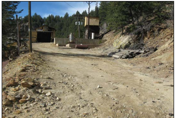
4. Area adjacent to Mill, previously used to store equipment and refuse.