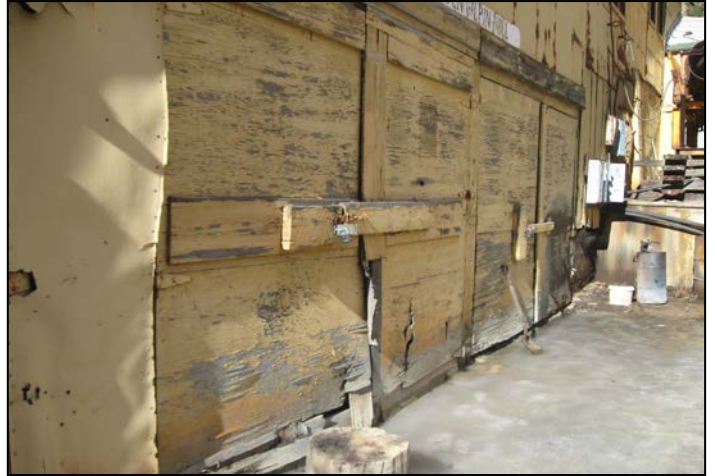
2. Locked doors on Mill building.