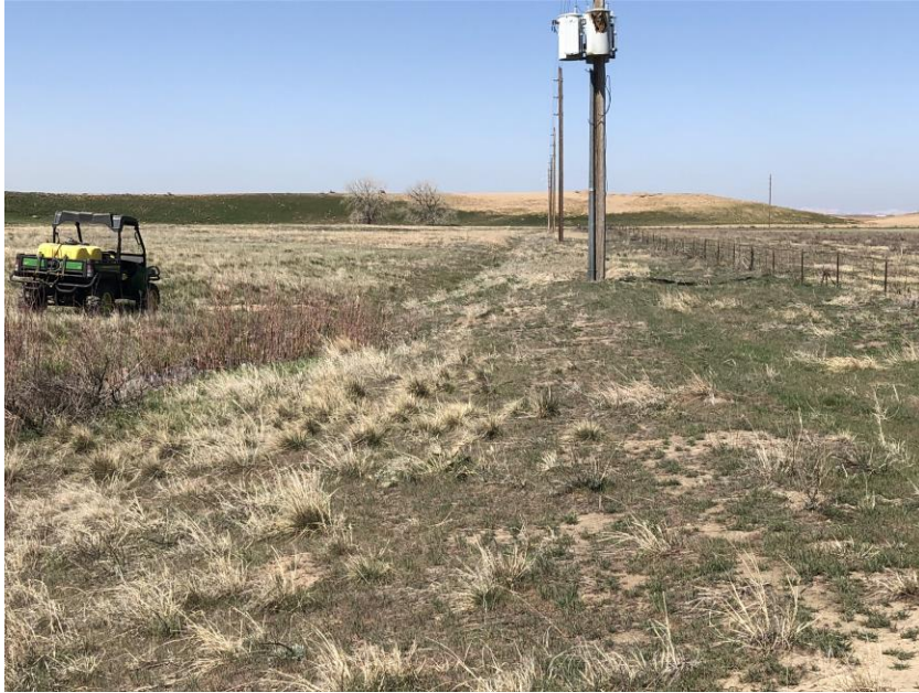
Fence line and ditch west of Sediment Pond 2 with Topsand Pile A-3 in background