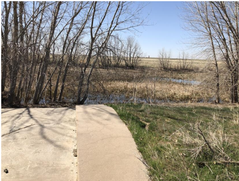
Sediment Pond 2

Number of Partial Inspection this Fiscal Year: 8