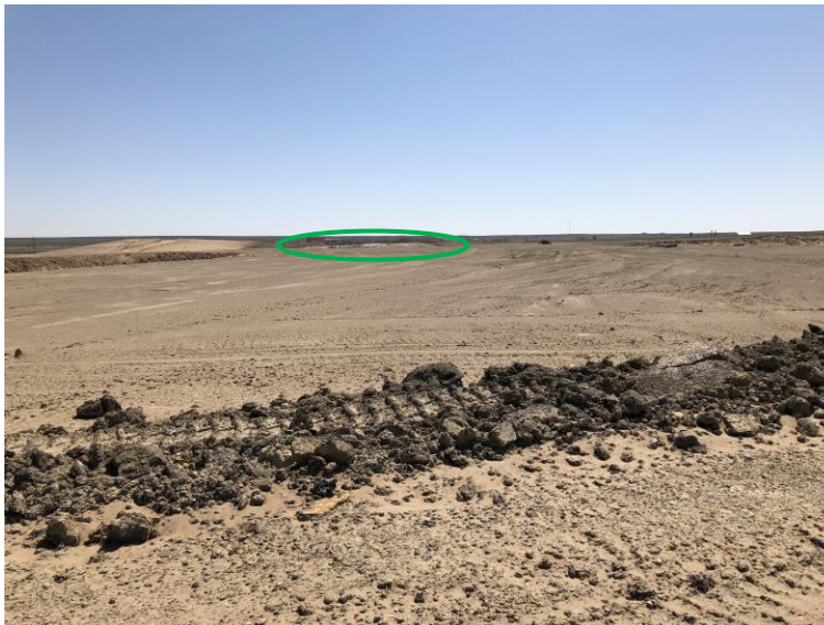
B Pit area with remaining spoil pile (circled)

Number of Partial Inspection this Fiscal Year: 8