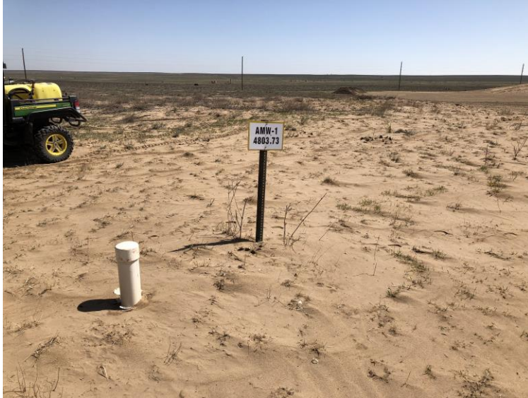
Top of well AMW-1