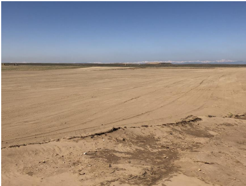
Long Term Spoil Area with B Pit area in background

Number of Partial Inspection this Fiscal Year: 8