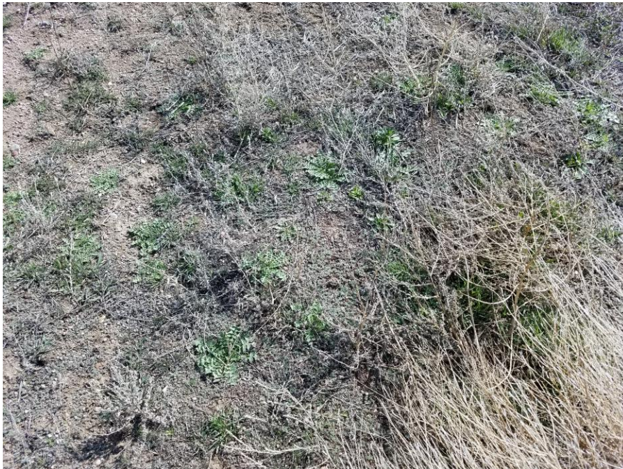
Figure 4. Thistle rosettes.