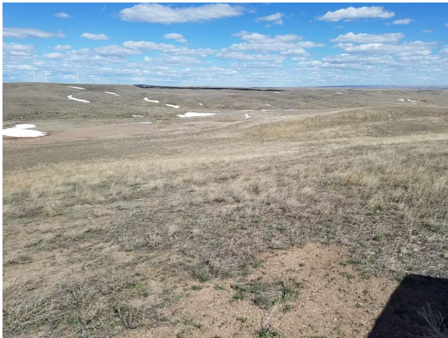
Figure 2. From the top of the pit slope near the center of the site looking southeast.