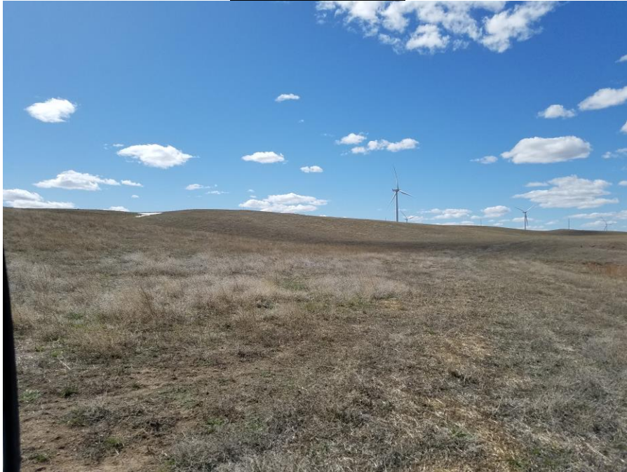
Figure 1. From near the center of the site at the base of the pit slope looking northwest.