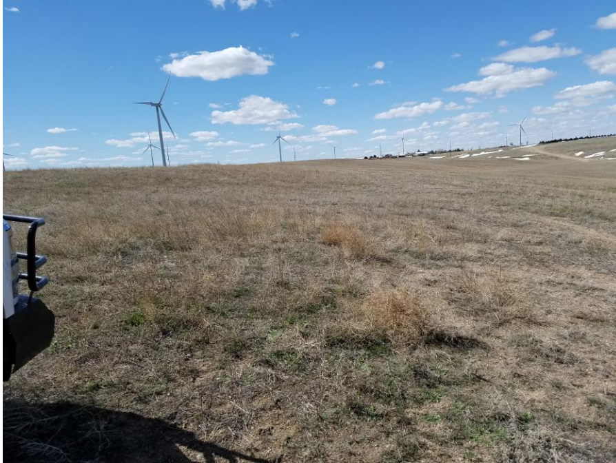
Figure 3. From the top of the pit slope looking northeast.