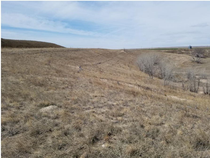
Figure 2. From the southeast corner of the AR01 area looking west.