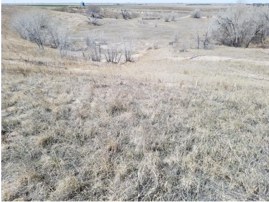
Figure 1. From the southeast corner of the AR01 area looking northwest.