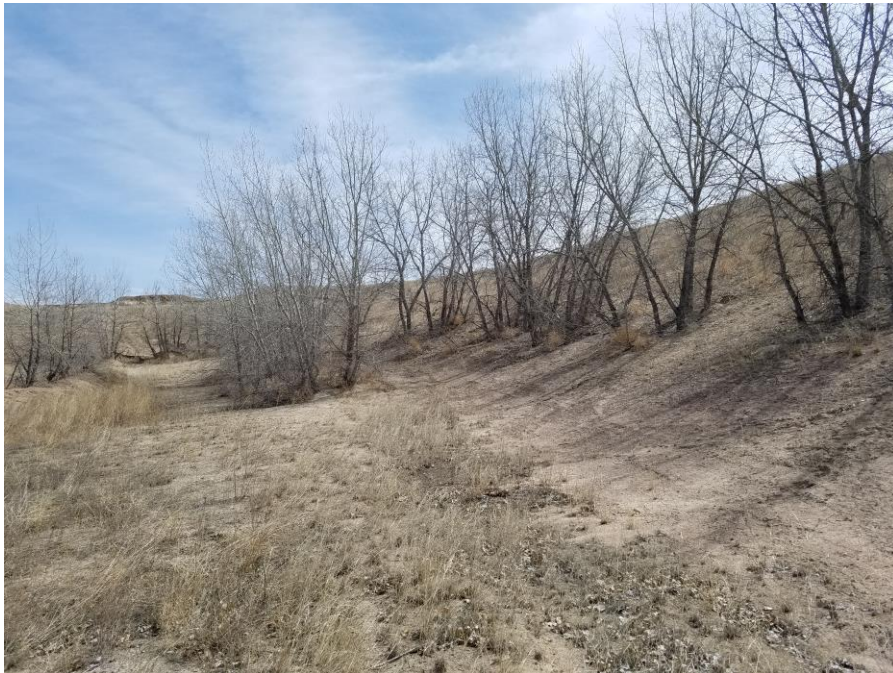
Figure 4. From the northwest end of the AR01 area looking southeast.