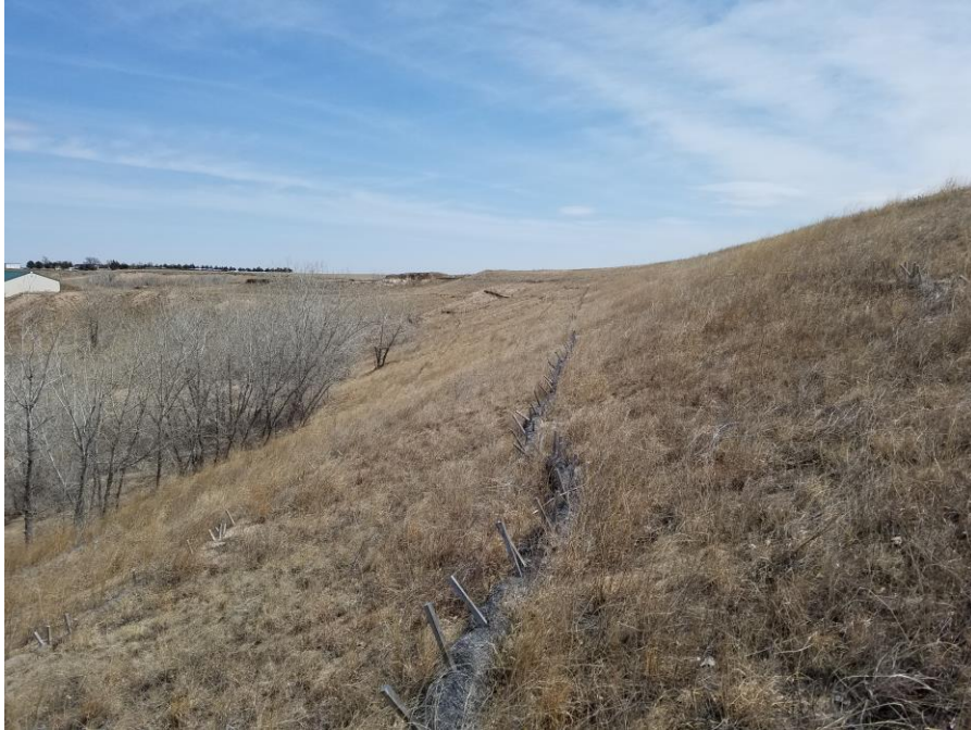
Figure 3. From the southwest corner of the bond release area looking east.